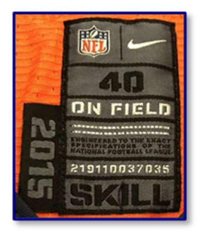
Fig. 15-5. Manufacturer's collar tagging detail (left, from C. Harris' (Nov 29) 2015 home jersey)