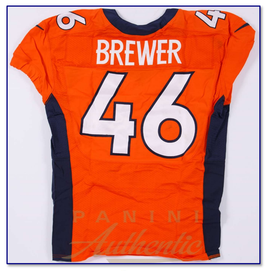
Figs. 15-3 & 15-4. Front and rear view of Aaron Brewer 2015 home jersey, worn Nov 29th