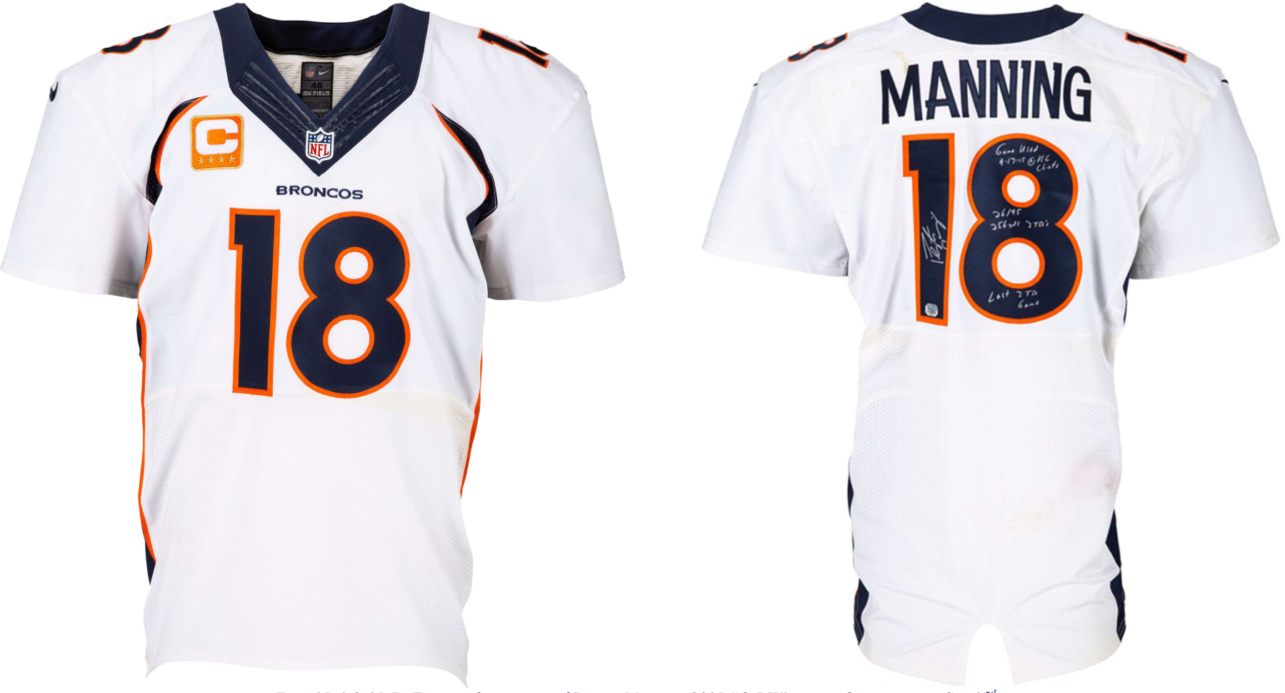
Figs. 15-6 & 15-7. Front and rear view of Peyton Manning 2015 "Q-BK"-cut road jersey, worn Sep 17th