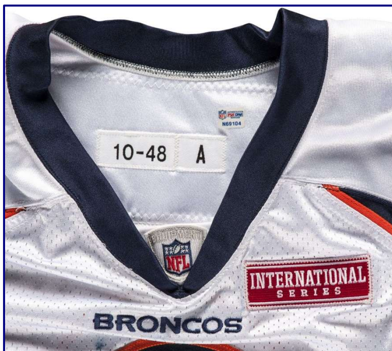
Fig. 10-8. Collar detail from 2010 road jersey with "International Series" patch affixed to left chest, worn Oct. 31 st