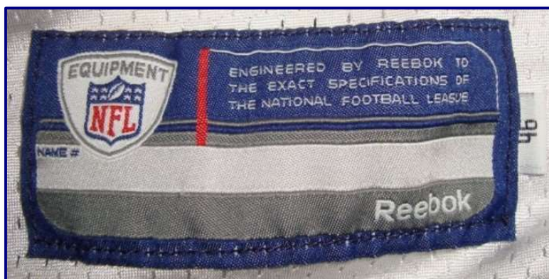
Fig. 10-7. Tail tagging detail from 2010 road jersey