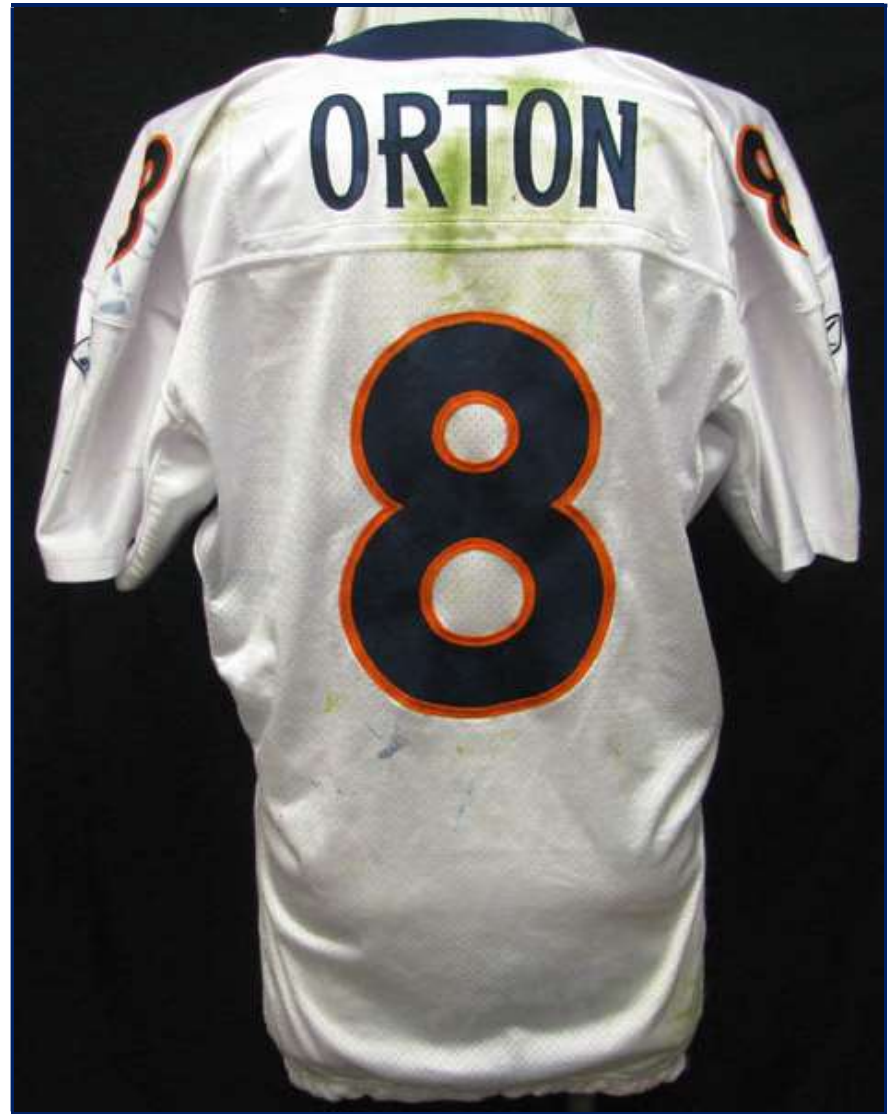
Figs. 10-9 & 10-10. Front and rear views of 2009 home "A"-cut jersey, worn Oct 3rd