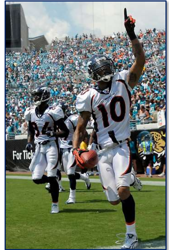
Figs. 10-1, 10-2 & 10-3. 2010 home (Sep 19 & Nov 18) and road (Sep 12) uniforms