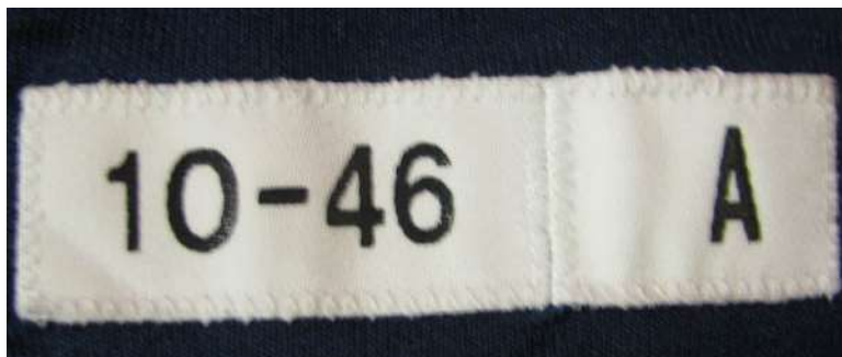
Fig. 10-6. Collar tagging detail from 2010 home jersey