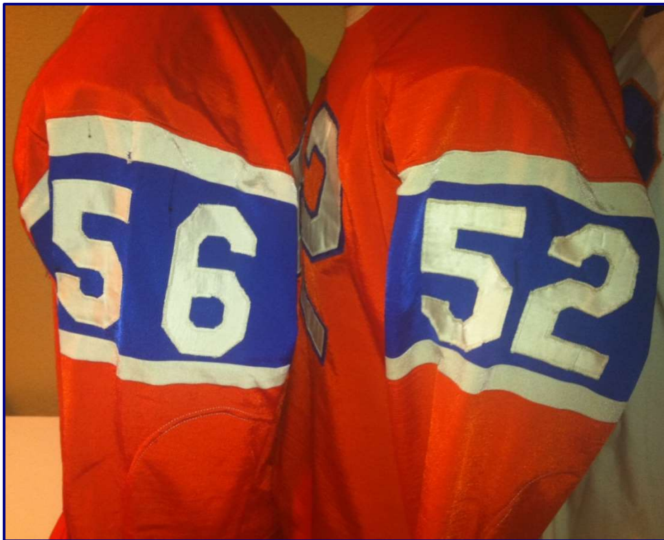
Fig. 65-7. Sleeve detail (with differing fonts) from 1965 (J. Bramlett, 56, left) and 1966 (R. Kubala, 52, right) home jerseys Note difference in font styles of the 5s with the 1965 having a diagonal cut in the '5' of the TV # (vs. the squared '5' of the '66)