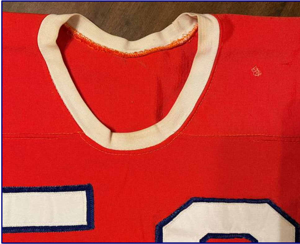
Fig. 65-6. Collar detail from 1965 home jersey