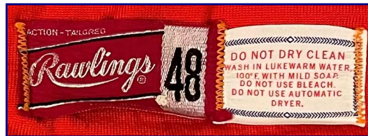
Fig. 65-5. Tagging detail (located inside front tail) from 1965 home jersey