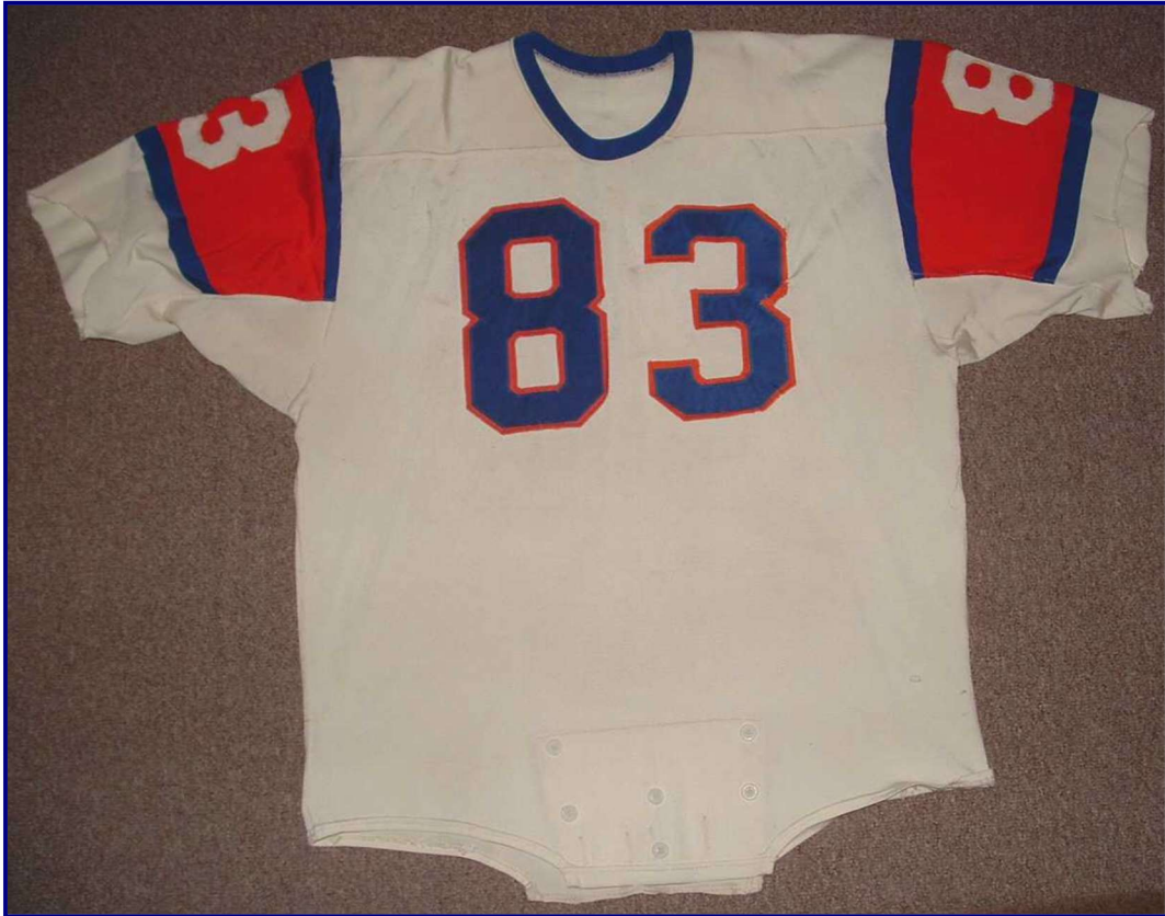
Figs. 65-8 & 65-9. Front (above) and rear (below) views of circa 1965 road jersey (R. Jacobs) c/o Paul Kovacs Note cut sleeves and crotch strap and restored nameplate