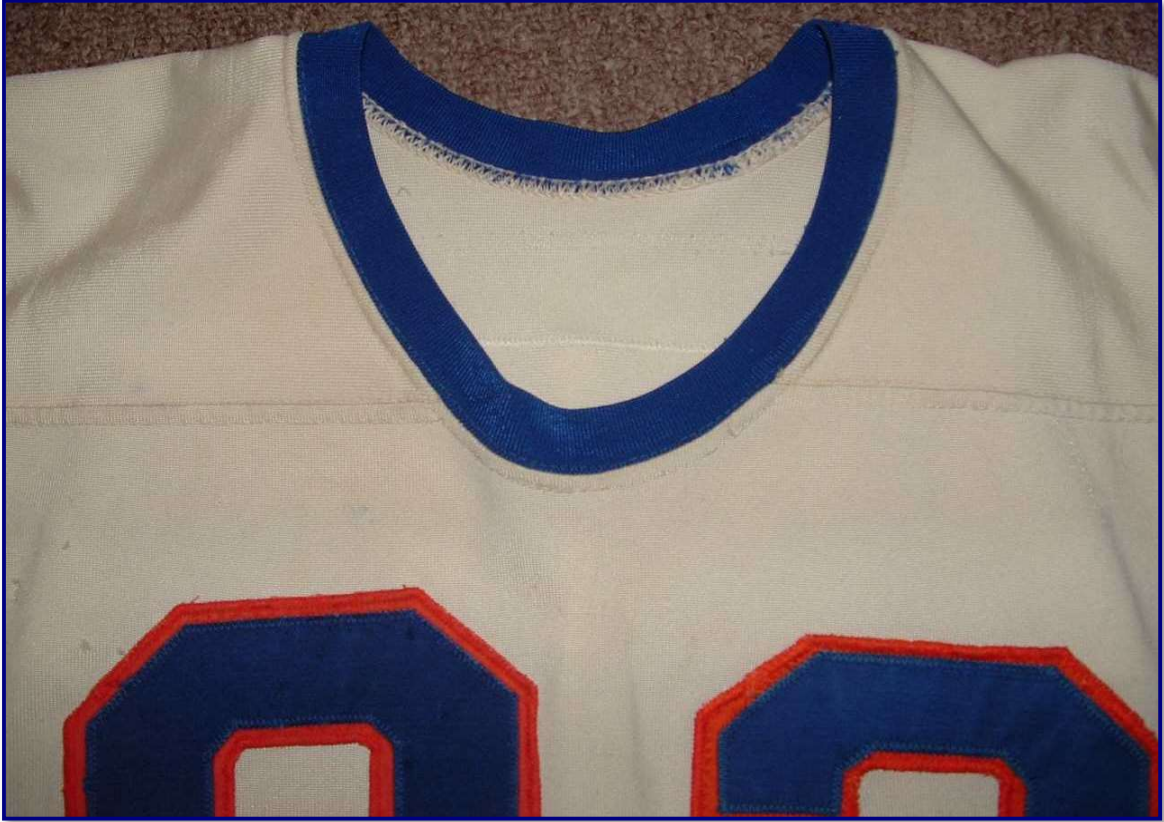
Figs. 65-10 & 65-11. Collar (above) and sleeve (below) detail from circa 1965 road jersey.