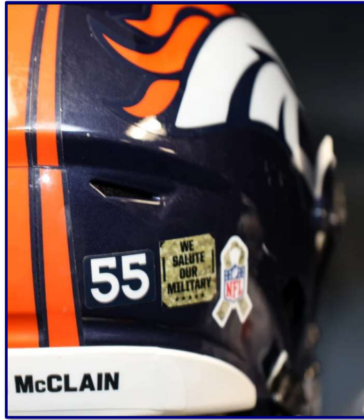
Fig. 20-7. Helmet decals applied (to the left of uni #s) for November's "Salute To Service" campaign