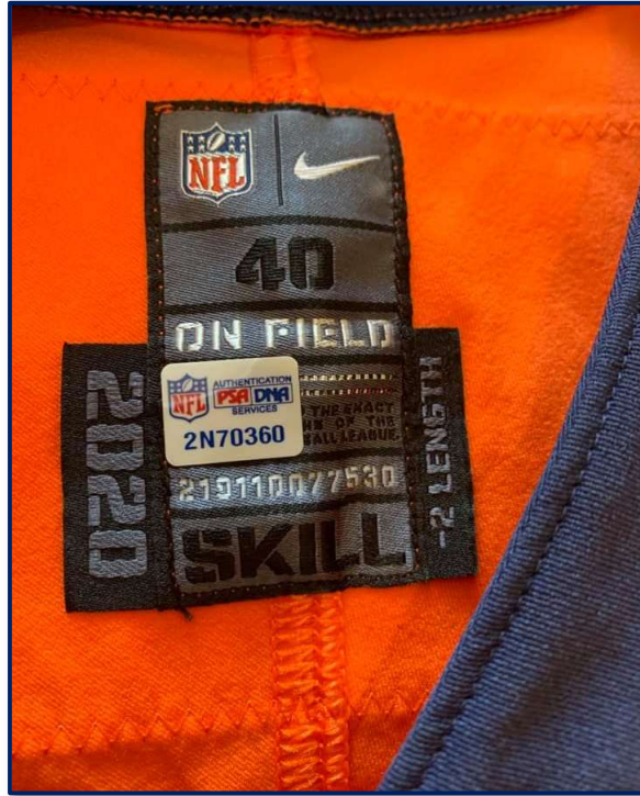
Figs. 20-5. Collar detail from 2020 “skill”-cut home jersey (K. Jackson) showing manufacturer’s tagging.