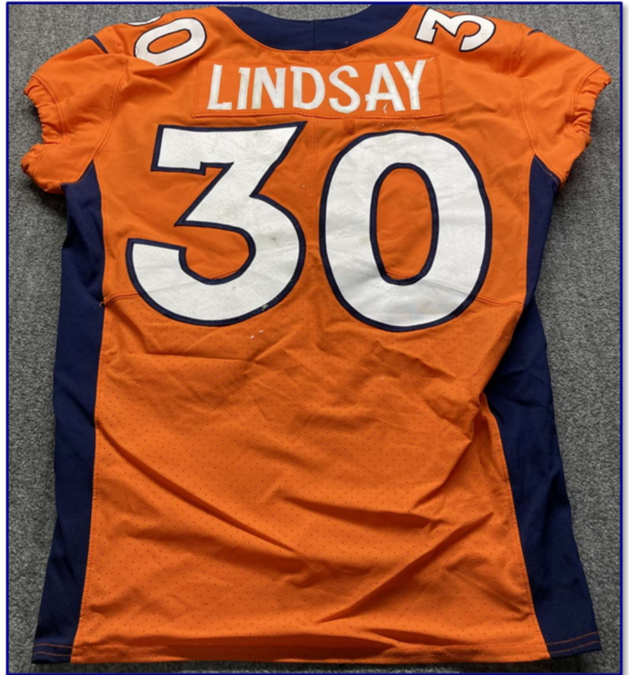
Figs. 20-3 & 20-4. Front and rear views of Philip Lindsay's 2020 home jersey, worn Nov 22 nd