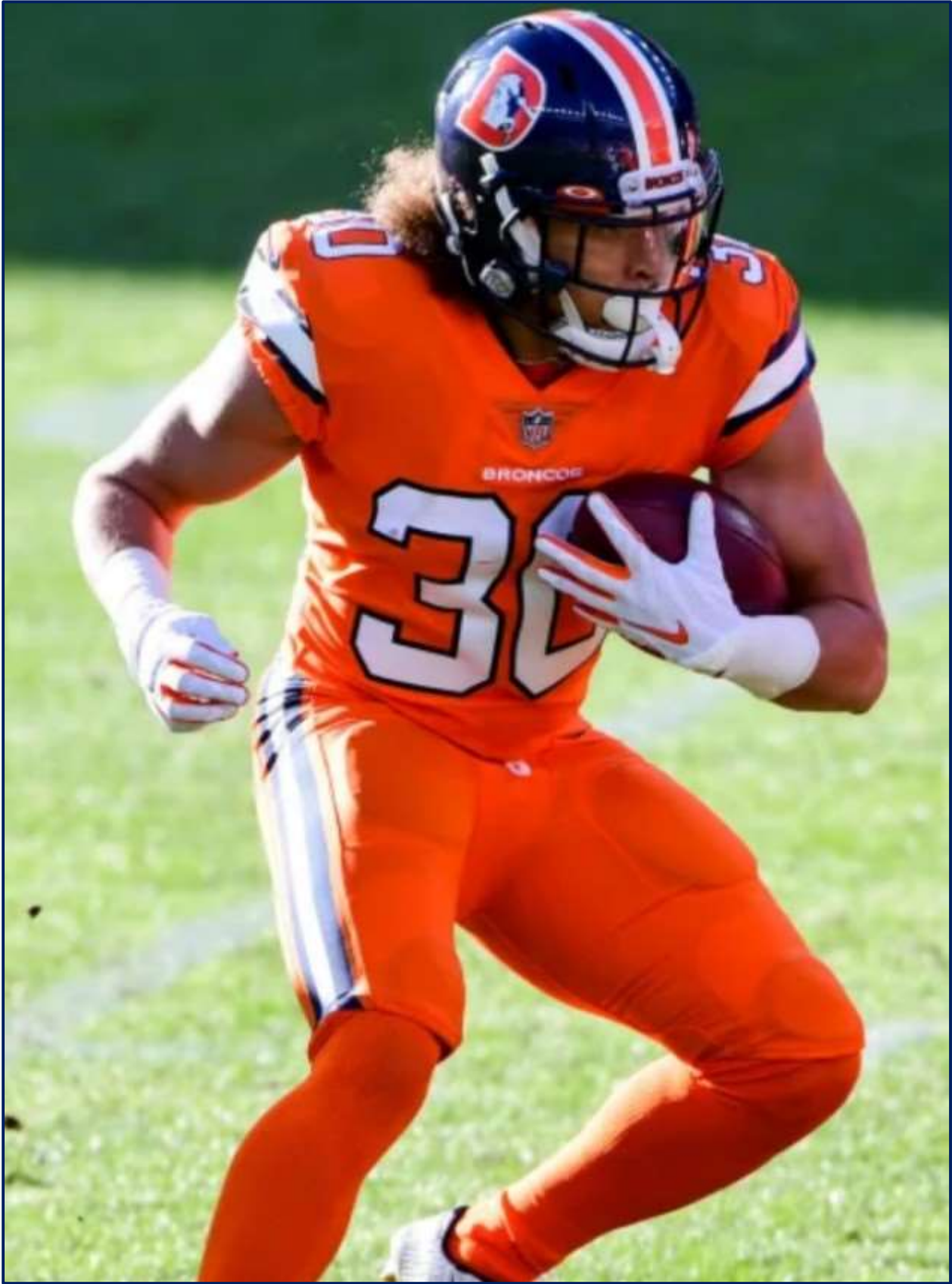
Fig. 20-7. 2020 home alternate/“Color Rush” uniforms worn Dec. 12 th