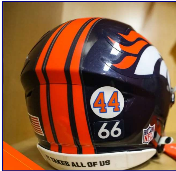
Fig. 20-6. “44” decal applied above player’s uniform # for Jan 3 game in honor of Floyd Little, who passed away Jan 1.