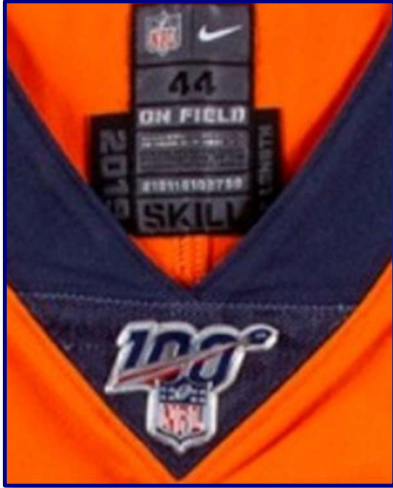
Fig. 19-5. Collar detail from 2019 "skill"-cut home jersey showing manufacturer's tagging and modified 100 NFL shield patch