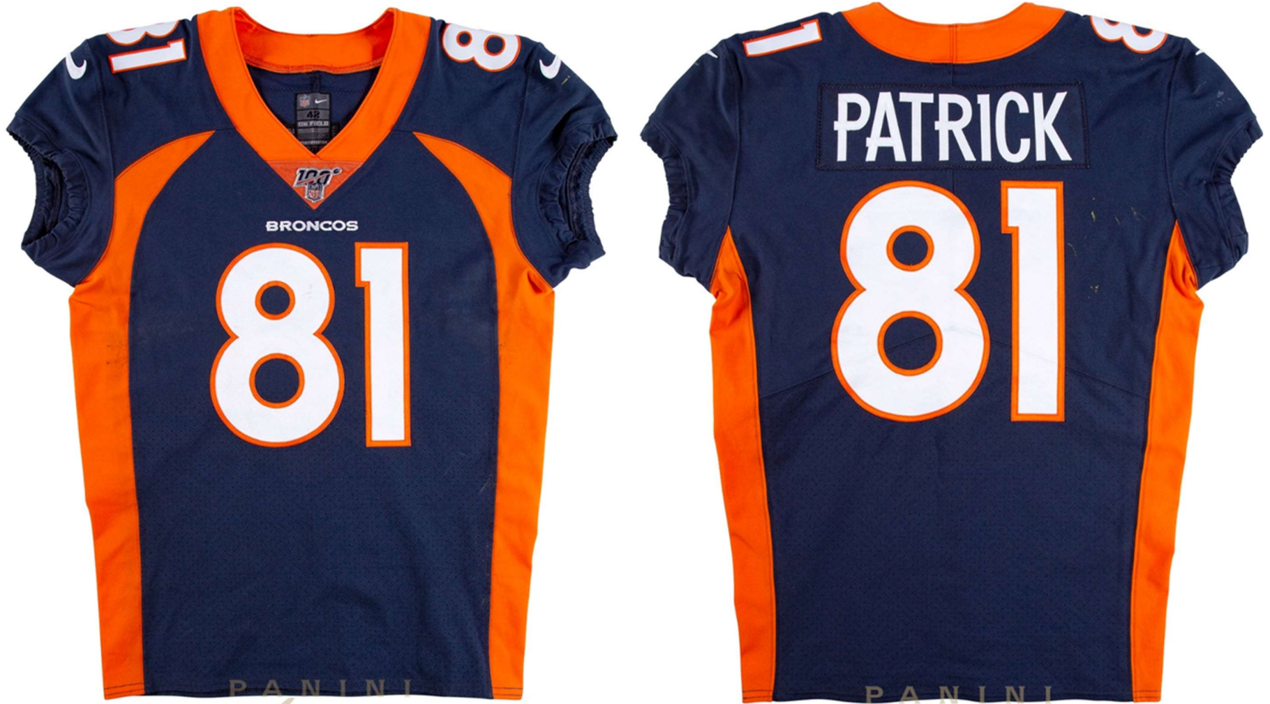
Figs. 19-10 & 19-11. Front and rear views of 2019 alternative home jersey (T. Patrick, Dec 1)