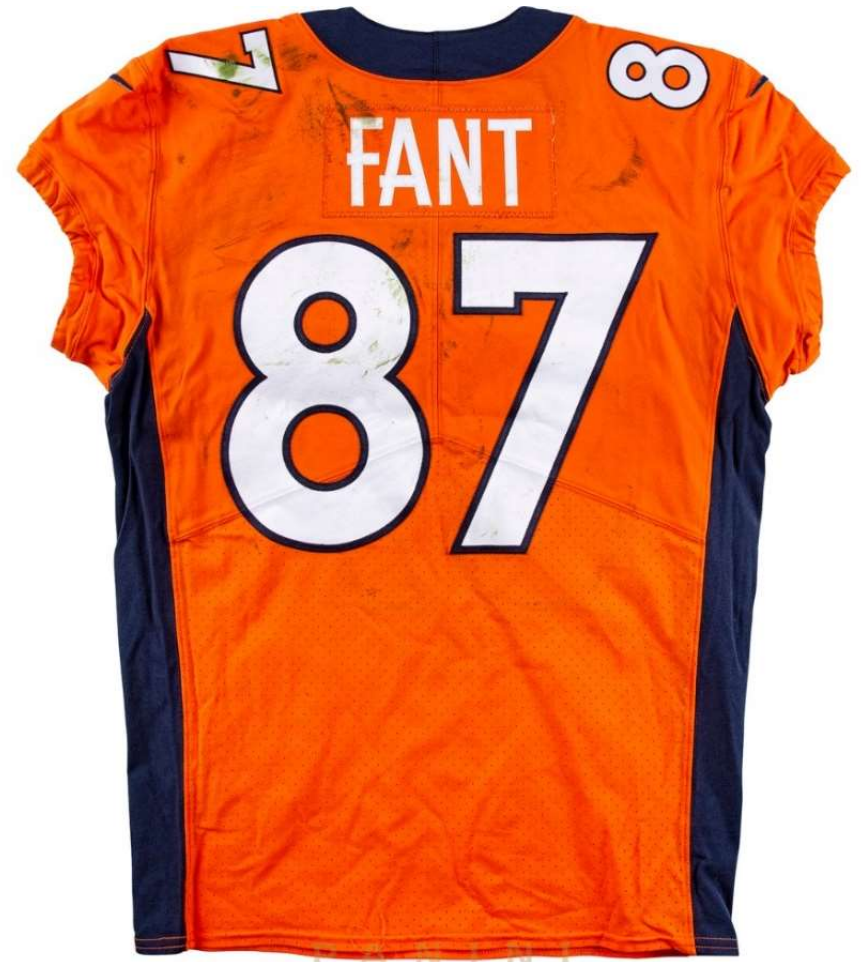
Figs. 19-3 & 19-4. Front and rear views of Noah Fant's 2019 "skill"-cut home jersey, worn Oct 14 th