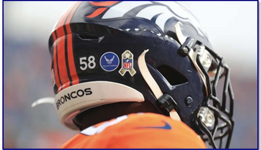
Fig. 19-6. Decal for various branches of service and the modified NFL shield (atop camouflaged ribbon) adorn helmets during November's "Salute To Service"