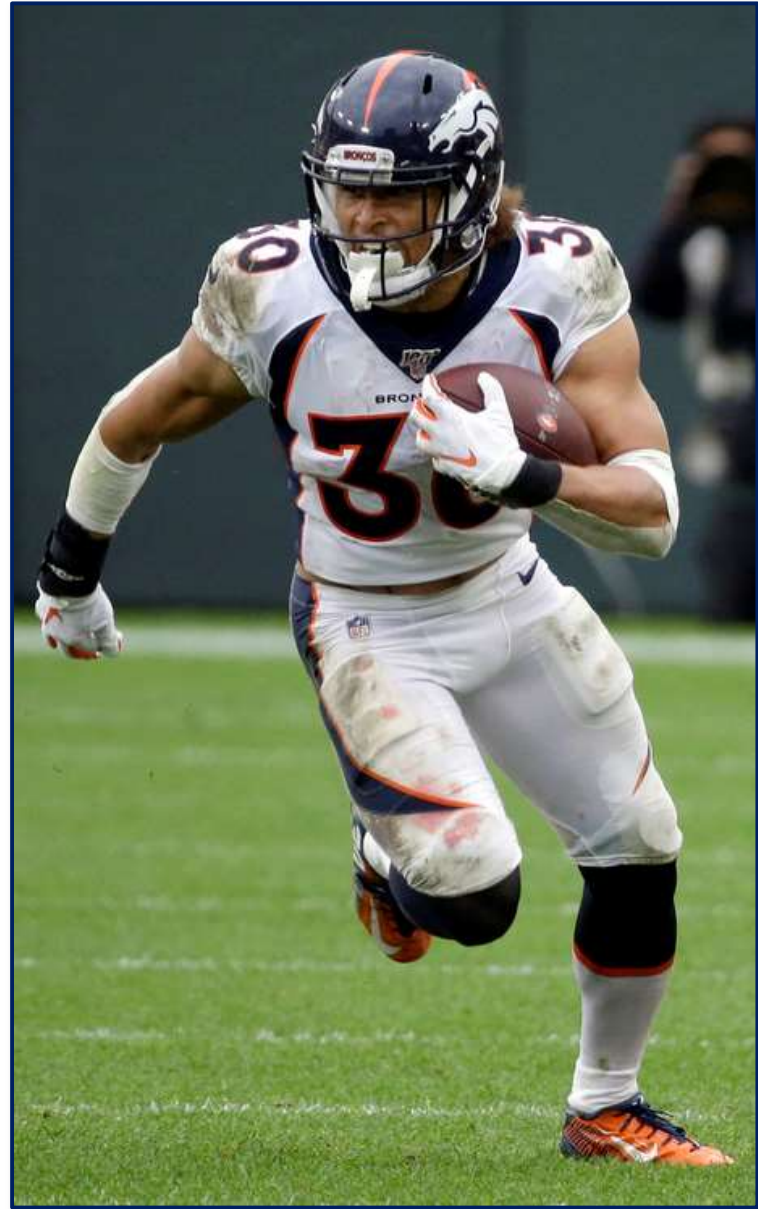
Figs. 19-1 & 19-2. 2019 home (Sep 29) and road (Sep 22) uniforms.