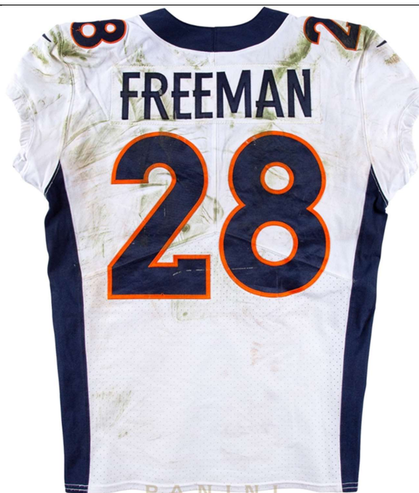
Figs. 19-7 & 19-8. Front and rear views of 2019 road jersey (R. Freeman, Sep 19)