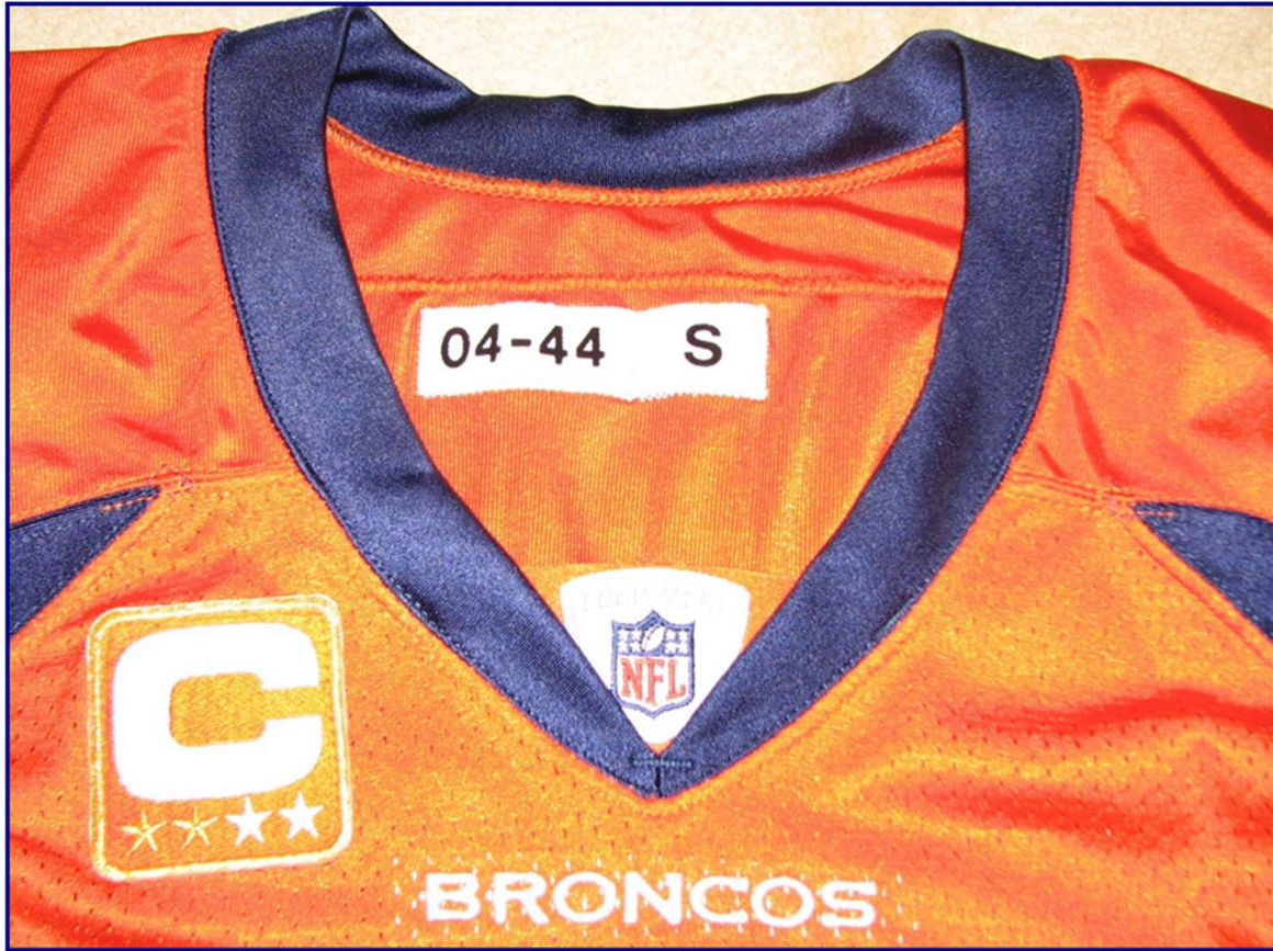
Fig. 08-9. Collar detail from 2008 home alternate jersey, worn Sep 21 st . Note "04" year tagging, indicates being recycled from 2004 use (as were a number of other player's jerseys). NFL Equipment patch updated with new NFL logo and captain's "C" patches added (2 gold stars indicating 2 nd -year captains; worn by C. Bailey & J. Cutler)