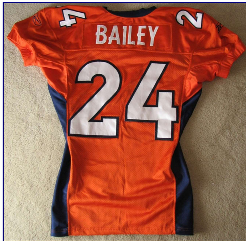
Figs. 08-7 & 08-8. Front and rear views of 2008 "S" (skill)-cut alternate home jersey (C. Bailey) worn Sep 21 st