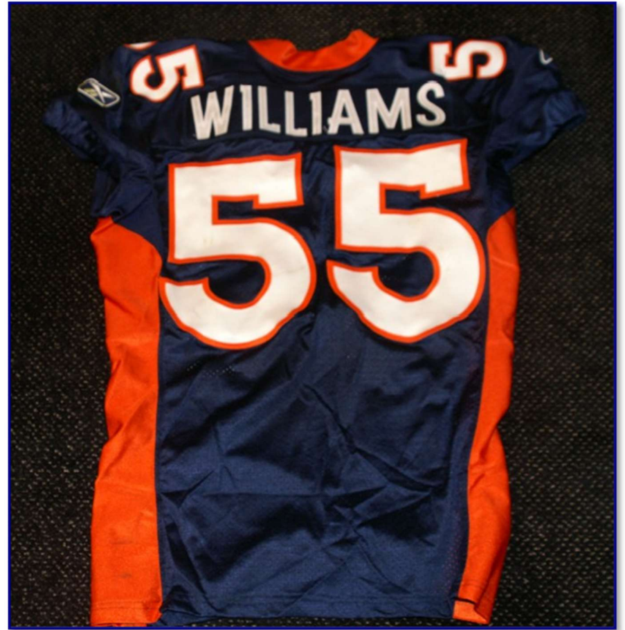
Figs. 08-3 & 08-4. Front and rear view of 2004 "D" (defensive)-cut home jersey (D. Williams), worn Sep 14 th