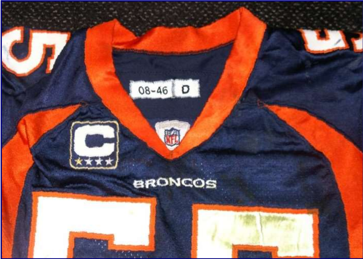
Fig. 08-5. Collar detail from 2006 home jersey