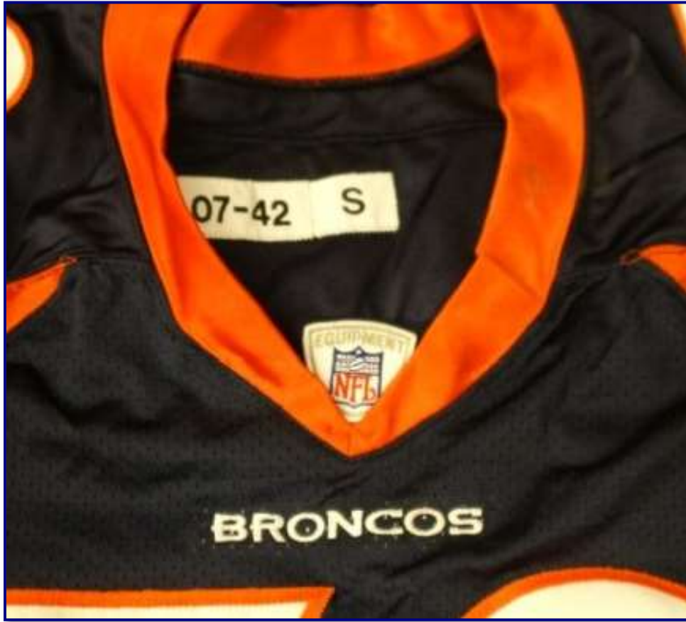
Figs. 07-6. Collar detail from 2007 home jersey