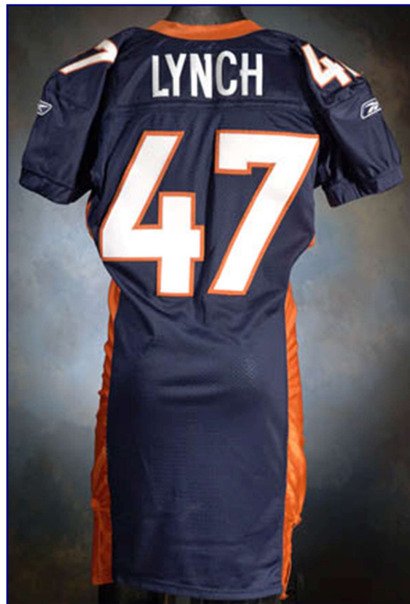
Figs. 04-3 & 04-4. Front and rear views of 2004 home "skill" jersey (J. Lynch)