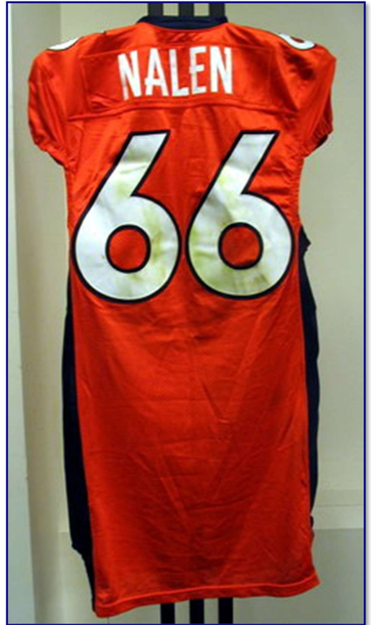
Figs. 04-8 & 04-9. Front and rear views of 2004 home alternate "O" (offensive lineman)-cut jersey (T. Nalen)