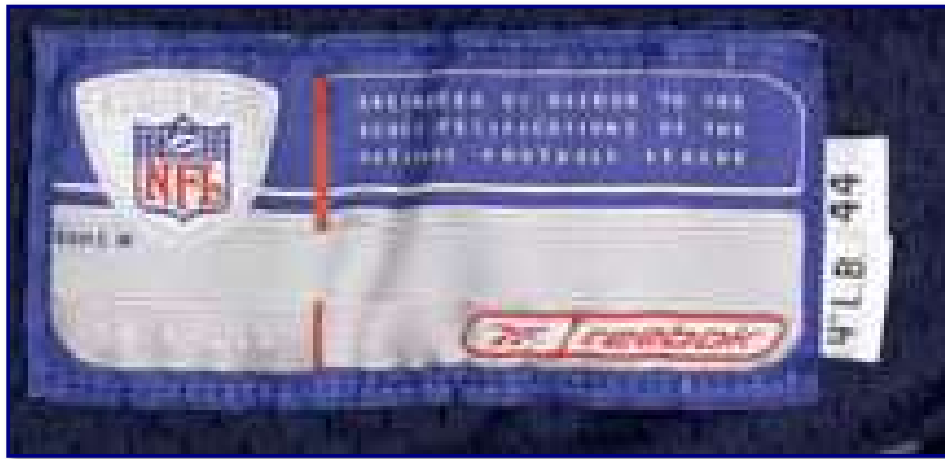
Fig. 04-6. Manufacturer's tail tagging detail from 2004 home jersey