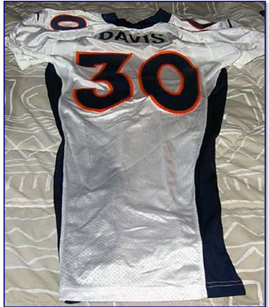
Figs. 00-4 & 00-5. Front and rear views of 2000 road jersey (T. Davis)