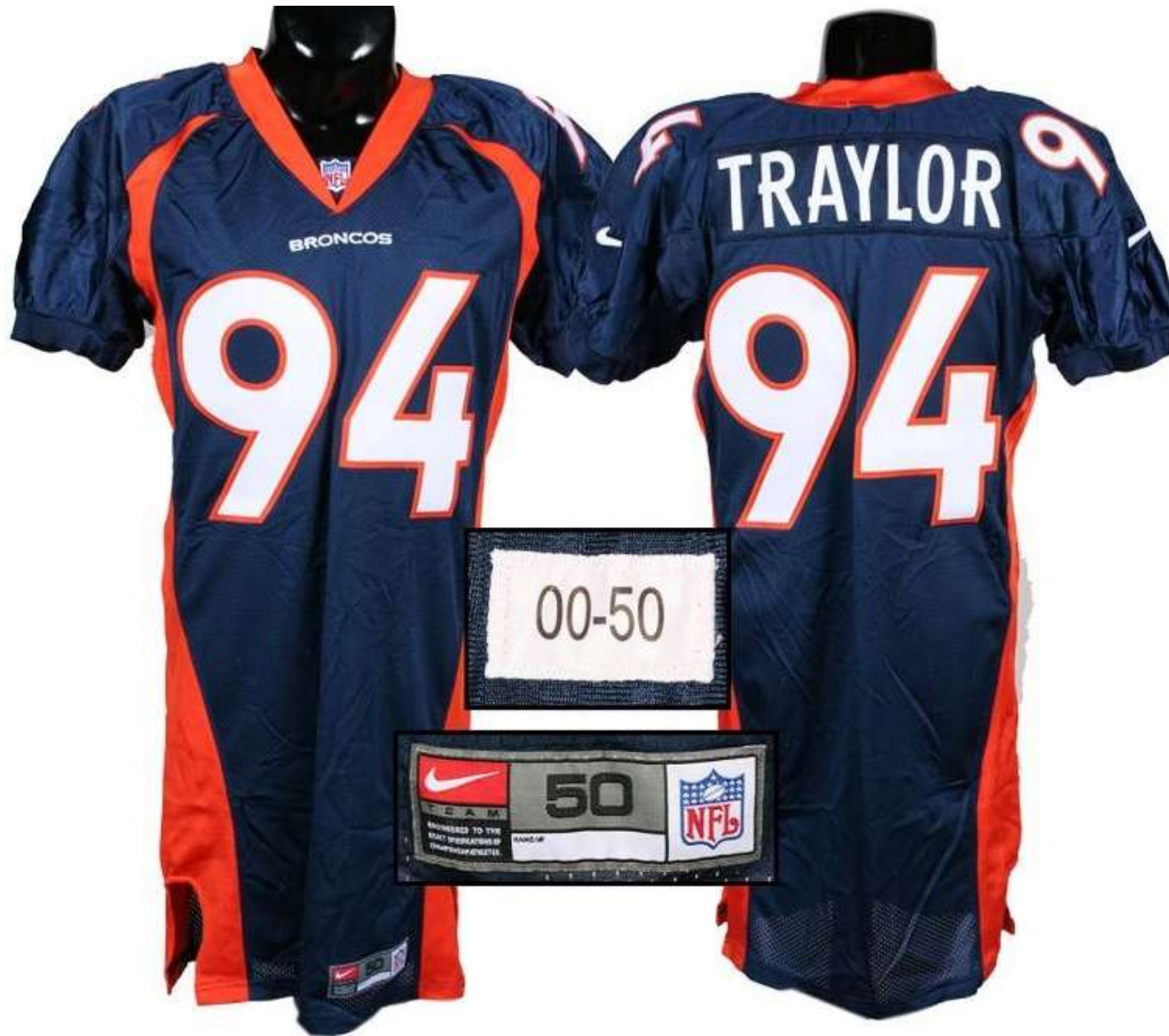
Fig. 00-3. Front, rear and tagging detail (inset) views of 2000 home jersey (K. Traylor)