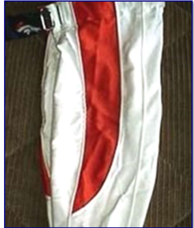
Figs. 00-8 & 00-9. Front and side views of 2000 Nike home pants