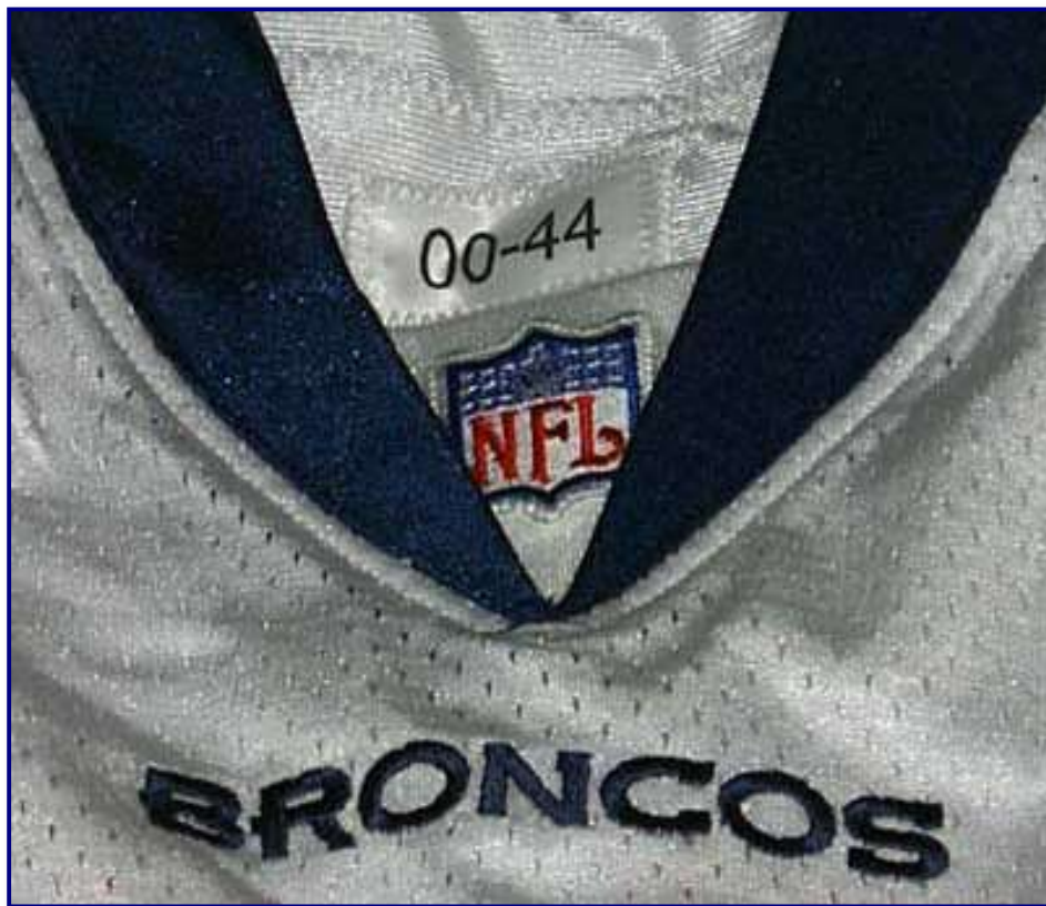
Fig. 00-7. Collar detail from 2000 road jersey