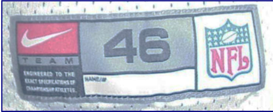
Fig. 00-6. Manufacturer's tail tagging detail from 2000 road jersey