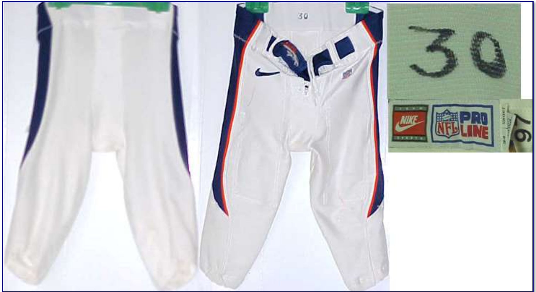
Fig. 97-12. Rear/front views and tagging detail (inset) of 1997 road pants