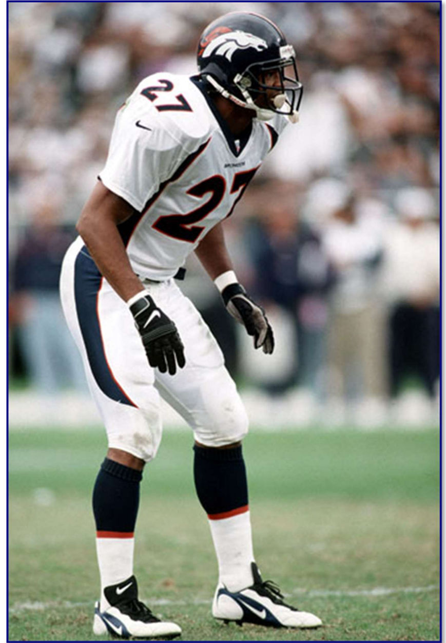
Figs. 97-1 & 97-2. 1997 home and road uniforms