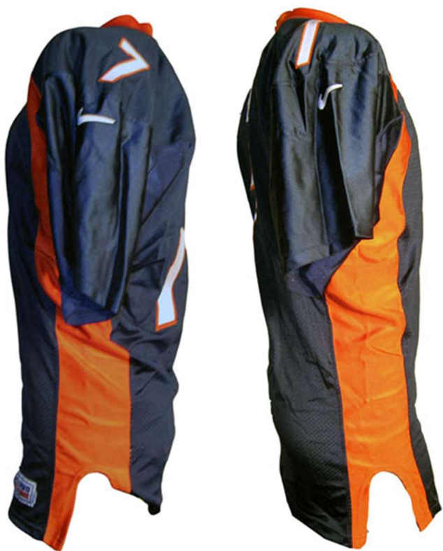
Figs. 97-7 & 97-8. Left and right side views of 1997 home jersey