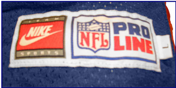
Fig. 97-5. Manufacturer's tagging detail from 1997 home jersey