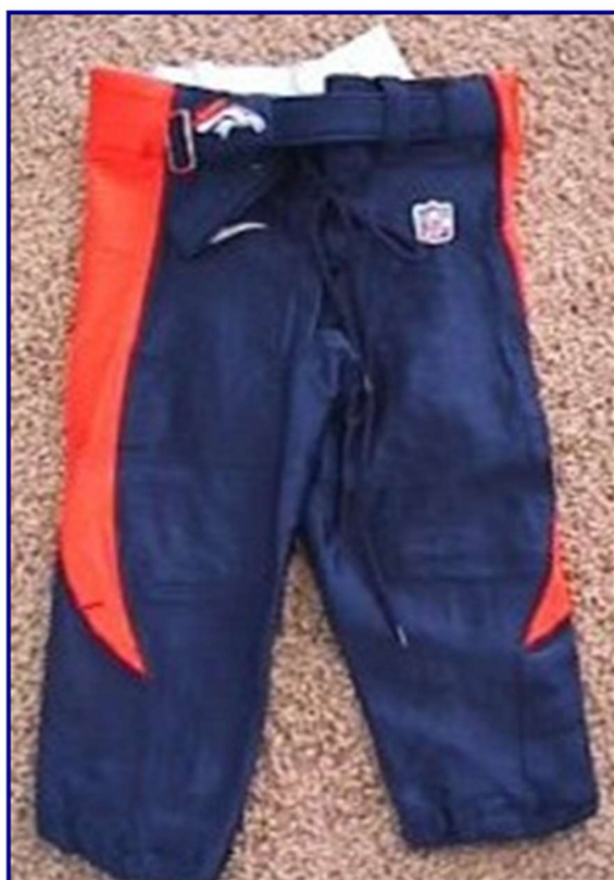
Fig. 97-9. Navy pants for alternate home uniform (worn Jul 26 and Aug 23, during '97 pre-season only)