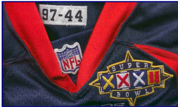
Fig. 97-6. Collar & tagging detail from 1997 home jersey (Note shoulder patch worn for Super Bowl XXXII on 1/25/98)