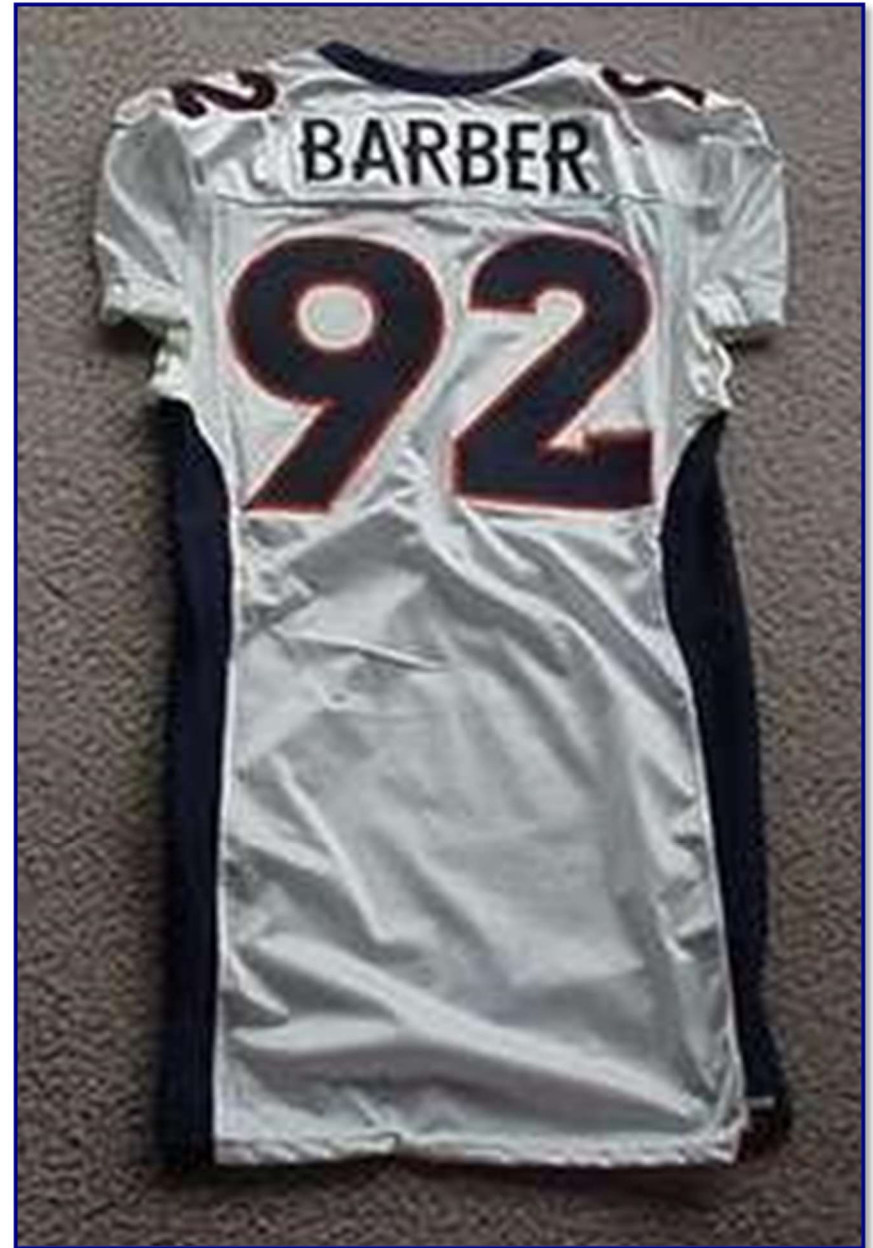
Figs. 97-10 & 97-11. Front and rear views of team-issued 1997 road jersey