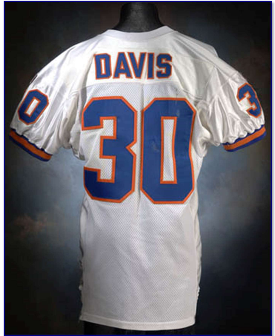
Fig 95-9 & 95-10. Front and rear view of 1995 road jersey (note sizing "flag" tag at right of manufacturer's tag)