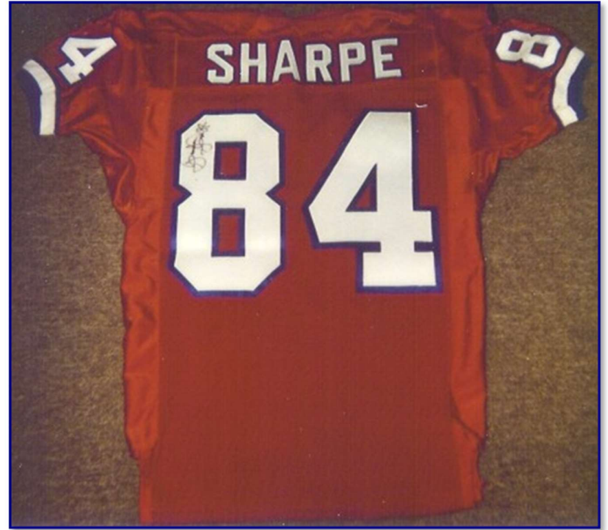
Figs 95-3 & 95-4. Front and rear views of 1995 home jersey (S. Sharpe)