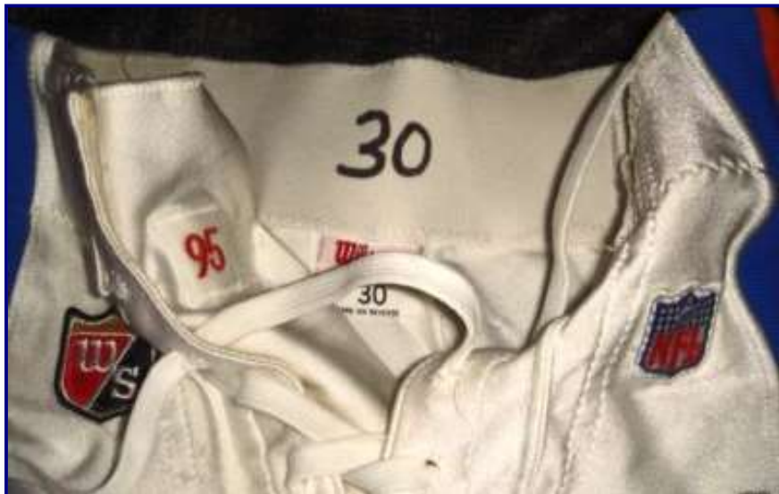
Fig. 95-12. Size flag tag below waist at rear; year tag sewn inside right fly