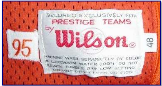
Figs. 95-5 & 95-6. 1995 home jersey tagging detail (Note variations in embroidery stitching color on year tags)