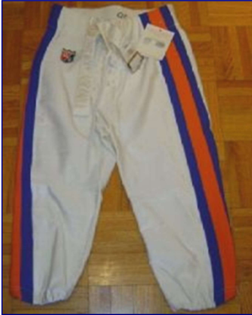
Fig. 95-11. 1995 pants with Wilson Sport patch on right hip