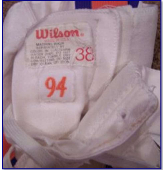
Figs. 94-13 & 94-14. 1994 uniform pants and tagging detail