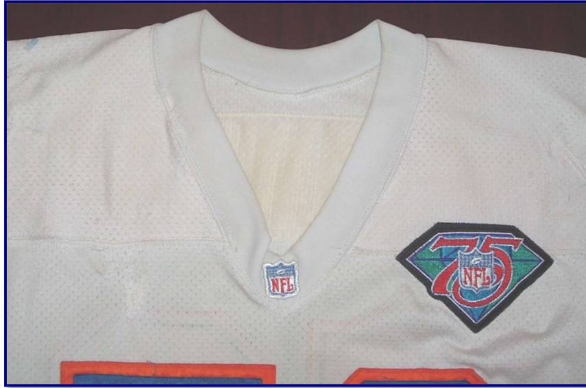
Figs. 94-9 & 94-10. Collar(above) and nameplate (below) detail of 1994 road jersey