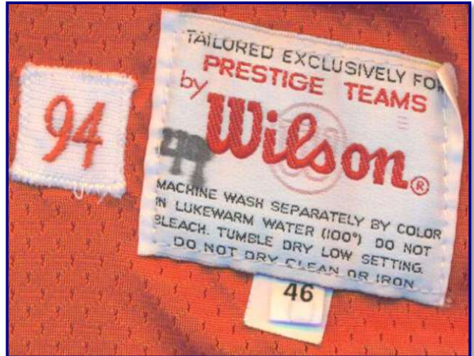
Fig. 94-6. Tagging detail of 1994 home jersey (D. Smith)