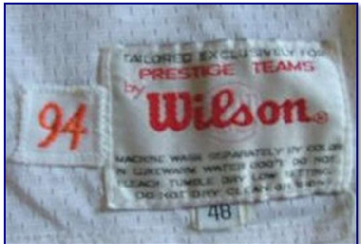
Figs. 94-11 & 94-12. Sleeve (left) and tagging (above) detail from 1994 road jersey