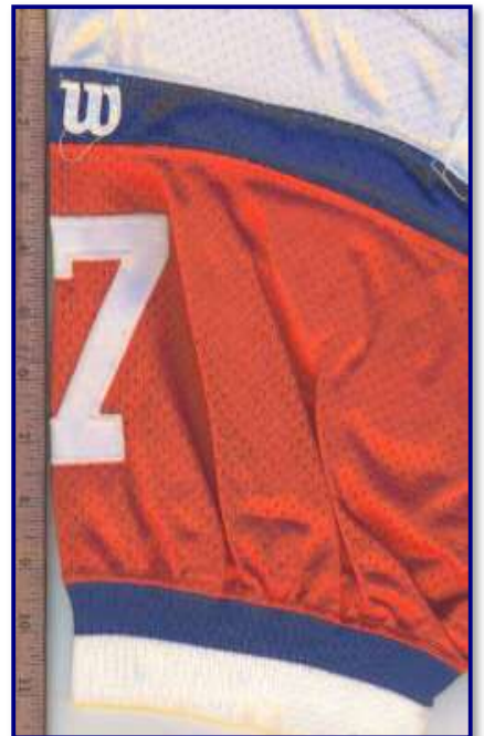
Figs. 94-17 & 94-18. Rear view and sleeve detail of 1994 road "Throwback" jersey (See Notes above)