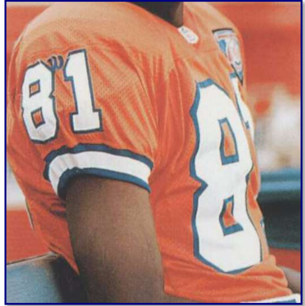
Figs. 94-3 & 94-4. Rear view and sleeve detail of 1994 home jerseys. Note variations in sleeve striping applications with heat-cured vinyl on open sleeves of QB jersey (left) and ribbed-knit elastic on sleeve at right.