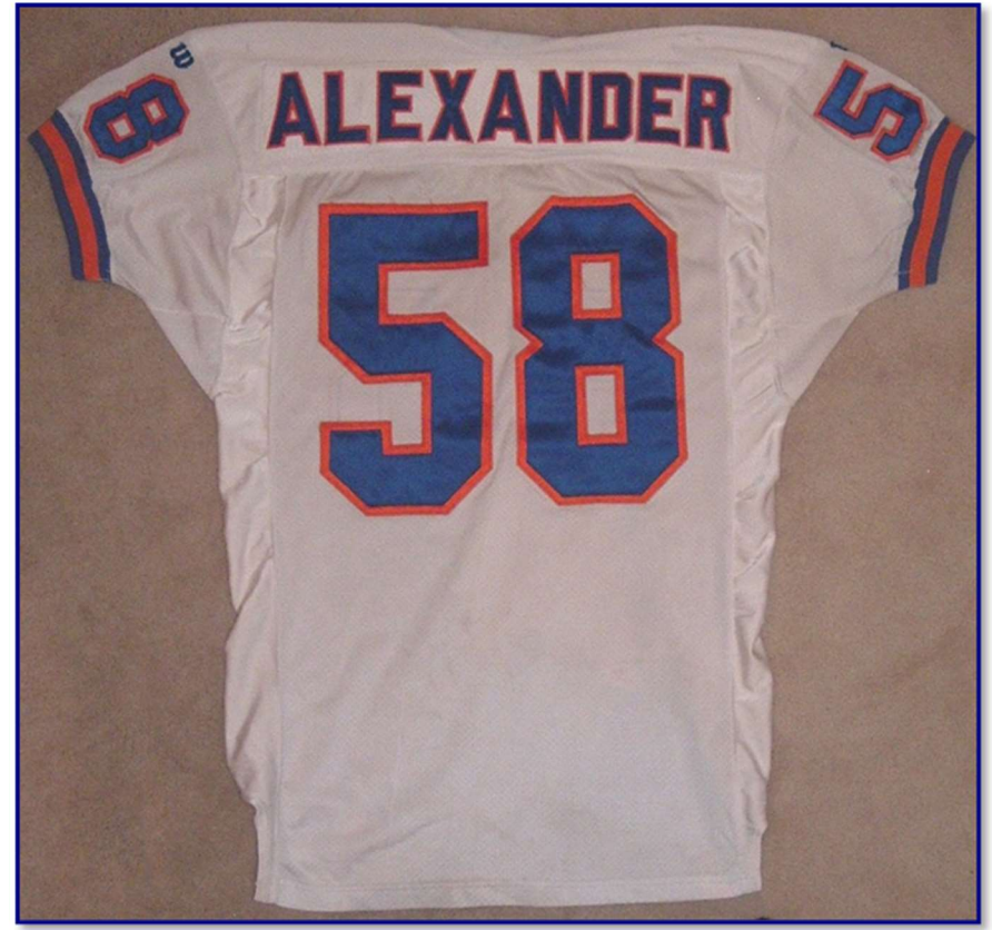
Figs. 94-7 & 94-8. Front and rear views of 1994 road jersey (E. Alexander)