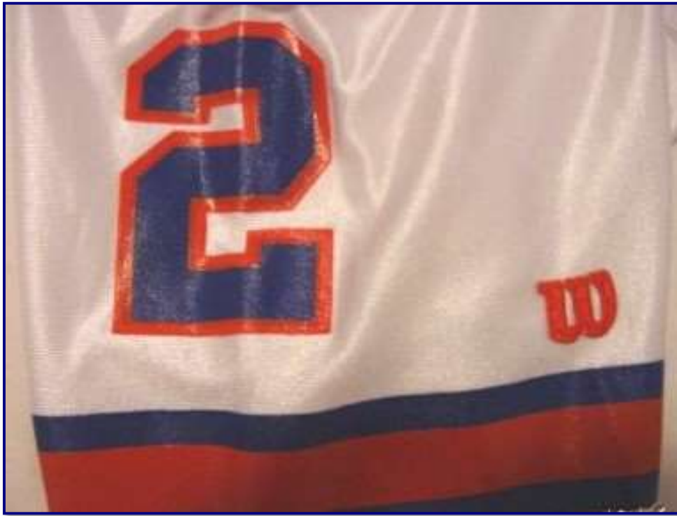
Fig. 93-11. Sleeve detail of 1993 road jersey