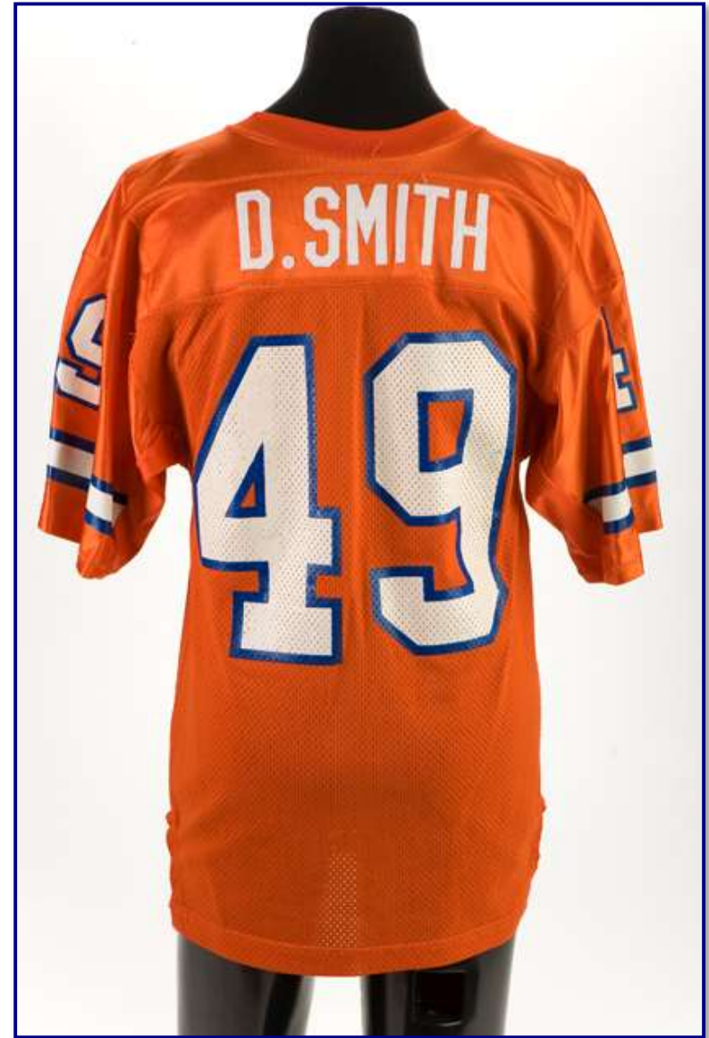
Figs. 93-3 & 93-4. Front and rear views of 1993 home jersey