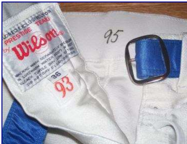
Fig. 93-14. Pants' tagging including manufacturer's tagging with sizing "flag" tag (i.e. 36) sewn beneath, and year tag below.

Note: player's uni # (i.e. 95) is often found written into waist