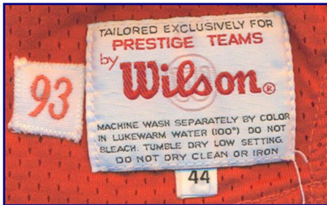
Fig. 93-6. Year, manufacturer's and size tagging detail from 1993 home jersey (note placement of size flag tag below manufacturer's tagging)