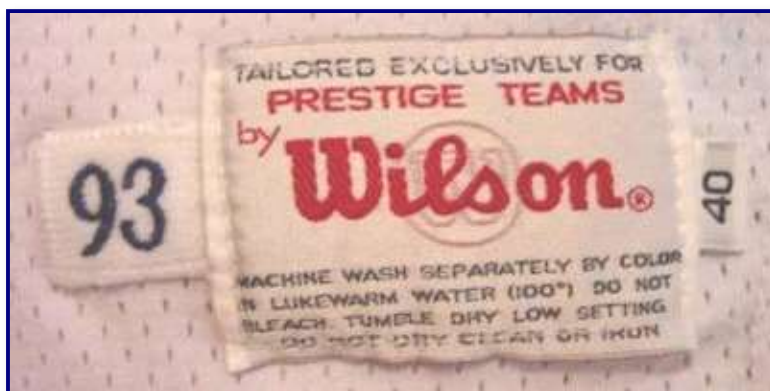
Figs. 93-10. Manufacturer's tagging detail from 1993 road jersey with placement of size flag tag to the side of manufacturer's tagging