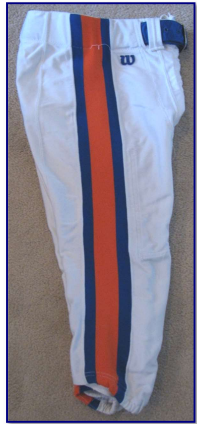
Figs. 93-12 & 93-13. Front and (left) side views of 1993 game pants