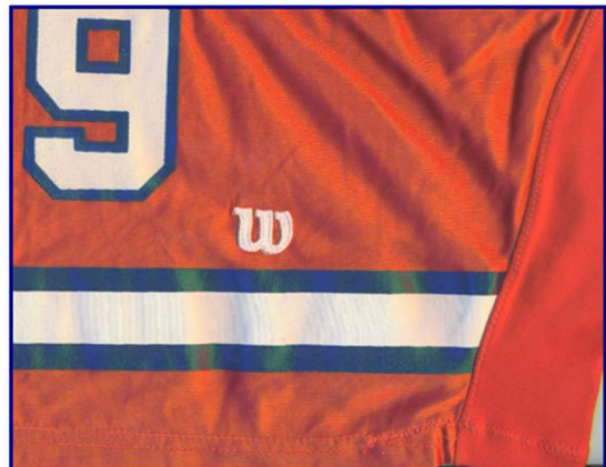
Fig. 93-7. Sleeve detail of 1993 home jersey with "W" logo shifted 4" to front of center