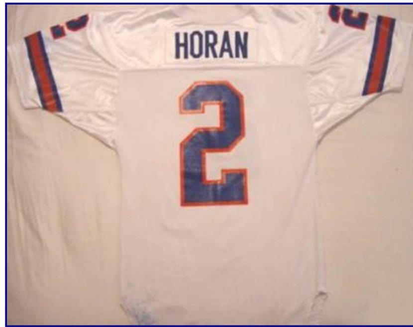
Figs. 93-8 & 93-9. Front and rear views of 1993 road jersey (M. Horan)