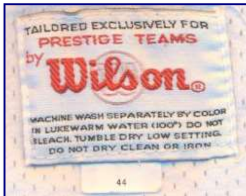
Figs. 92-13. Manufacturer's tagging detail from 1992 road jersey