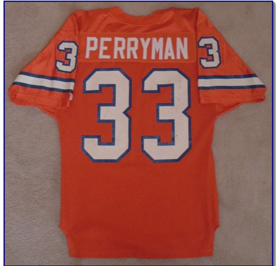
Figs. 92-3 & 92-4. Front and rear views of 1992 home jersey (R. Perryman)