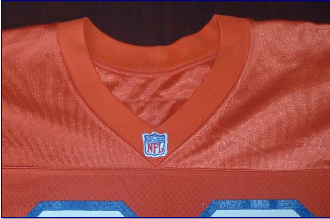
Figs. 92-5 & 92-6. Collar (above) and nameplate (below) detail of 1992 home jersey. Note NFL shield patch affixed on collar (see above)