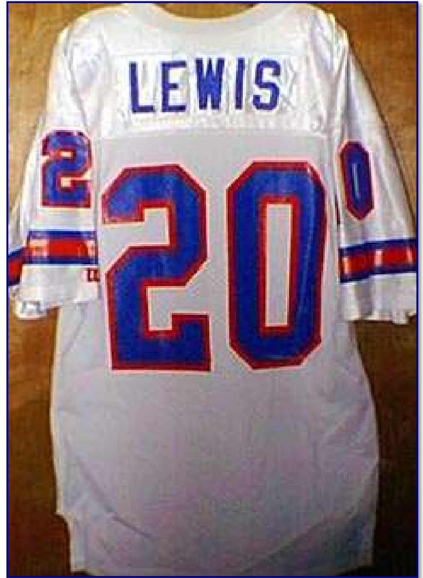
Figs. 92-9 & 92-10. Front and rear views of 1992 road jersey (G. Lewis)