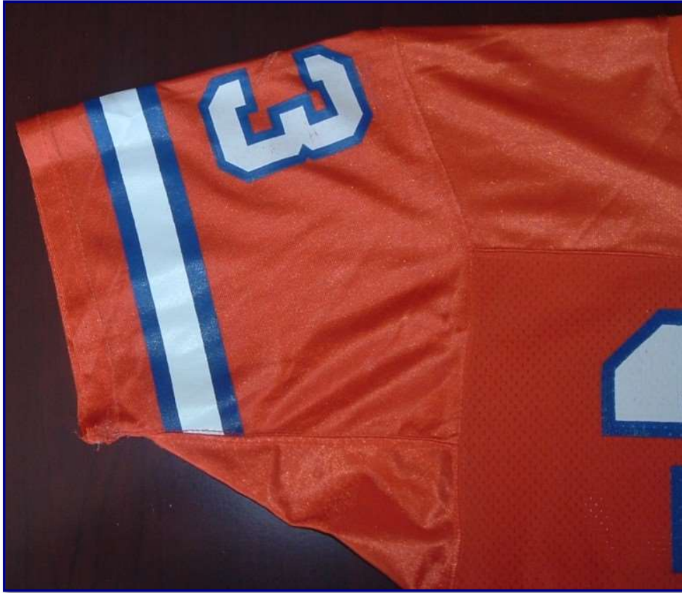
Figs. 92-7 & 92-8. Sleeve (above) and manufacturer's tagging (below) detail from 1992 home jersey