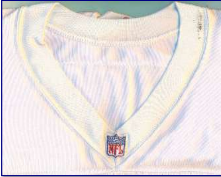
Figs. 92-11 & 92-12. Collar (G. Lewis, above) and sleeve detail (M. Young, below) of 1992 road jerseys