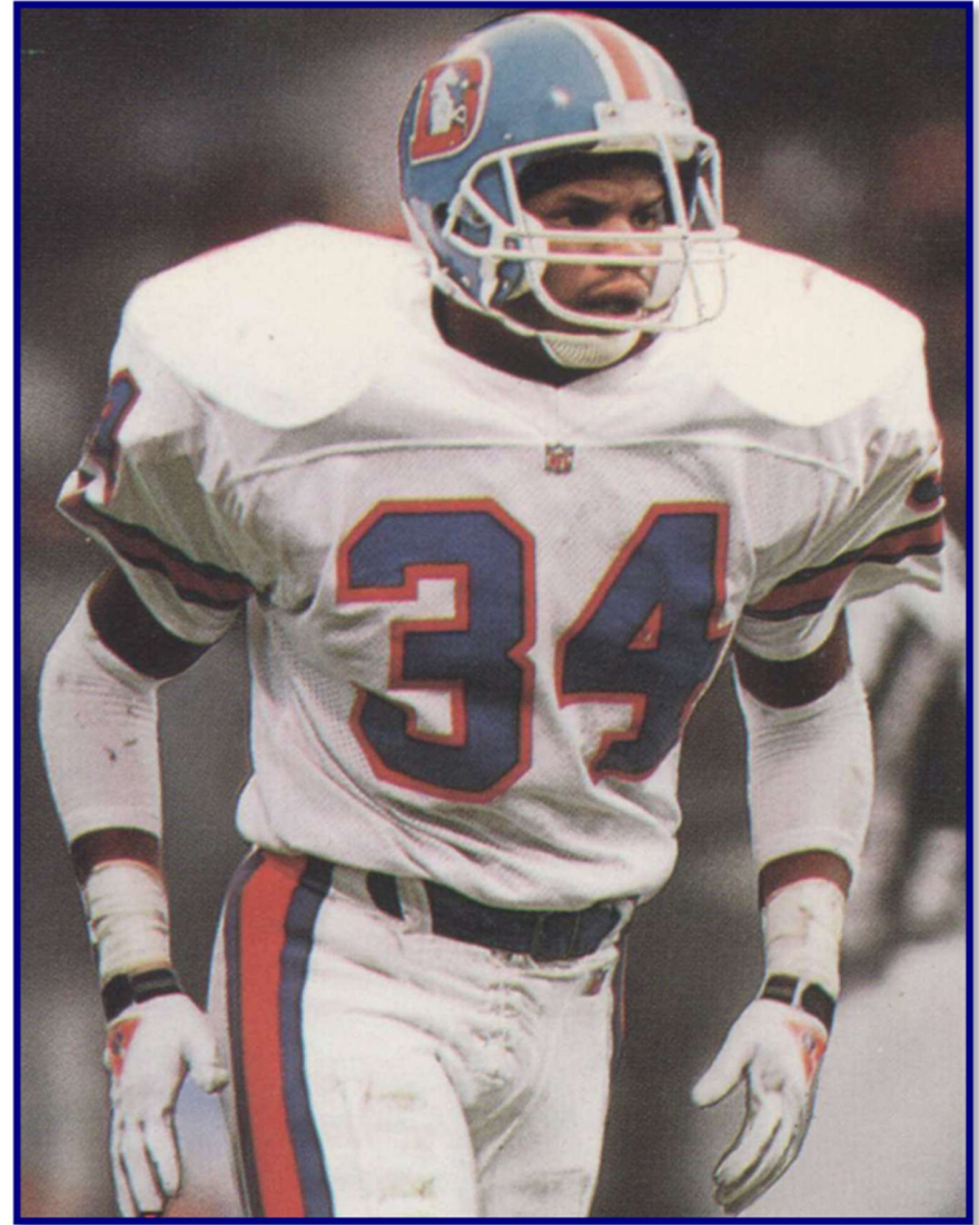
Fig. 91-2. 1991 road uniform