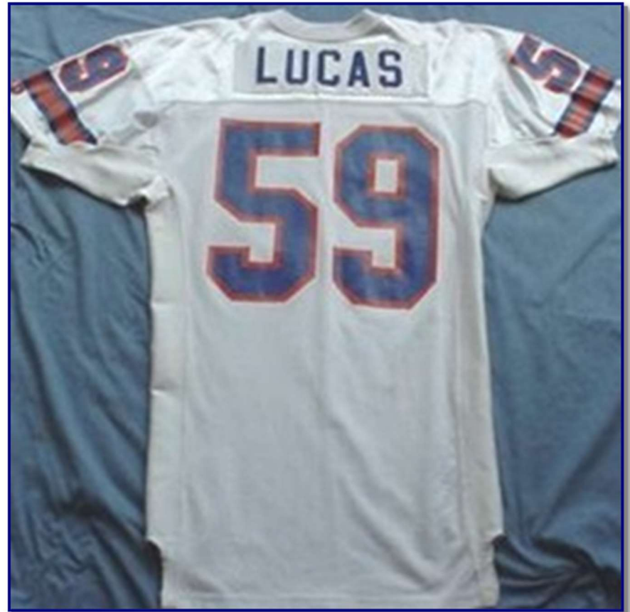
Figs. 91-6 & 91-7. Front and rear views of 1991 Broncos' road jersey (T. Lucas)