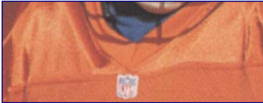
Fig. 91-5. Collar detail of 1991 home jersey with NFL shield patch affixed below neckband