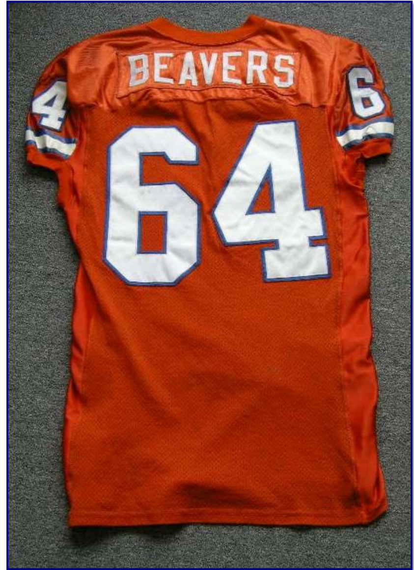
Figs. 90-3 & 90-4. Front and rear views of circa 1990 home jersey