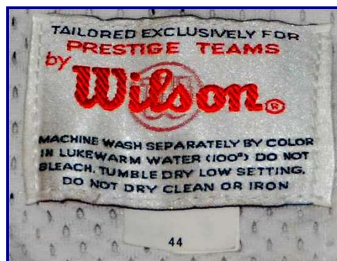
Fig. 90-10. Manufacturer's tail tagging detail from circa 1990 road jersey