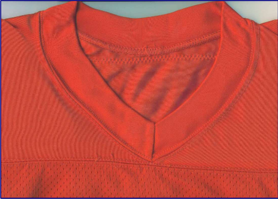
Figs 90-5. Collar (above, J. Elway) and nameplate (below, S. Beavers) detail from 1990 home jerseys