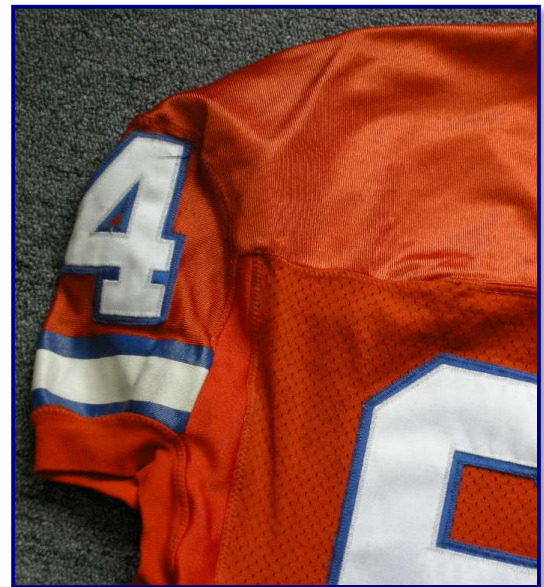
Figs. 90-8 & 90-9. Sleeve detail from 1990 home jerseys. Hemmed open-style (Elway, left); ribbed-knit lineman's-style (Beavers, right)