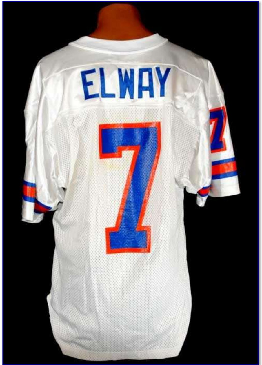
Figs. 90-11 & 90-12. Front and rear views of circa 1990 road jersey