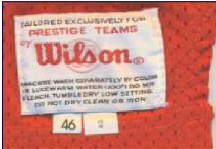
Fig. 90-7. Manufacturer's tail tagging detail from 1990 home jersey (Note: "CV" date tag identifies manufacturer in Aug '90)