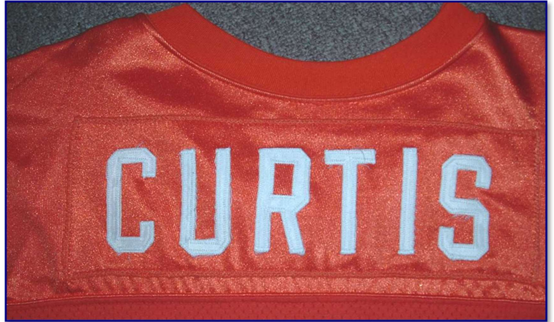
Figs. 89-6 & 89-7. Sleeve and nameplate detail from circa 1989 home jersey