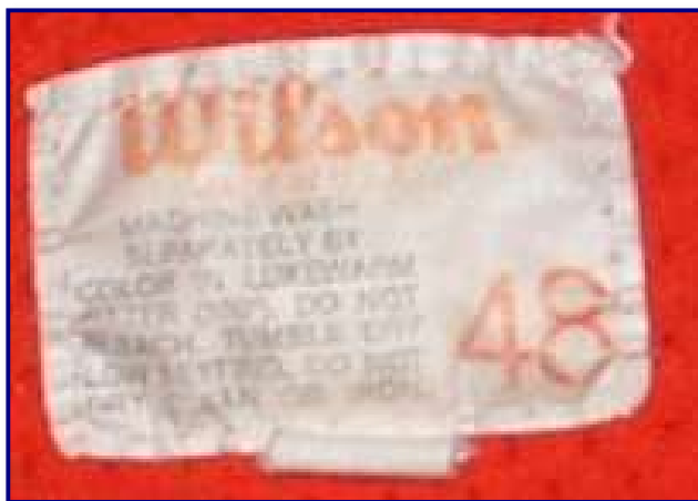
Fig. 89-5. Manufacturer's tagging detail from circa 1989 home jersey