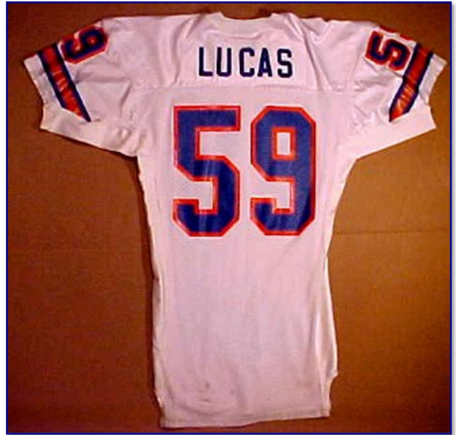
Figs 89-7 & 89-8. Front and rear view of circa 1989 road jersey (T. Lucas)