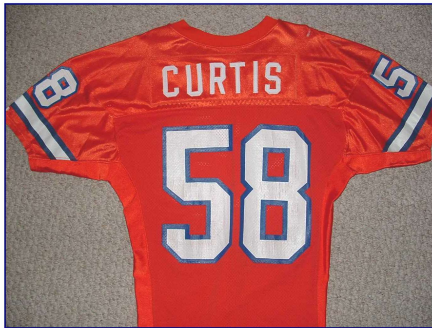
Figs. 89-3 & 89-4. Front and rear views of circa 1989 home jersey (S. Curtis)