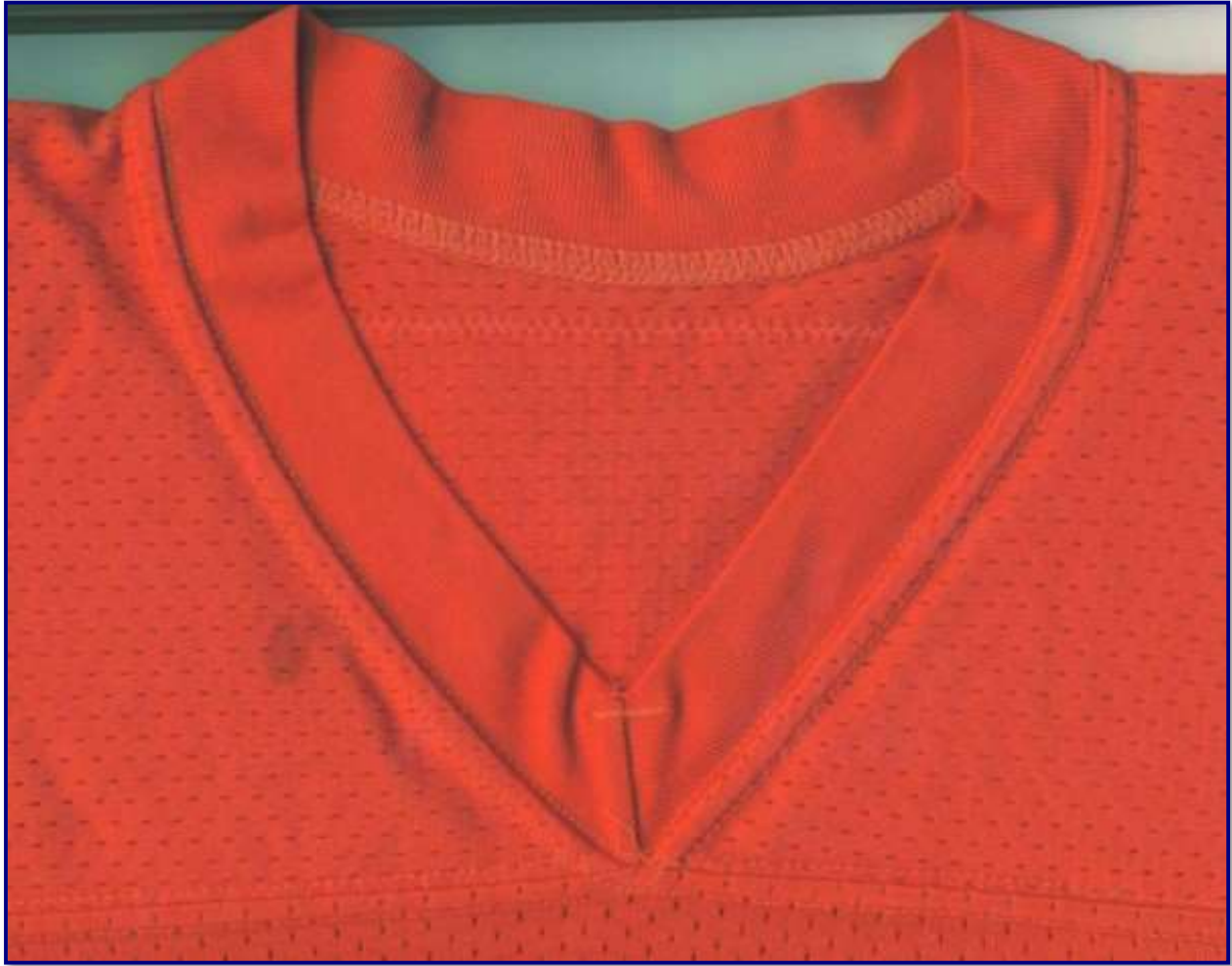
Fig 88-3. Collar detail of 1988 home jersey (T. Dorsett)