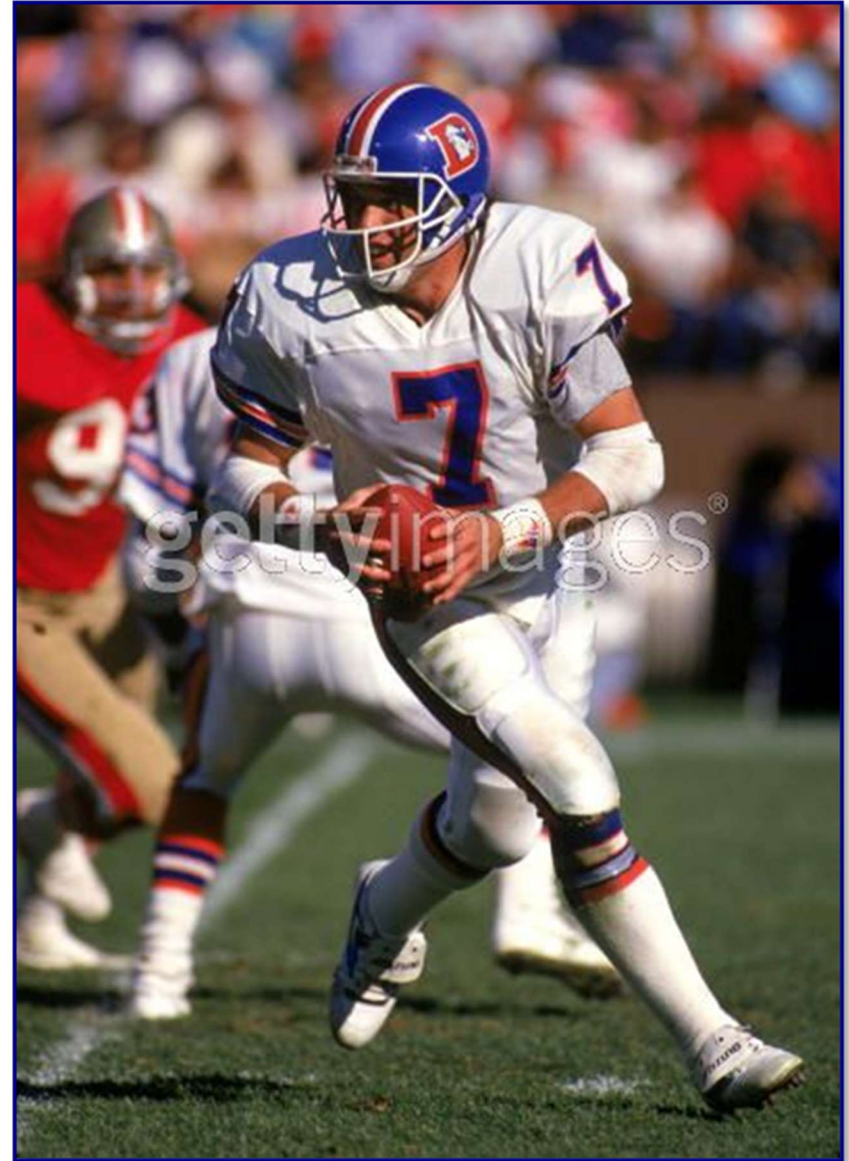
Fig. 88-2. 1988 road uniform (J. Elway)