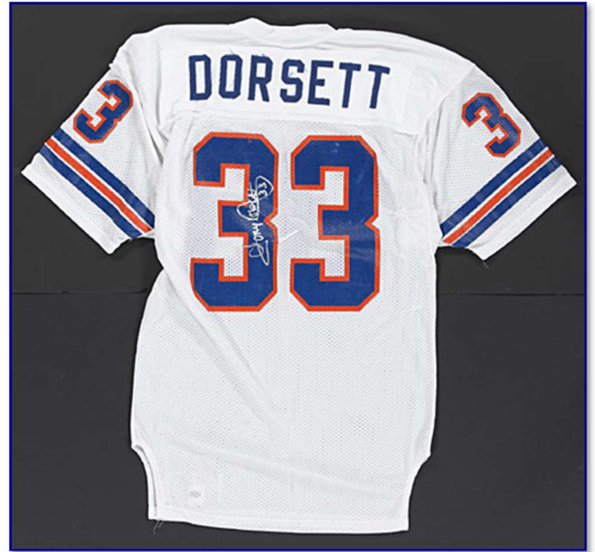
Figs 88-6 & 88-7. Front and rear views of 1988 road jersey (T. Dorsett)