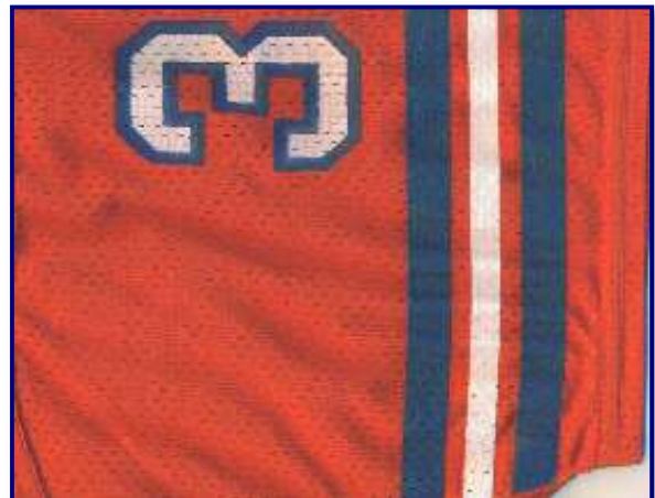
Figs 88-4 & 88-5. Manufacturer's tagging (above left) and sleeve (above right) detail of 1988 home jersey (T. Dorsett)