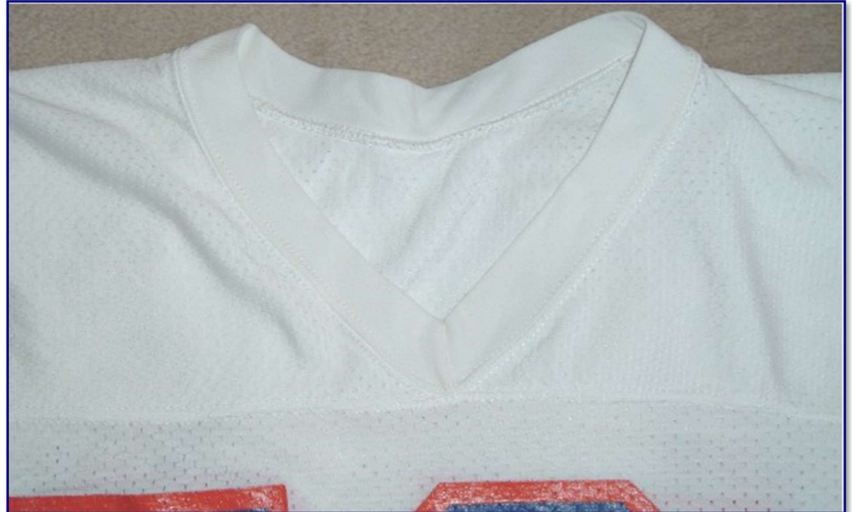
Figs. 87-7 & 87-8. Sleeve (left) and collar (right) detail from 1987 road jersey