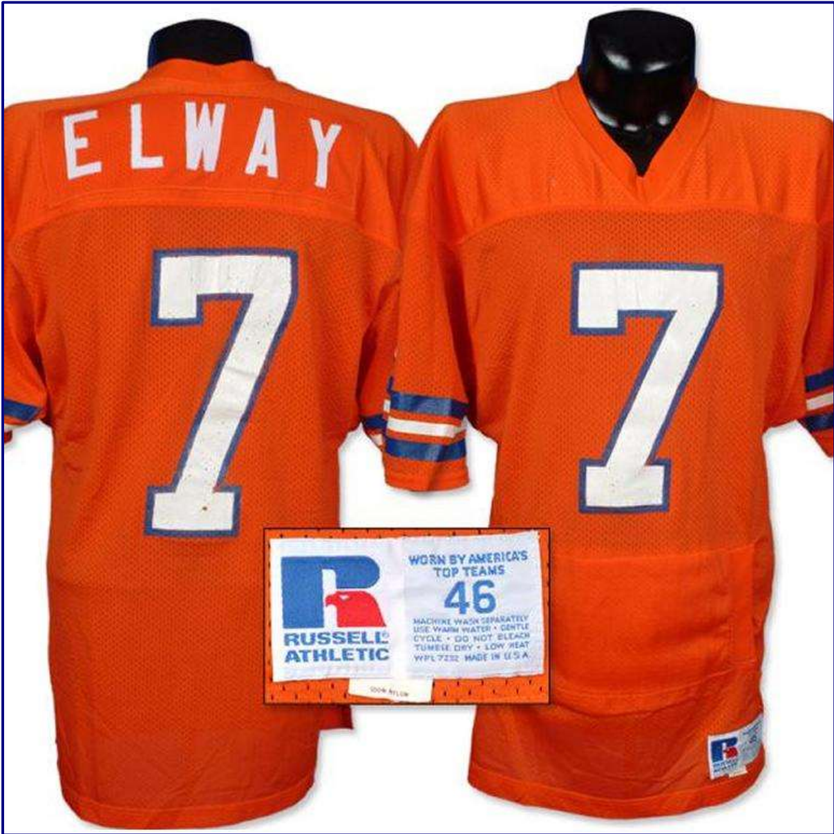
Figs. 87-3. Front, rear and tagging detail 1987 home jersey (J. Elway)