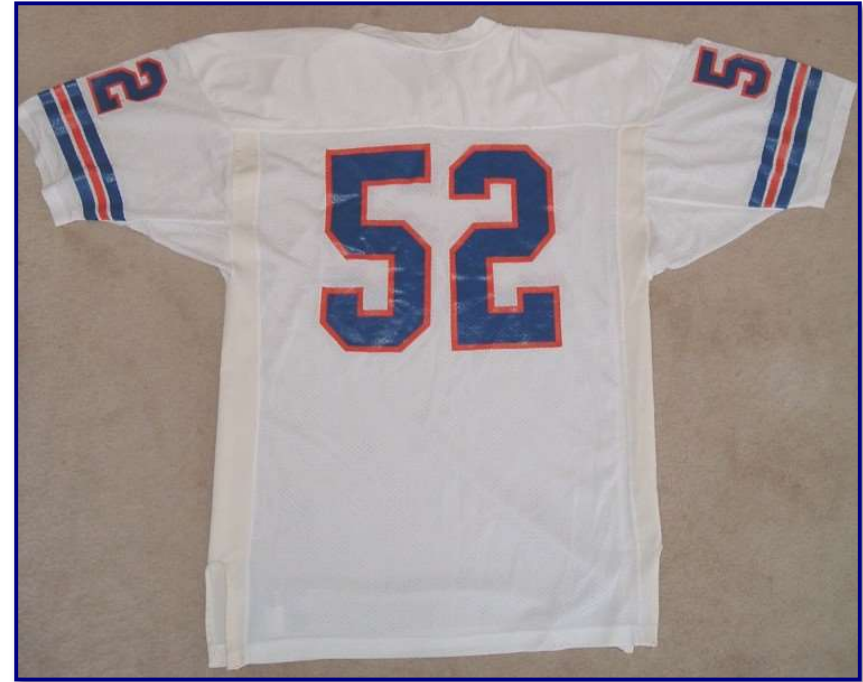
Figs. 87-4 & 87-5. Front and rear of 1987 road jersey (D. MacDonald)