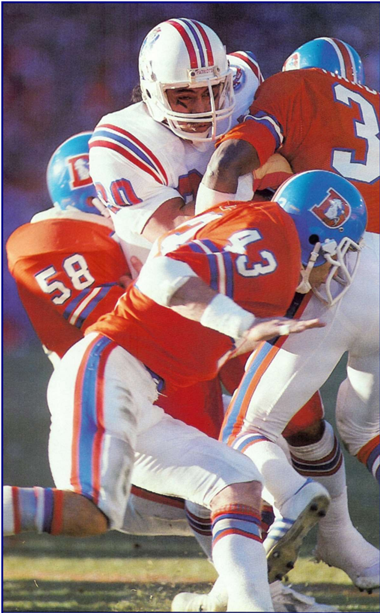
Fig. 87-1. 1987 home uniform (Dec 6)