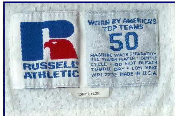
Fig. 87-6. Manufacturer's tagging from 1987 road jersey