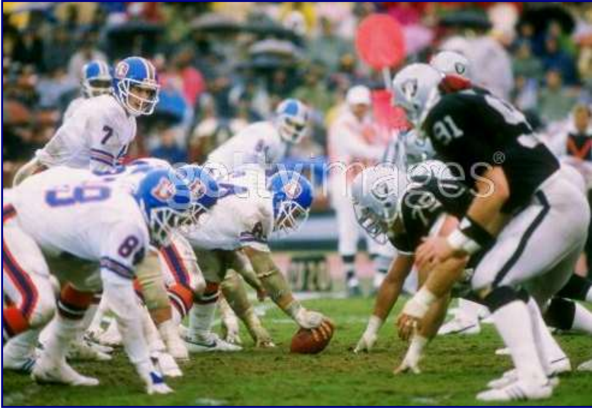
Fig. 85-8. November 24, 1986 at Los Angeles. Note Champion-style sans-serif right sleeve number (7) on Elway's jersey