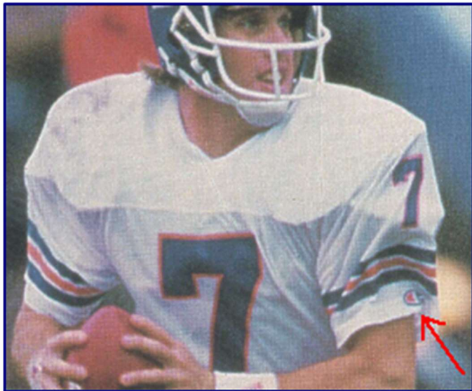
Fig. 85-6. Circa 1985 photo from '86 McDonald's scratch-game card

A subsequent review of NFL Films' Miraclemakers and Heartbreakers: The 1985 Denver Broncos , shows Elway wearing a white road jersey with sans serif-style numbering in road games at Kansas City on October 27 th , Los Angeles on November 24 th (see Fig. 85-8) and Pittsburgh on December 1 st . A brief shot of Elway behind center in the Kansas City game also clearly depicts the Champion logo on the quarterback's left sleeve.