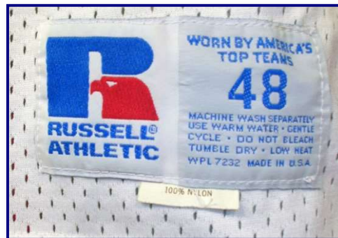
Fig. 85-5. Manufacturer's tag from circa 1985 road jersey