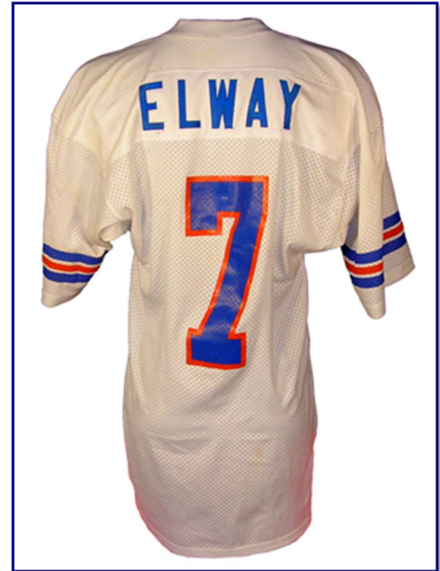
Figs. 85-3 & 85-4. Front and rear of circa 1985 road jersey (J. Elway)