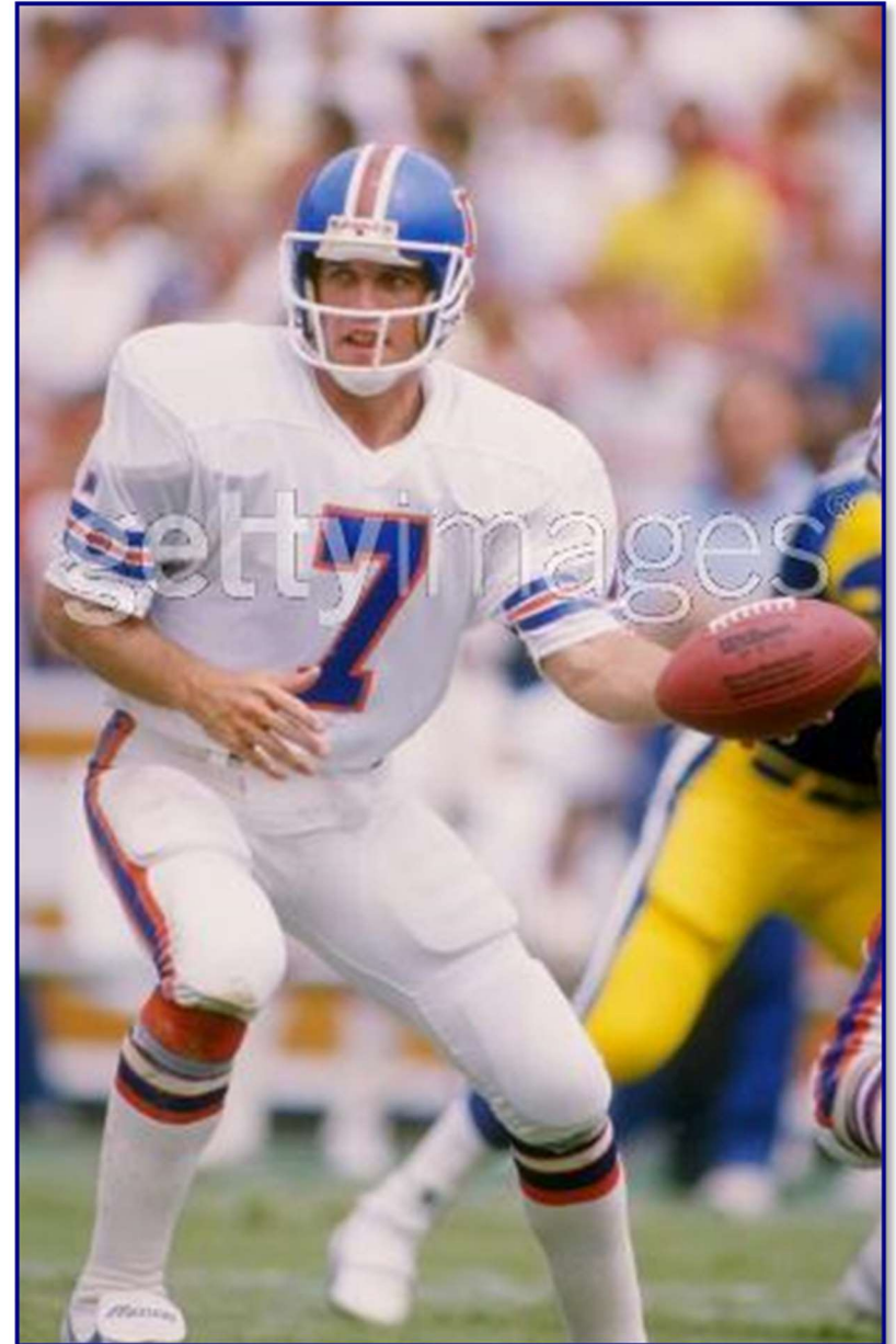
Fig. 85-2. 1985 road uniform (J. Elway)