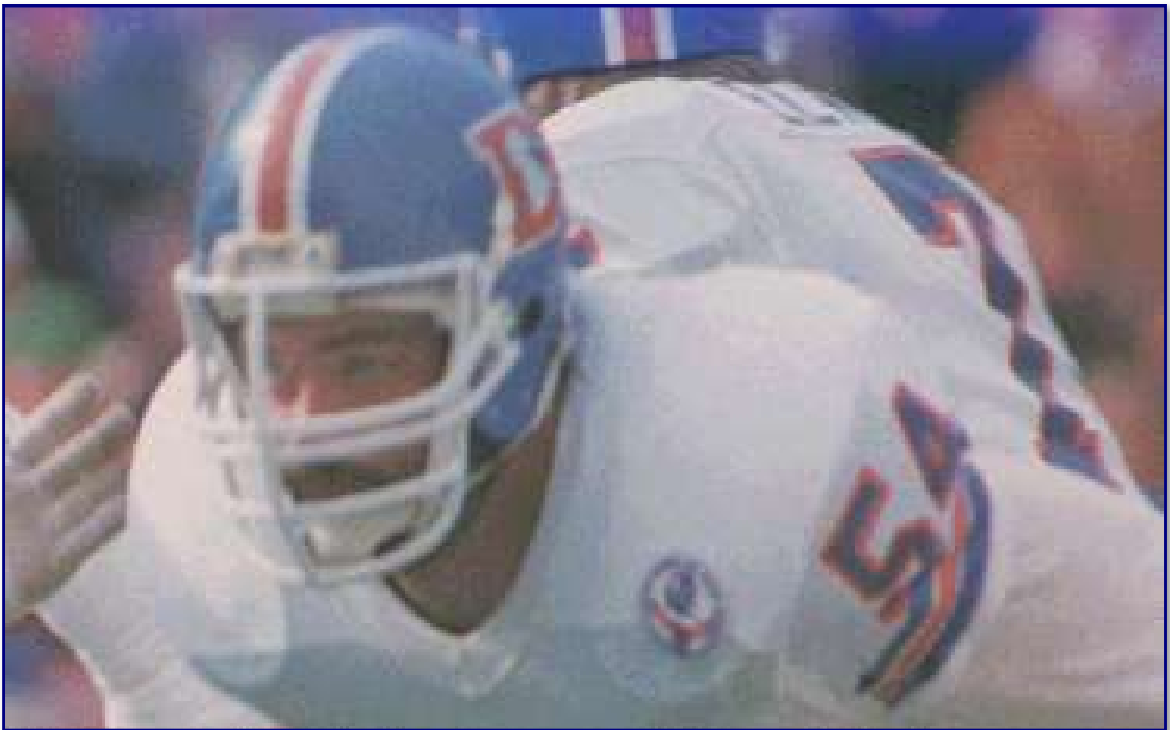
Fig. 84-8. Collar detail of 1984 road jersey with neckband extending into the body, below the horizontal cowl seam. Style first observed in use in 1984 and continuing through '86 (K. Bishop).