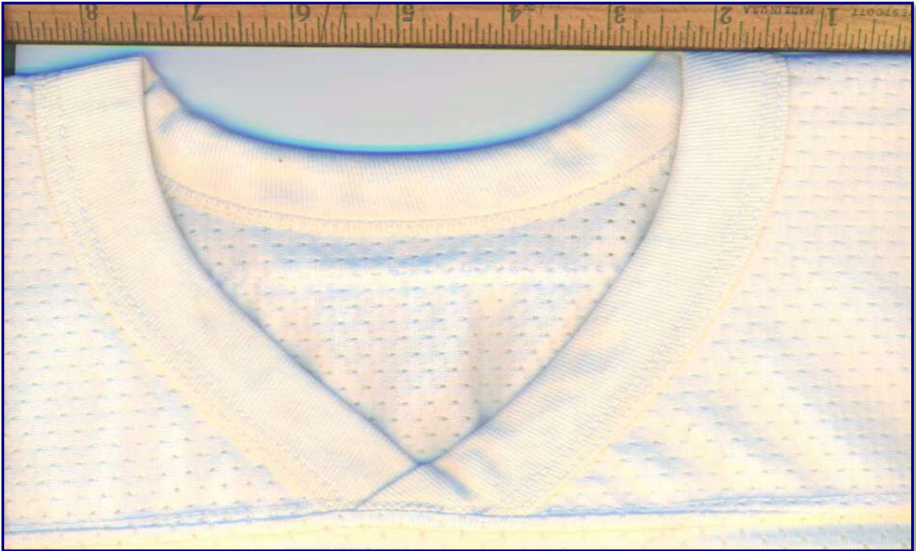
Fig. 84-7. Collar detail of 1984 road jersey with collar which abuts at cowl seam (S. Watson)