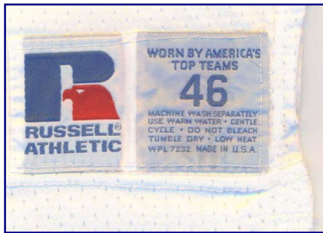
Fig. 84-11. Manufacturer's tag detail of 1984 road jersey