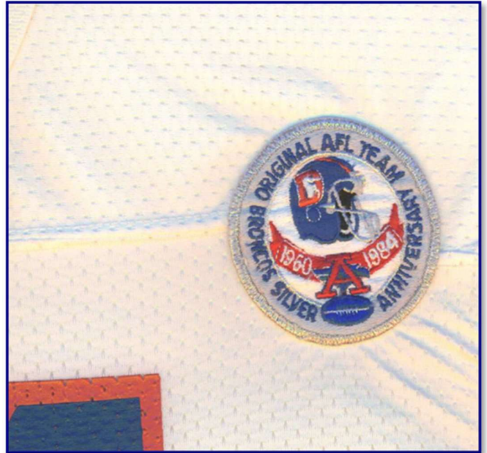
Fig. 84-10. Detail of AFL 25 th Anniversary patch on left chest (actual size 3" diameter)