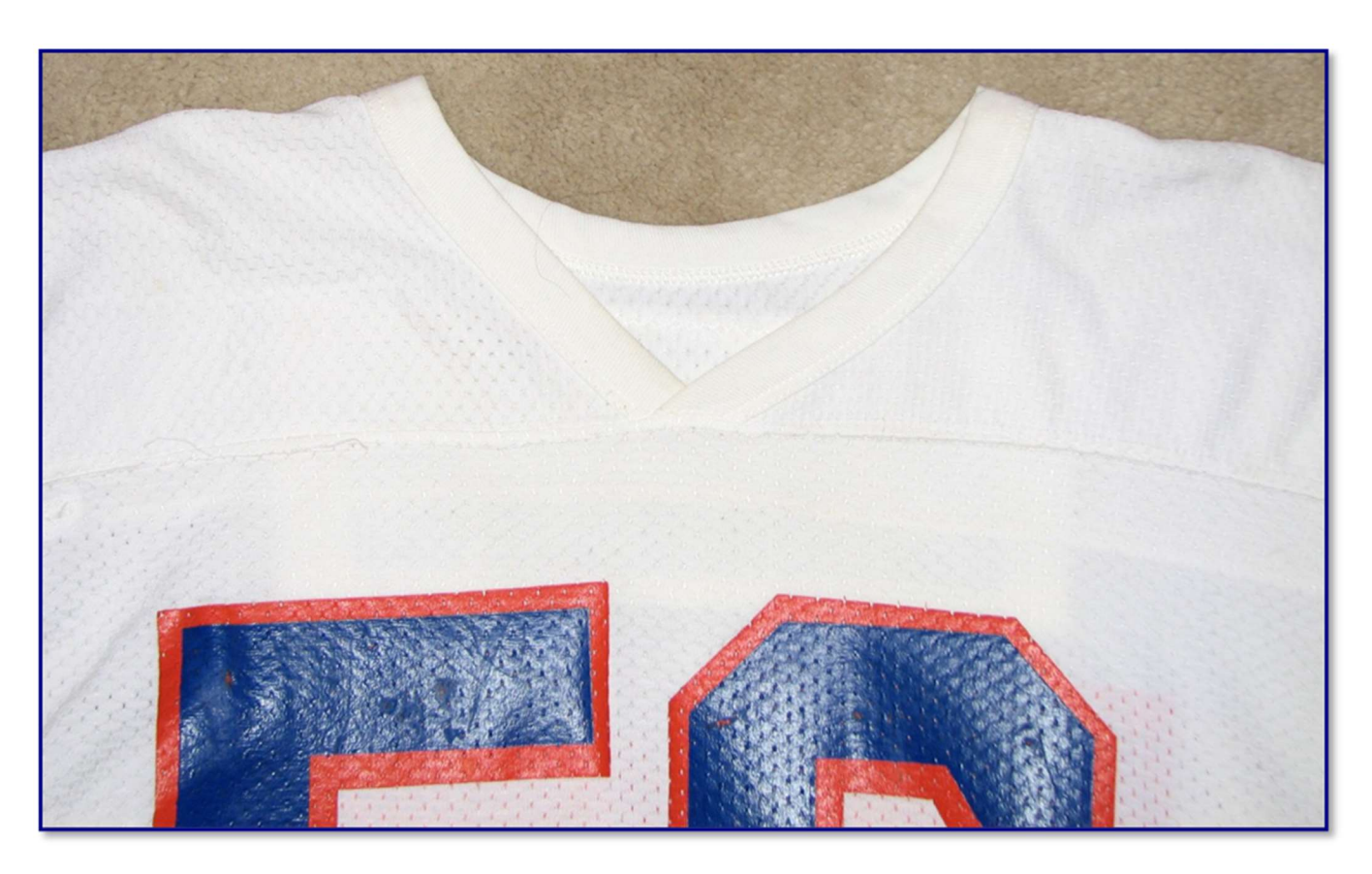
Figs. 82-10 & 82-11. Collar (above) and nameplate (below) detail of circa 1982 Broncos' road jersey