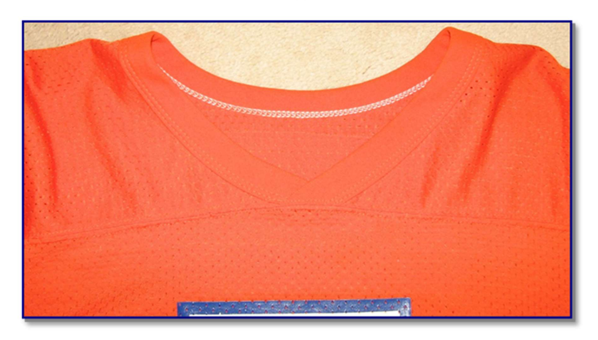
Figs. 82-6 & 82-7. Collar (above) and sleeve (below) detail from circa 1982 home jersey