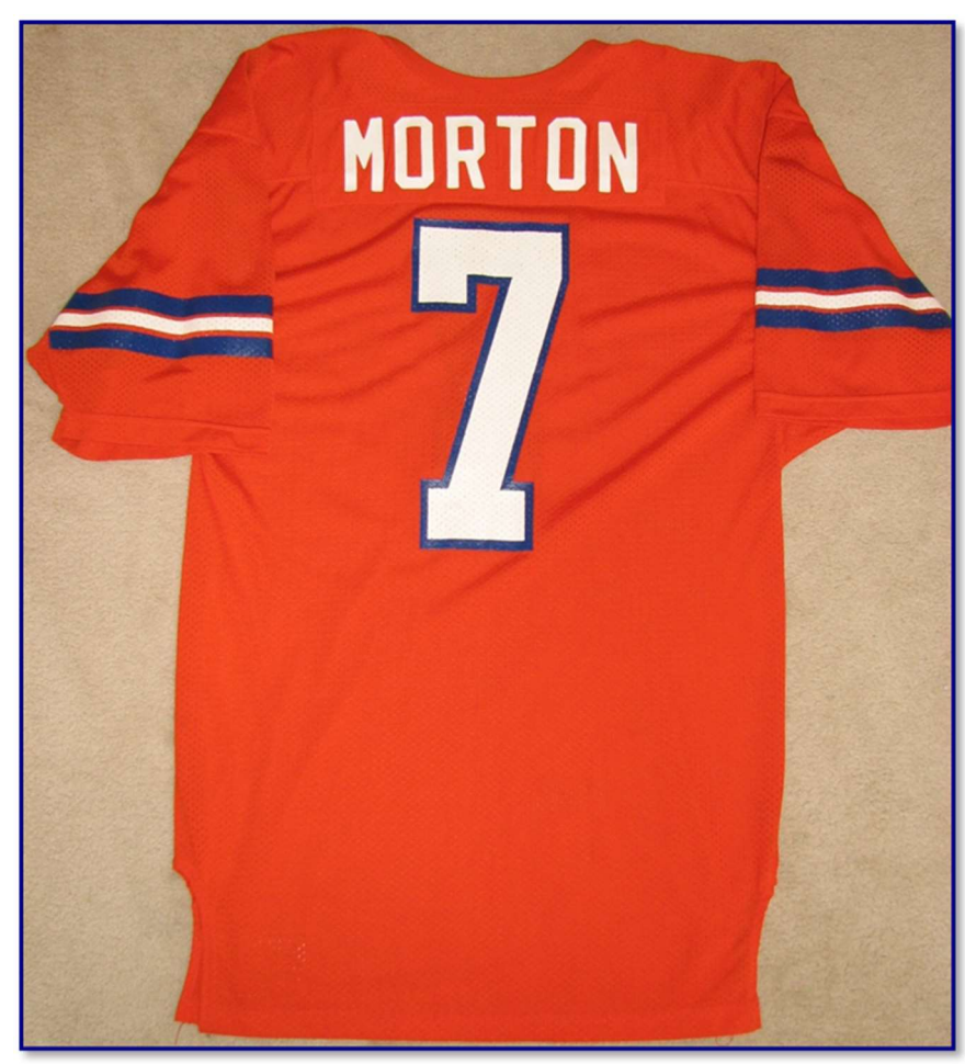
Figs. 82-3 & 82-4. Front (left) and rear (right) views of circa 1982 Broncos home jersey (C. Morton)