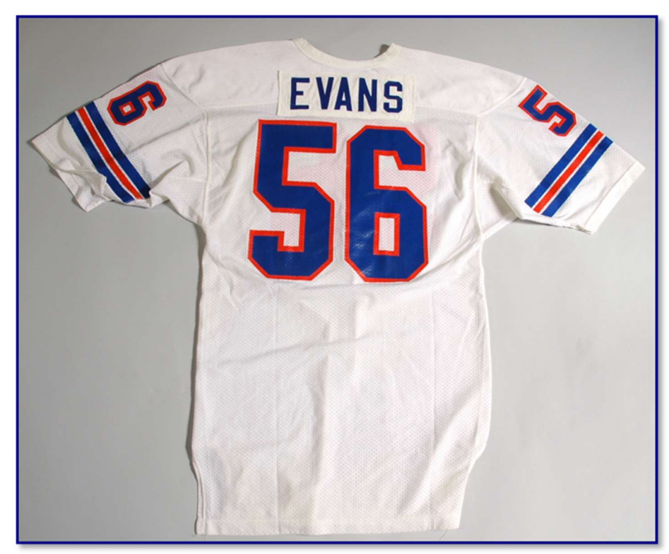
Figs. 82-6 & 82-7. Front (above) and rear (below) views of circa 1982 Broncos road jersey (L. Evans)