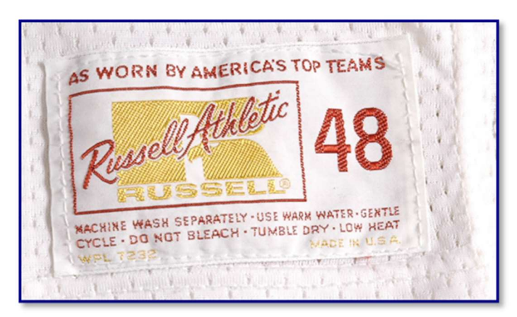
Figs. 82-8 & 82-9. Manufacture's tagging (above) and sleeve (right) detail from ca. 1982 Broncos' road jersey