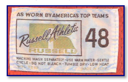
Fig. 82-5. Manufacturer's tagging detail from circa 1982 home jersey