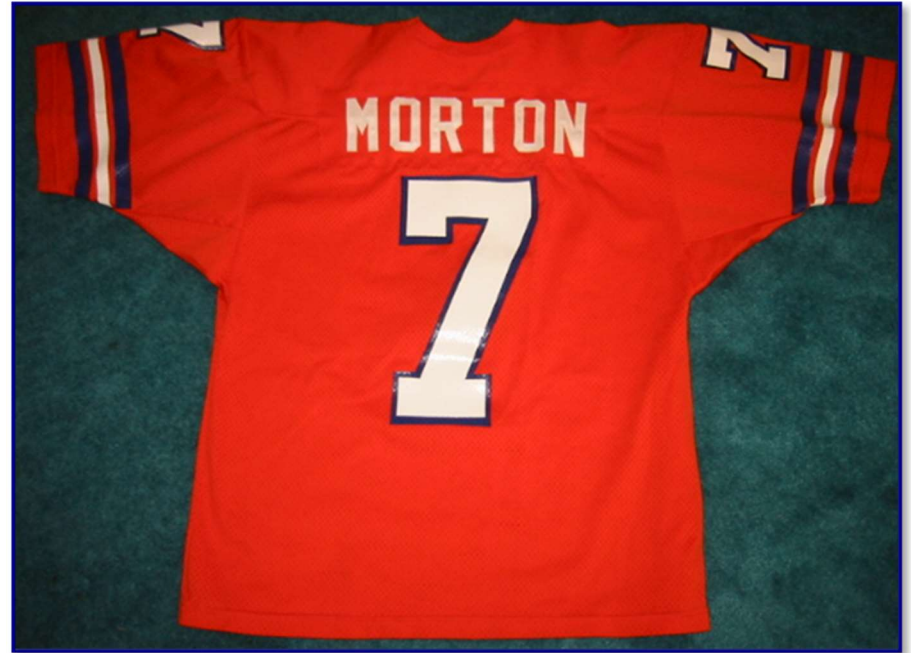
Figs. 81-3 & 81-4. Front and rear views of circa 1981 Broncos' home jersey (C. Morton)