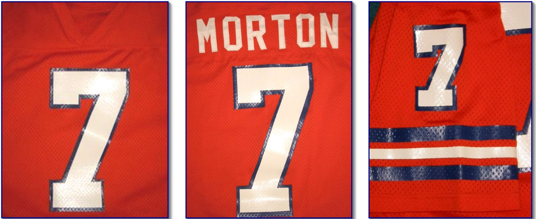
Figs. 81-6, 81-7 & 81-8. Front/collar (left), rear/nameplate (center), and sleeve (right) detail from circa 1981 Broncos' home jersey (C. Morton)