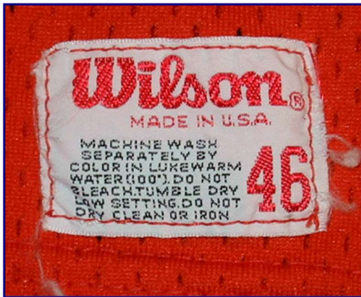
Figs. 81-5. Manufacturer's tagging detail from circa 1981 Broncos' home jersey