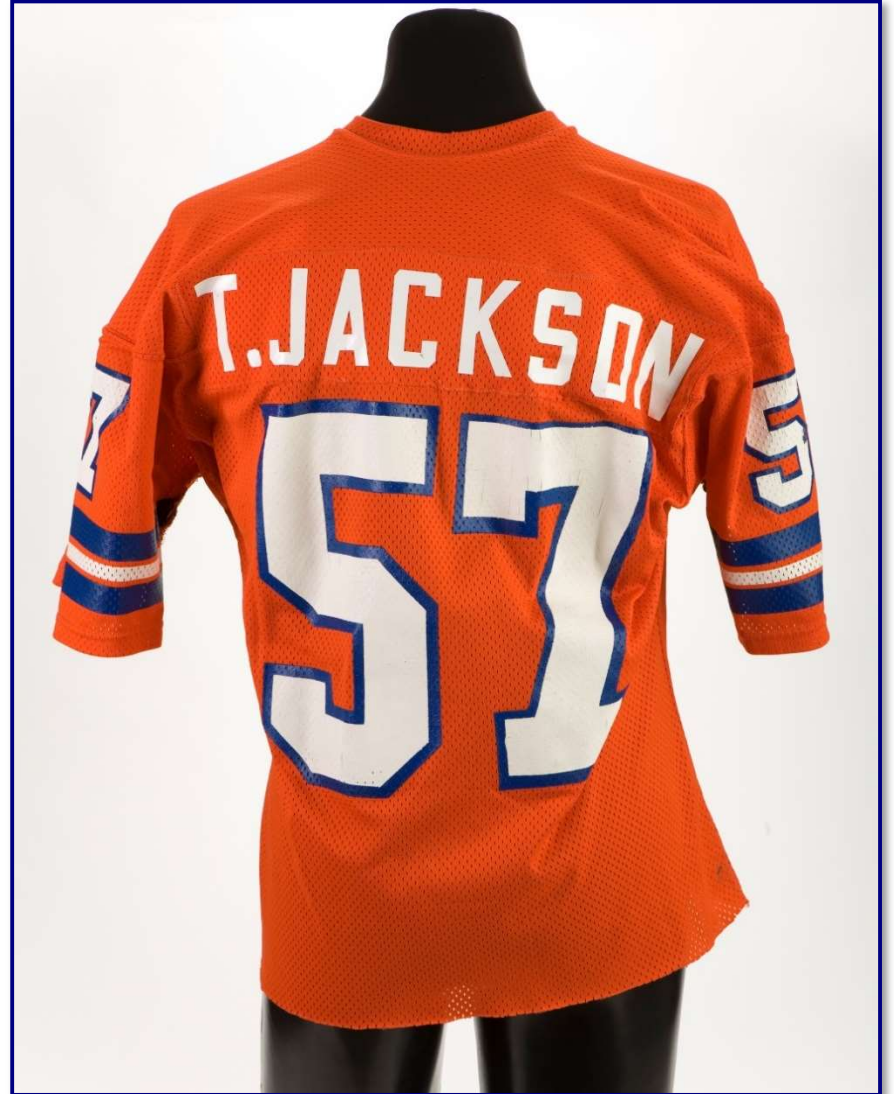
Figs. 80-3 & 80-4. Front and rear views of circa 1980 home jersey