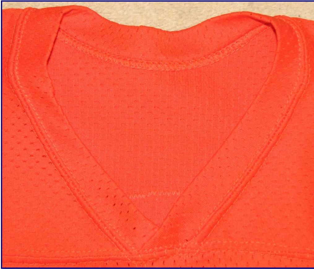
Figs. 80-5 & 80-6. Collar (above) and sleeve (below) detail from circa 1980 home jersey