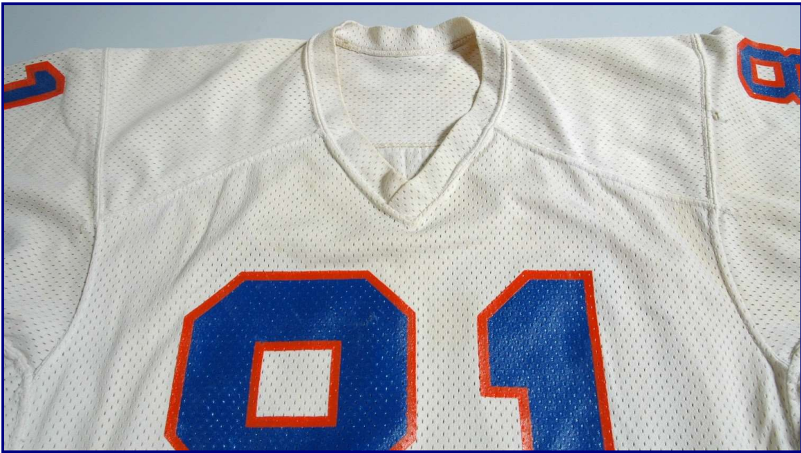
Fig. 79-11. Collar detail (below) of 1979 road jersey