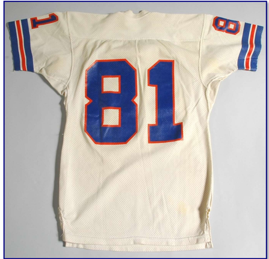
Figs. 79-8 & 79-9. Front and rear views of circa 1979 road jersey (S. Watson). Note: nameplate removed.