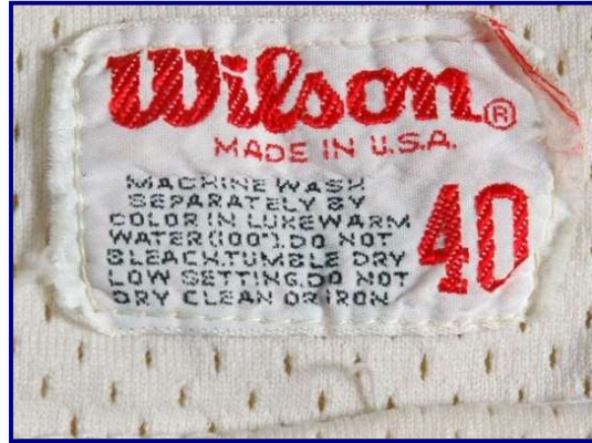
Figs. 79-10 & 79-11. Manufacturer's tail tagging (above). Note that this tagging style (with ® symbol at lower right of Wilson script logo) generally dates to circa 1978-'85, and is the detail differentiating 1979 from '78 Broncos' jerseys.