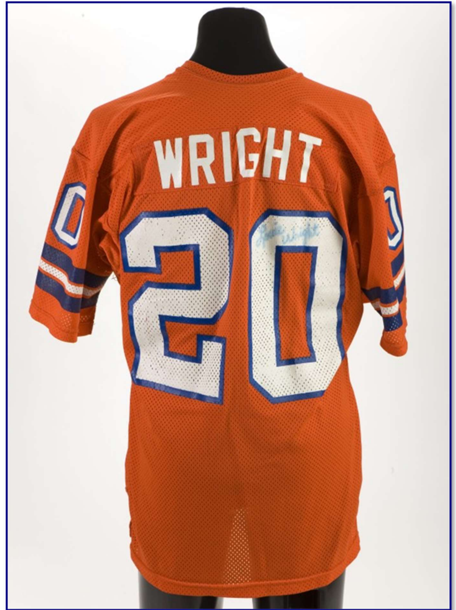
Figs. 78-3 & 78-4. Front and rear views of circa 1978 home jersey (L. Wright)