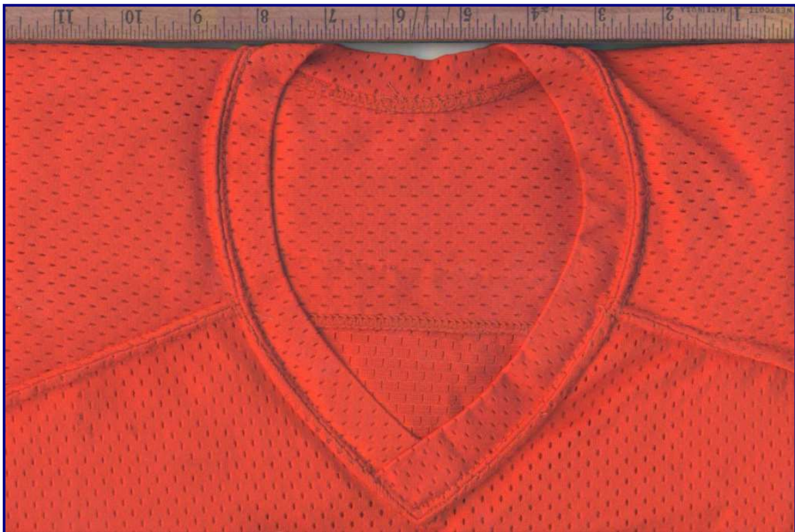
Fig. 78-7. Collar detail from circa 1978 home jersey