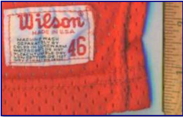
Fig. 78-5. Manufacturer's tail tagging detail from 1978 home jersey. Note that this particular tagging style—with ® symbol at upper right of Wilson script logo, generally dates to circa 1974-'77, and is the detail differentiating 1978 from '79 Broncos' jerseys.