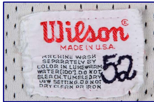
Fig. 78-10. Tagging detail of circa 1978 road jersey