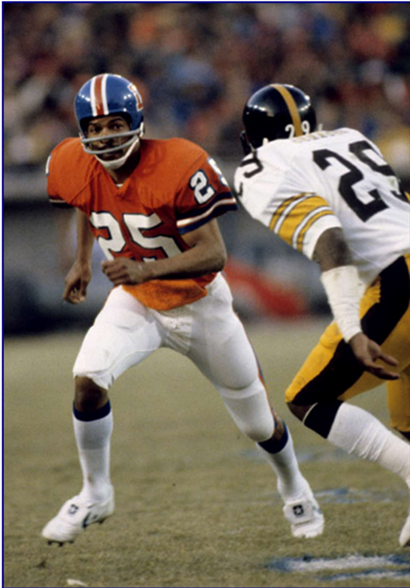
Fig. 78-1. 1978 home uniform