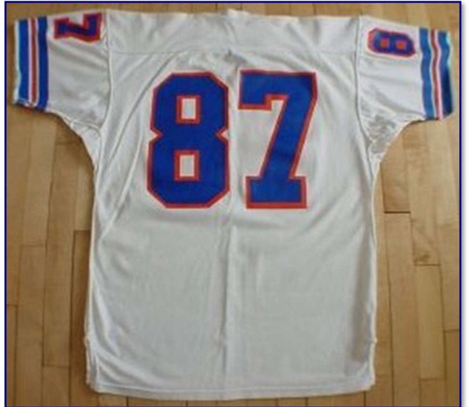
Figs. 78-8 & 78-9. Front and rear views of circa 1978 road jersey (B. Moore)