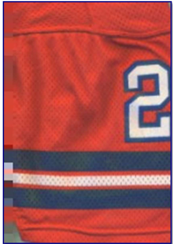
Fig. 78-6. Sleeve detail from 1978 home jersey