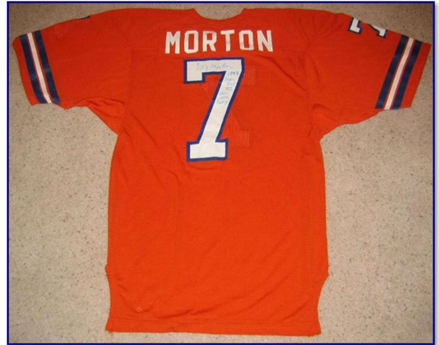
Figs. 77-3 & 77-4. Front (R. Gradishar) and rear (C. Morton) views of circa 1977 home jerseys