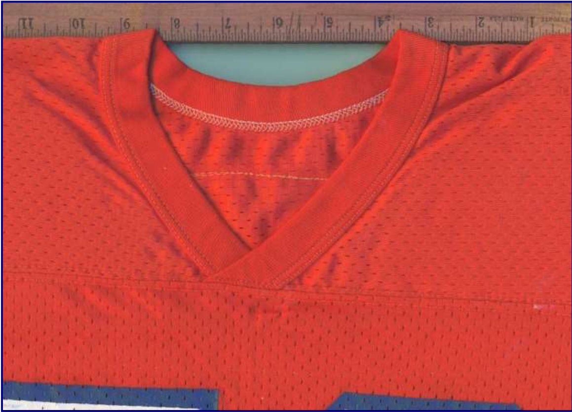
Fig. 77-6. Collar detail from 1977 home jersey (B. Maples)