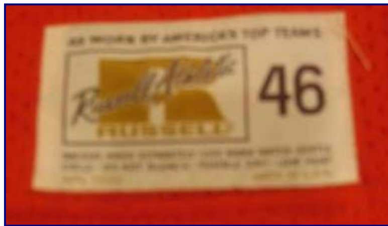
Fig. 77-5. Tagging detail from 1977 home jersey (C. Morton)