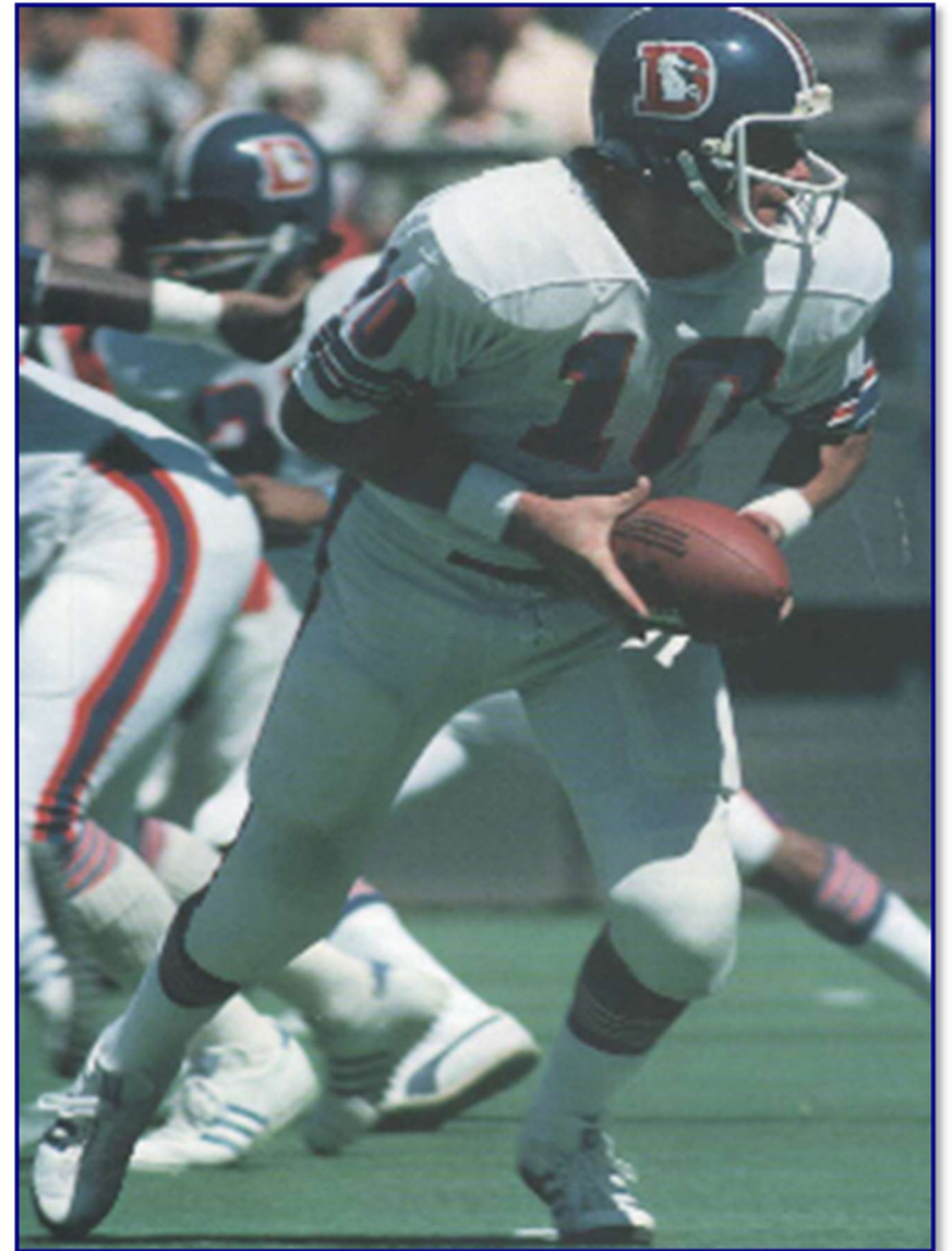
Fig 76-2. Road uniform detail (S. Ramsey)