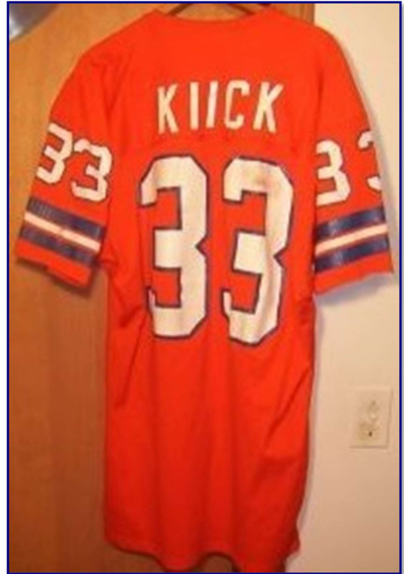
Fig. 76-3 & 76-4. Front and rear views of circa 1976 home jersey (J. Kiick)