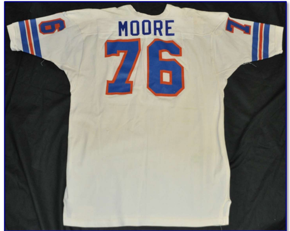
Fig. 76-7 & 76-8. Front and rear views of 1976 road jersey (R. Moore)