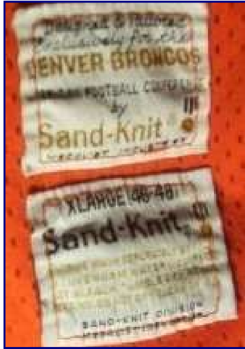
Fig 76-5. Tagging detail from circa 1976 home jersey