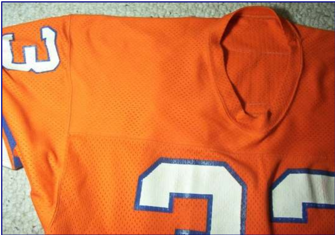
Fig. 76-6. Collar and yoke detail from circa 1976 home jersey