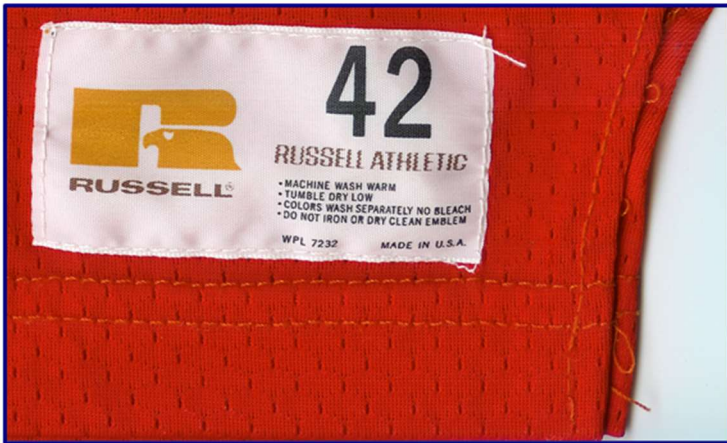
Fig. 75-6. Manufacturer's tail tag detail from 1975 home jersey