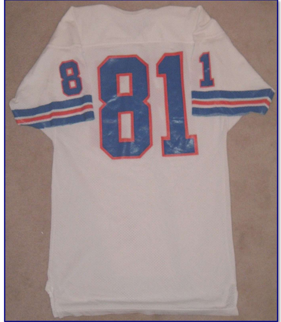
Figs. 75-8 & 75-9. Front and rear views of circa 1975 Broncos' road jersey (B. Adams). Note: Nameplate on back removed