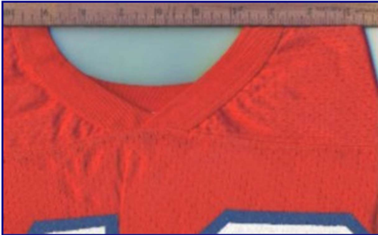
Fig. 75-4. Collar detail of 1975 home jersey