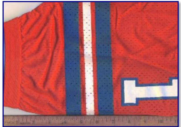
Fig. 75-7. Sleeve detail of 1975 home jersey