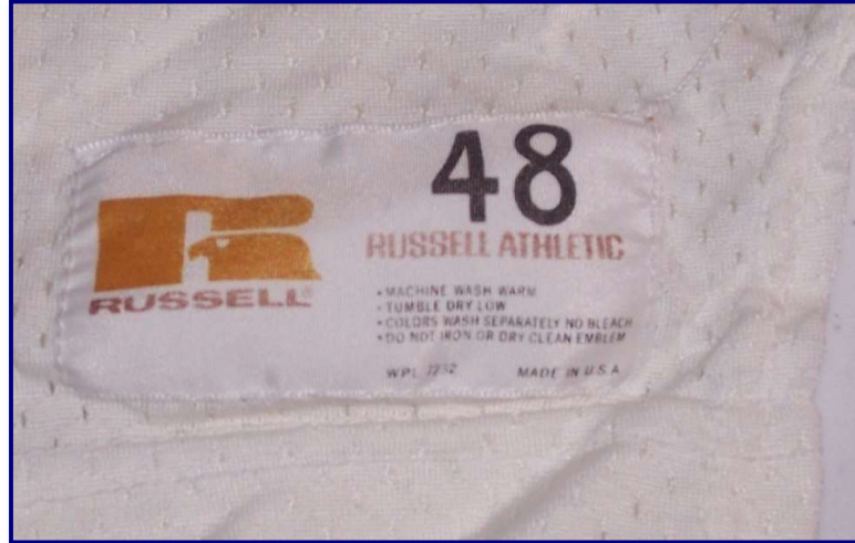
Fig. 75-10. Manufacturer's tail tag detail from circa 1975 Broncos' road jersey