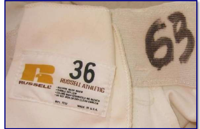
Figs. 75-11 & 75-12. Circa 1975 Broncos' uniform pants and manufacturer's tagging detail (J. Grant)