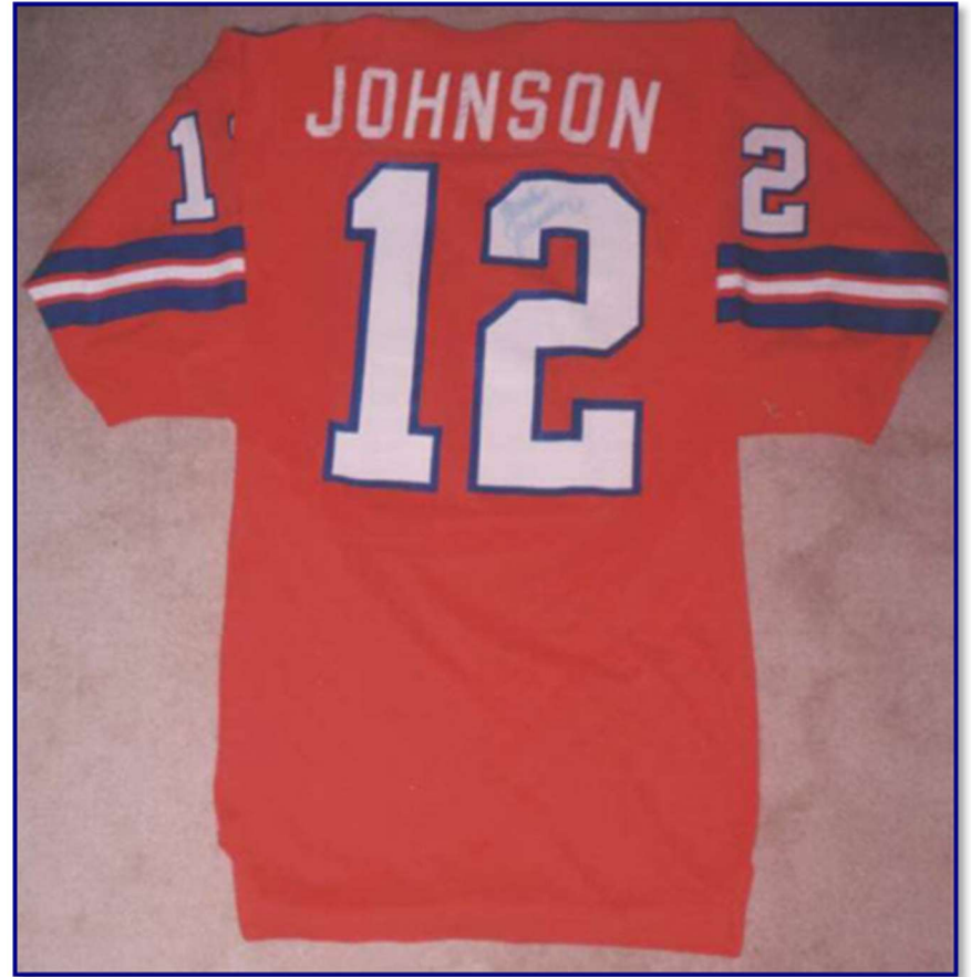
Figs. 75-2 & 75-3. Front and rear views of 1975 home jersey (C. Johnson)