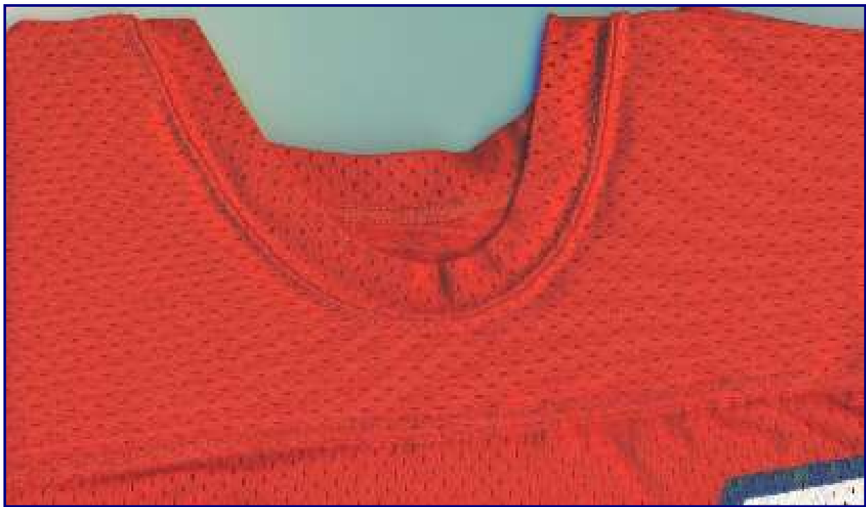
Fig. 74-5. Collar detail from circa 1974 Sand-Knit home jersey with crew neck and cowl seam passing below collar; just above numbers