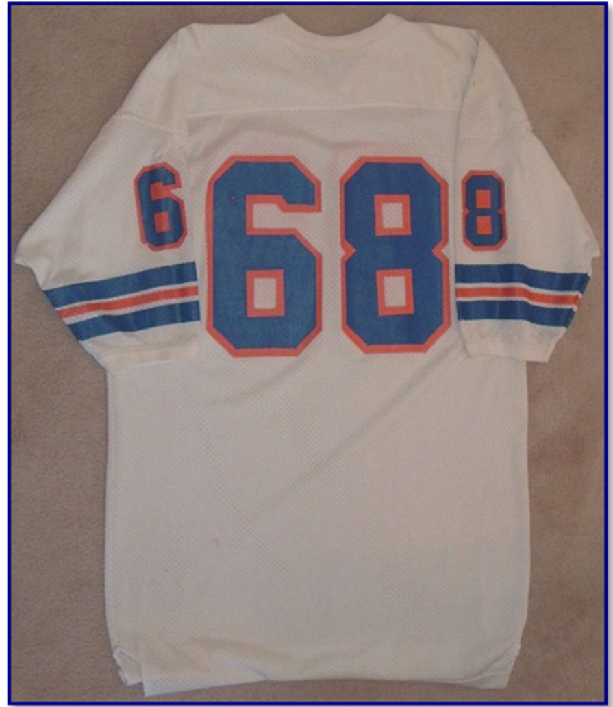
Figs. 74-6 & 74-7. Front and rear views of circa 1974 road jersey (L. Jackson)