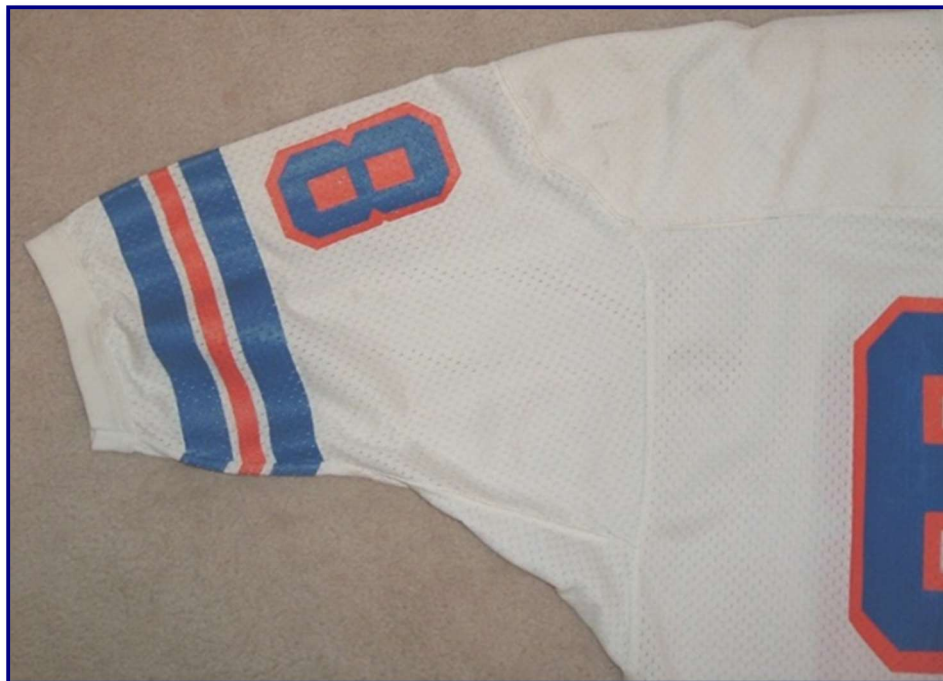
Fig. 74-10. Sleeve detail from circa 1974 road jersey (L. Jackson)