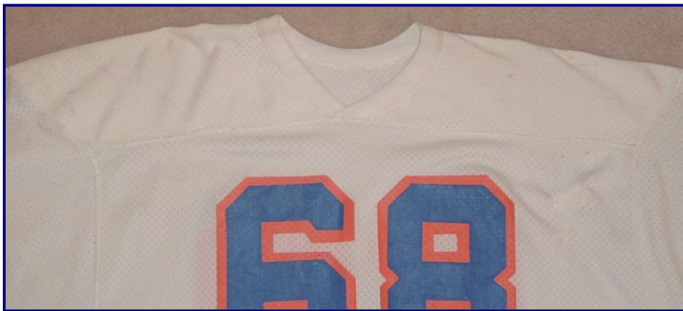
Fig. 74-9. Collar detail from ca. 1974 Russell Athletic road jersey with abutted, overlapping V-neck collar