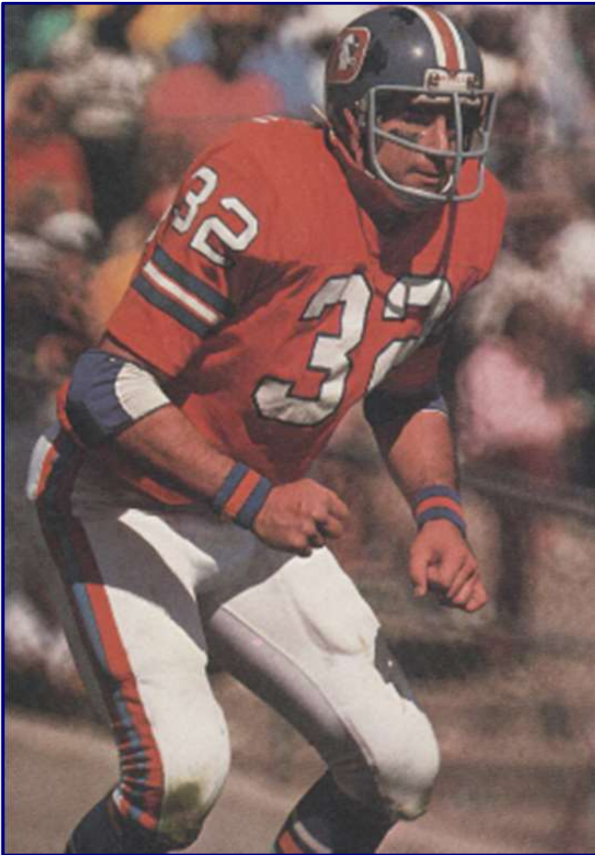
Fig. 74-1. 1974 home uniform