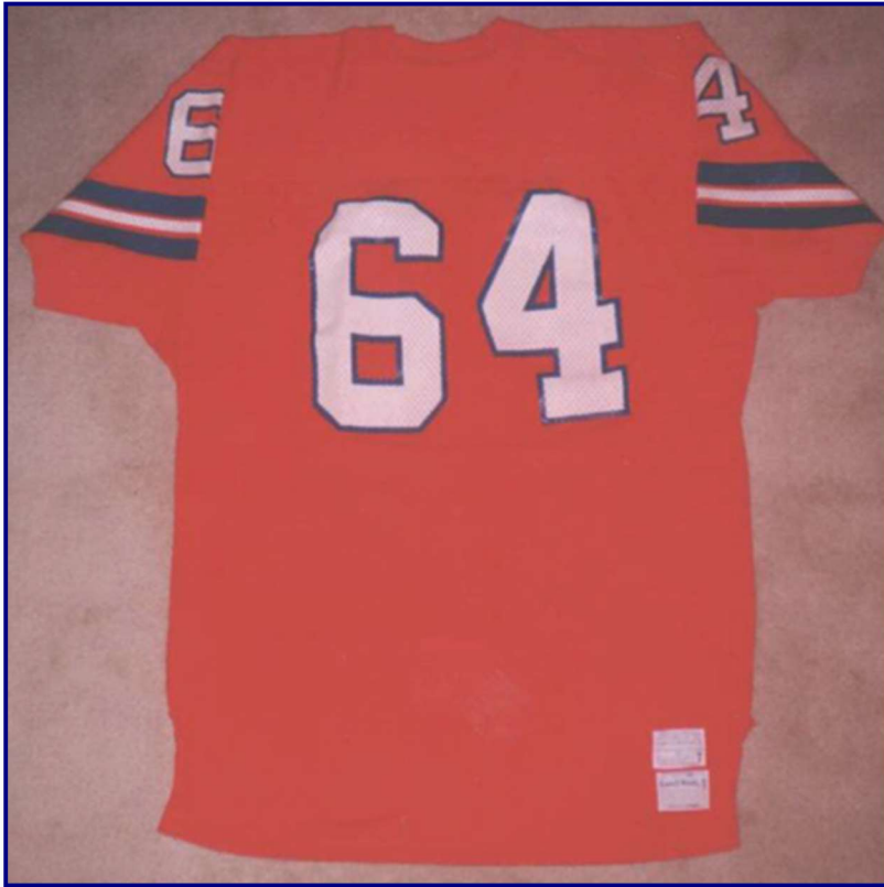
Fig. 74-3. Front of circa 1974 home jersey with ¼-length sleeves (M. Schnitker)