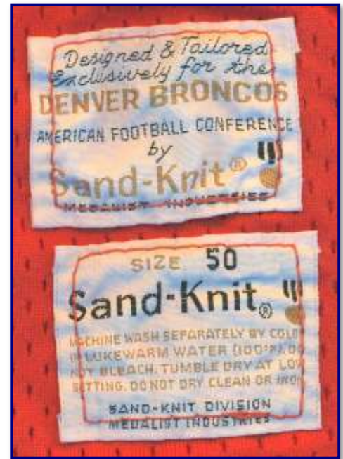
Fig. 74-4. Mnfg. tagging from circa 1974 Sand-Knit home jersey with "pro-style" sizing