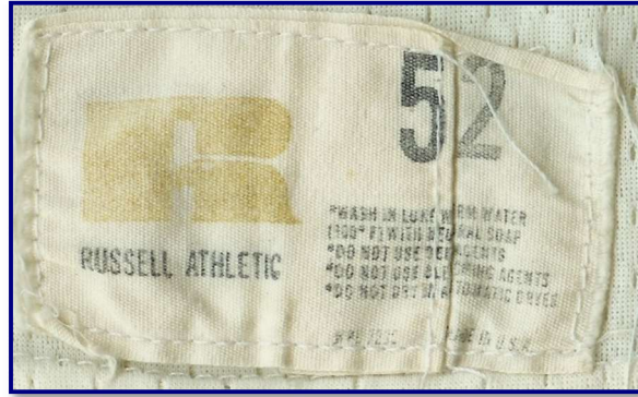
Fig. 74-8. Manufacturer's tail tagging from circa 1974 road jersey