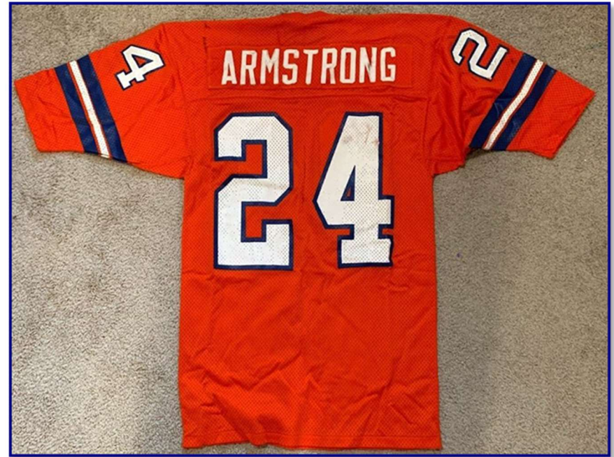
Figs. 73-3 & 73-4. Front and rear views of circa 1973 home jersey with 1/2-length sleeves (O. Armstrong c/o Kyle Meyer)