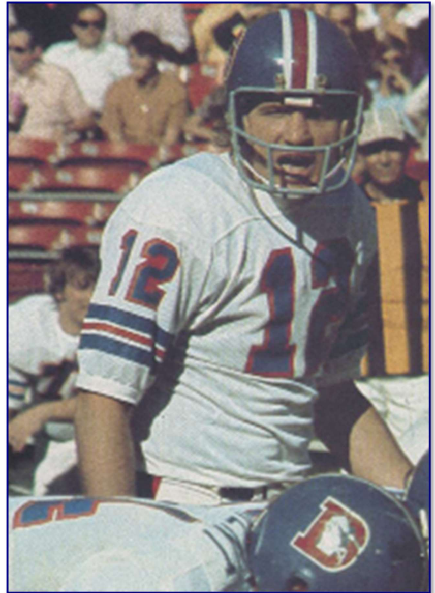
Fig 73-2. 1973 Russell Athletic style road jersey with cowl seam intersecting collar; passing above numbers