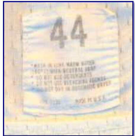
Figs. 73-8 & 73-9. Collar and wash tagging detail from circa 1973 Russell Southern road jersey