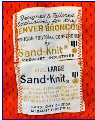
Fig. 73-5. Mnfg. tagging from circa 1973 Sand-Knit home jersey with "collegiate" sizing