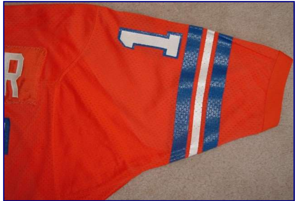
Figs. 72-6 & 72-7. Collar and sleeve detail from c. '72 home jersey