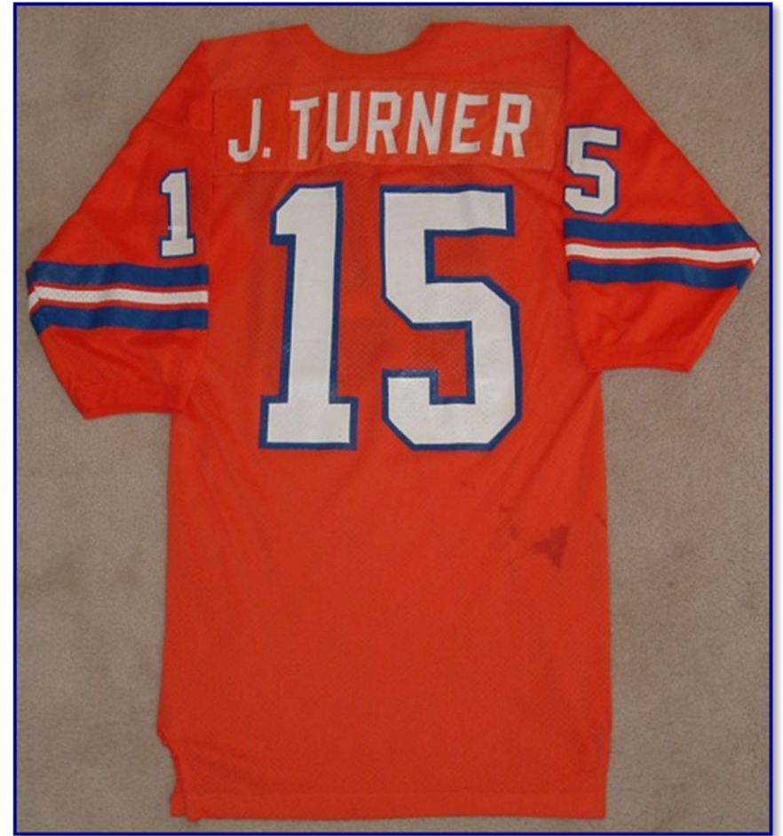
Figs. 72-3 & 72-4. Front and rear views of circa 1972 home jersey (J. Turner)