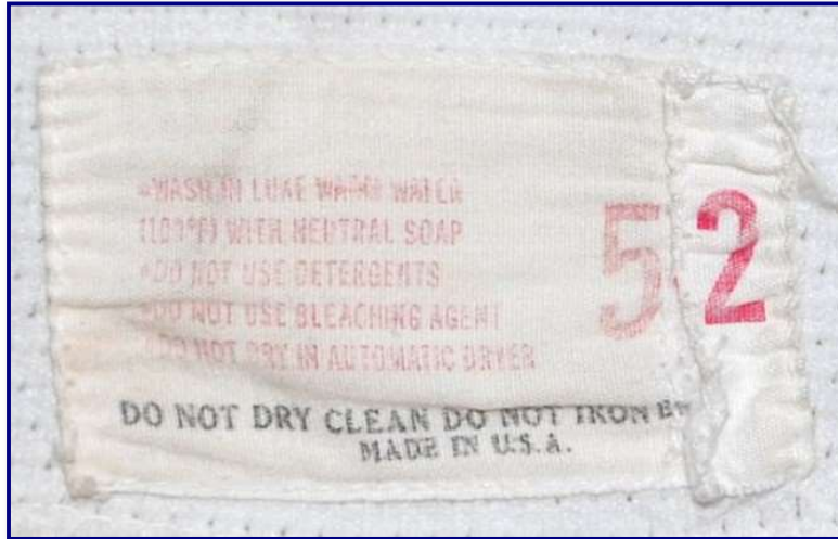
Fig. 72-10. Russell Southern wash tag detail from circa 1972 road jersey (L. Alzado)