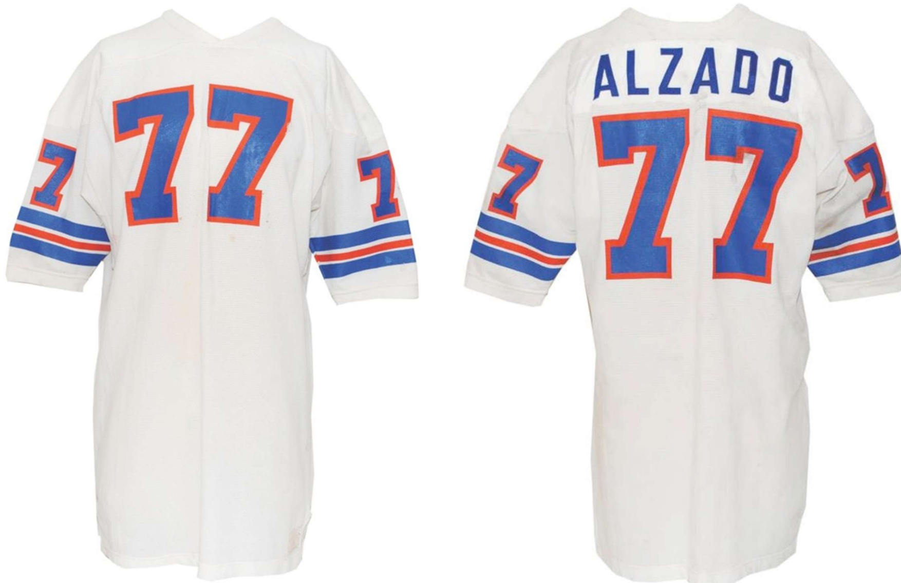
Figs. 72-8 & 72-9. Front and rear views of circa 1972 road jersey (L. Alzado)