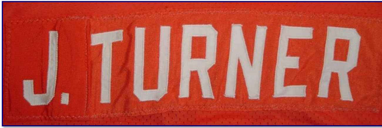
Fig. 72-5. Nameplate detail (Note “recycled” tackle-twill lettering on Durene nameplate sewn on nylon mesh jersey)