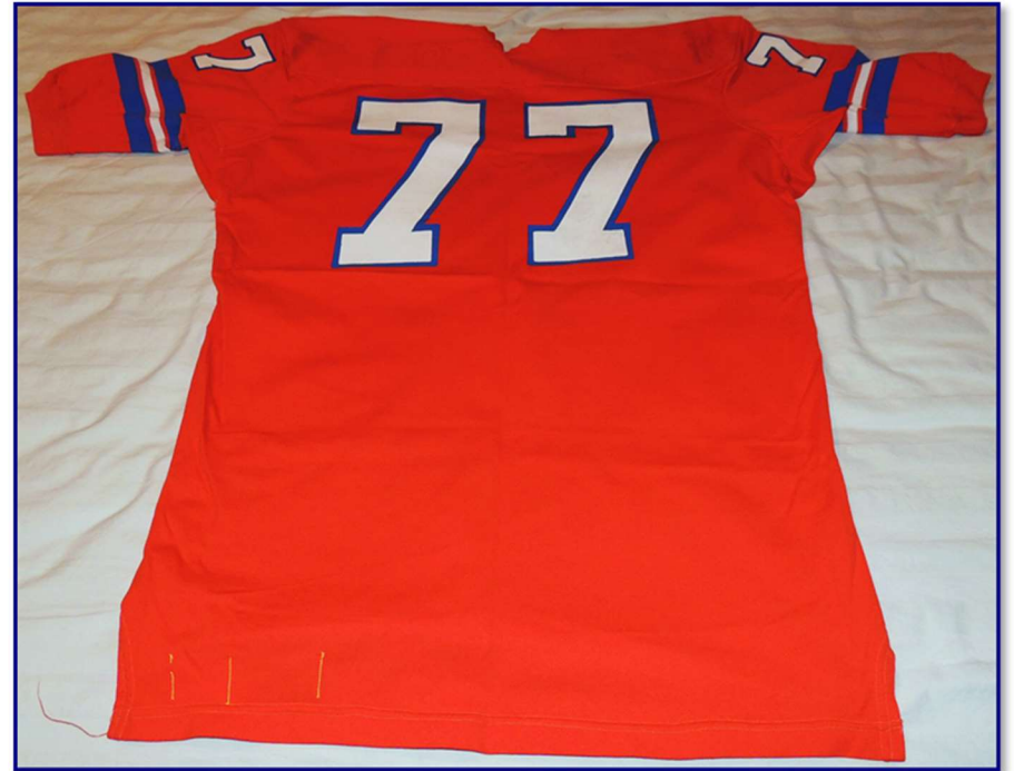
Figs. 70-3 & 70-4. Front and rear views of 1970 home jersey (A. Roche)