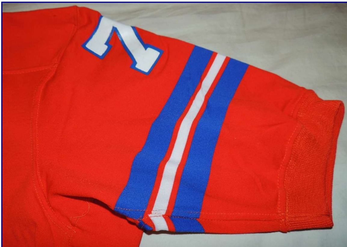
Fig. 70-6. Sleeve detail of 1970 home jersey