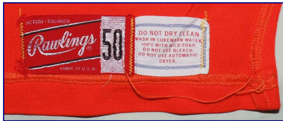
Fig. 70-5. Rawlings' manufacturer's tail tagging detail from a 1970 home jersey