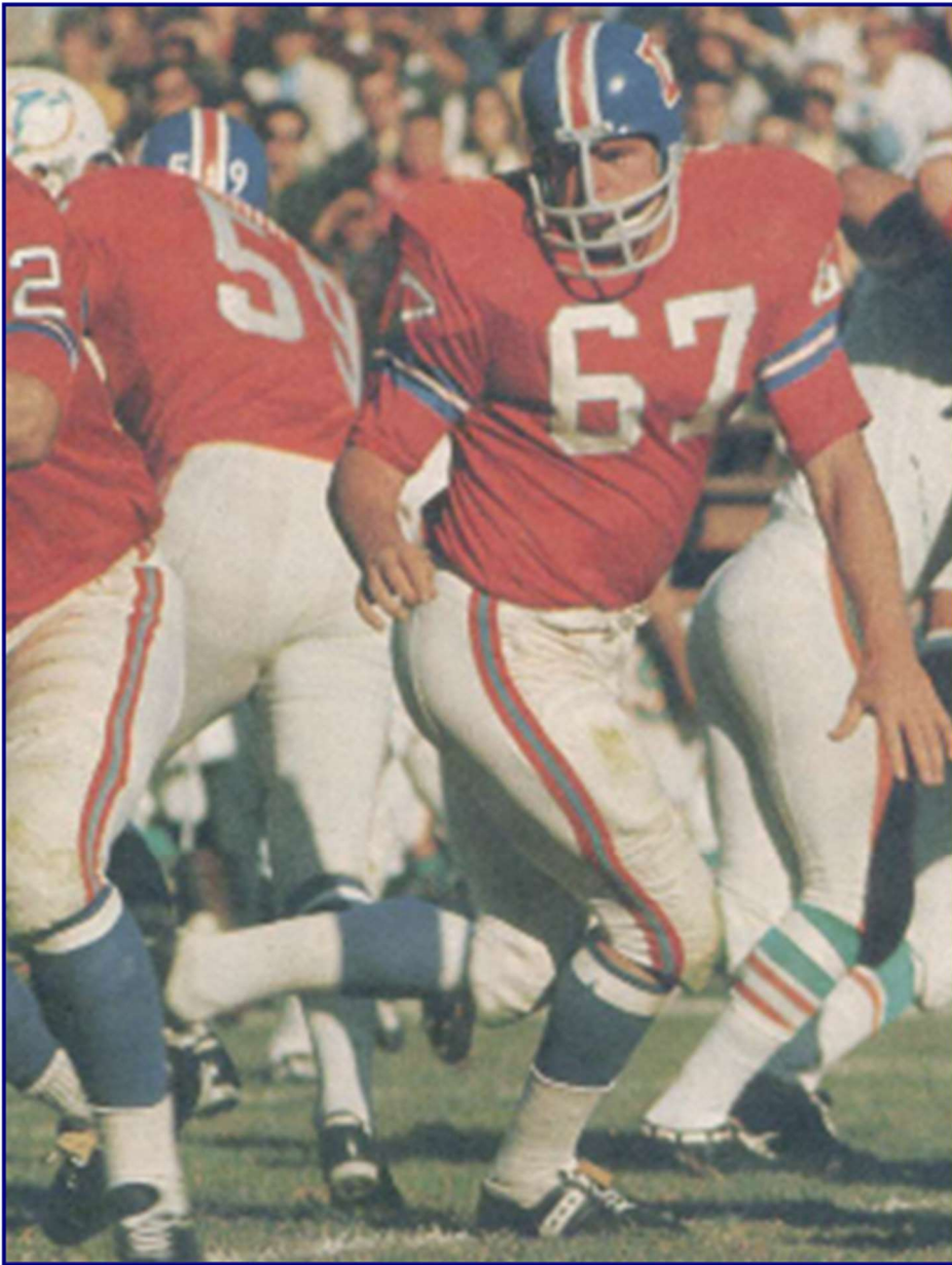
Fig. 68-1. 1968 home uniform (Oct 27)