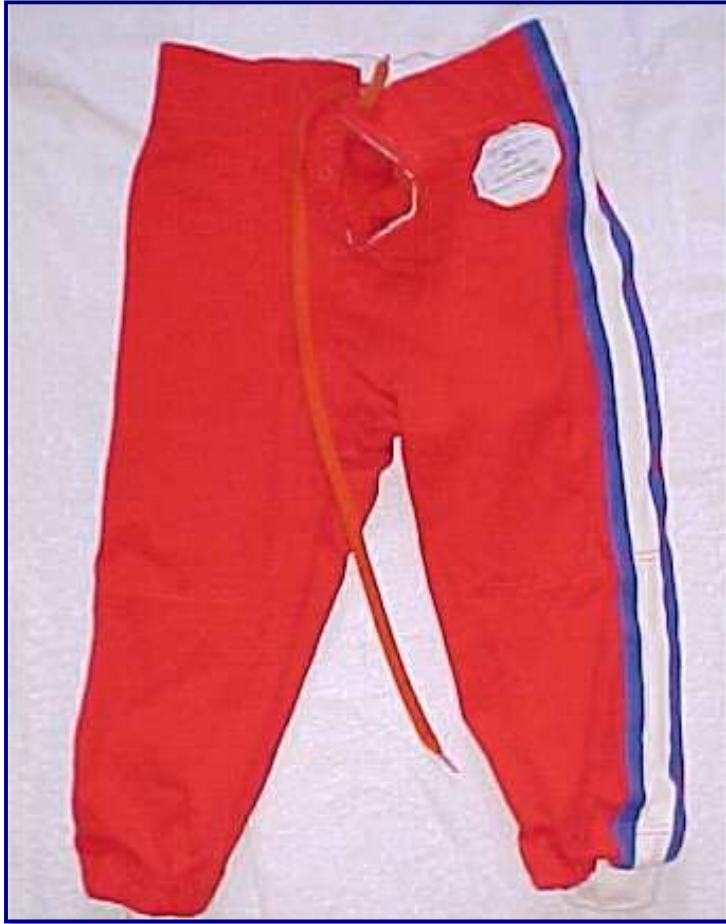
Fig. 68-3. Orange pants worn with road uniforms 1968-'71 and 1978-'79