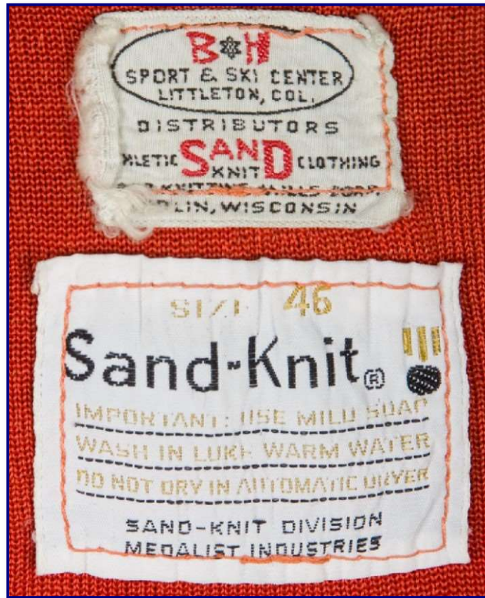
Fig. 67-5. Circa 1967-'68 Medalist Sand-Knit manufacturing tag incorporating sizing designator and laundering instructions; with upper "exclusive" tag identifying distributor as "B&H Sport and Ski Center" of Littleton, Colorado