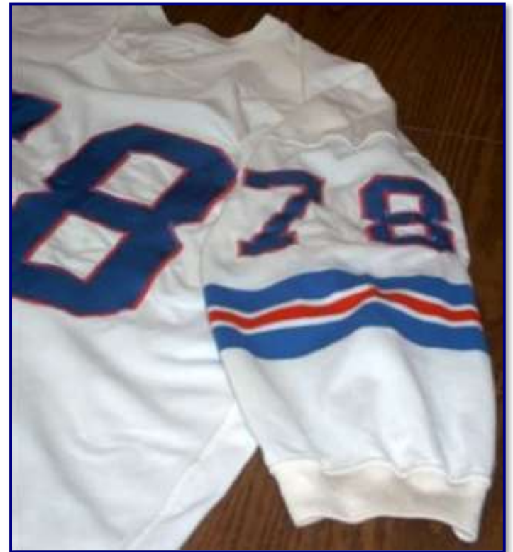
Figs. 67-9 & 67-10. Nameplate/rear number (left) and sleeve detail of 1967-'68 road jersey