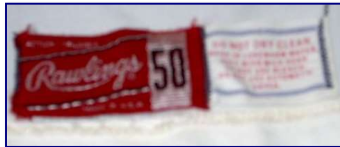
Fig. 67-8. Tagging detail of 1967-'68 road jersey