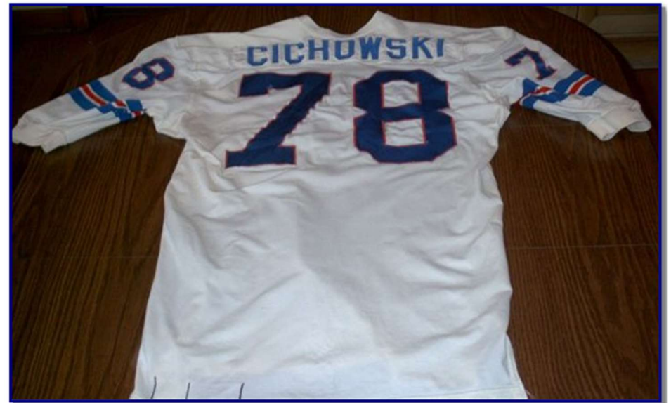
Figs. 67-6 & 67-7. Front and rear views of 1967-'68 road jersey (T. Cichowski)