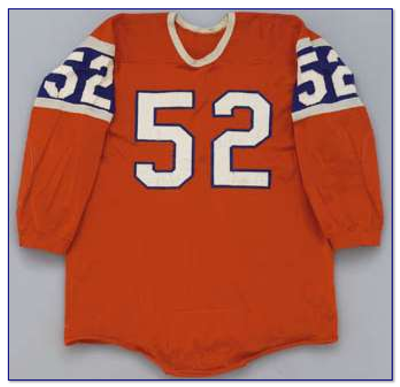
Fig. 66-2. Front view of circa 1966 home jersey of Ray Kubala. Note numbering font with the "squared" 5 and cut crotch strap.