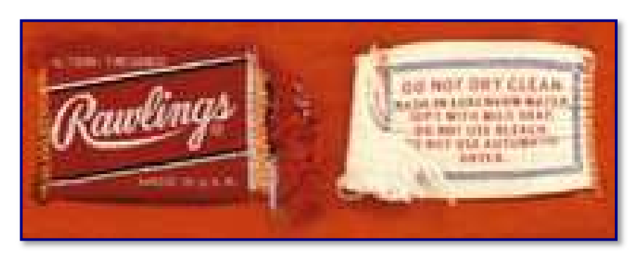
Fig. 66-3. Tagging detail (located inside front tail) from 1966 home jersey