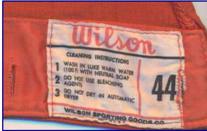
Fig. 62-5. Circa 1963 Wilson Sporting Goods manufacturer's tag detail