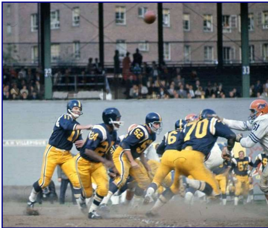
Fig. 62-13. Game action showing early-1962 helmet design with blue logo (C. Gavin, Sep 30)