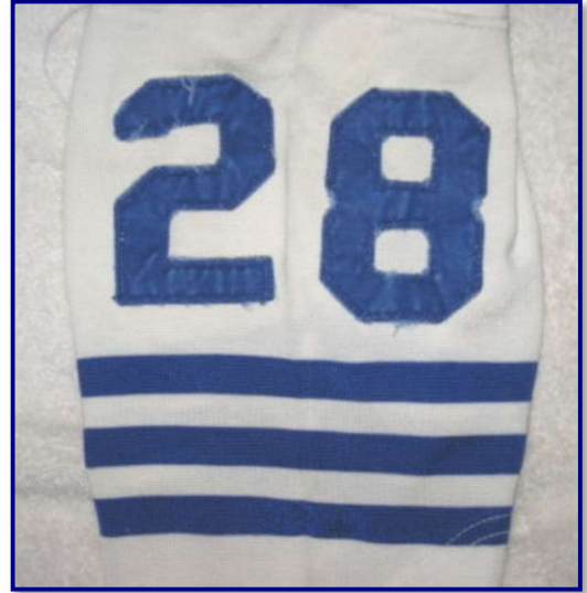
Figs. 62-8 & 62-9. Collar (left) and sleeve (right) detail from circa 1962 road jersey