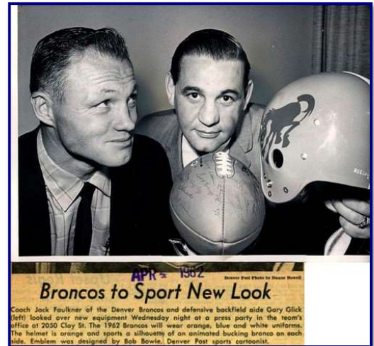
Figs. 62-11 & 62-12. A 1962 season ticket sales brochure promoting the “New colors and uniforms” (left); a press wire photo and associated article from an April 4 th press conference where the new uniforms were first unveiled (right)