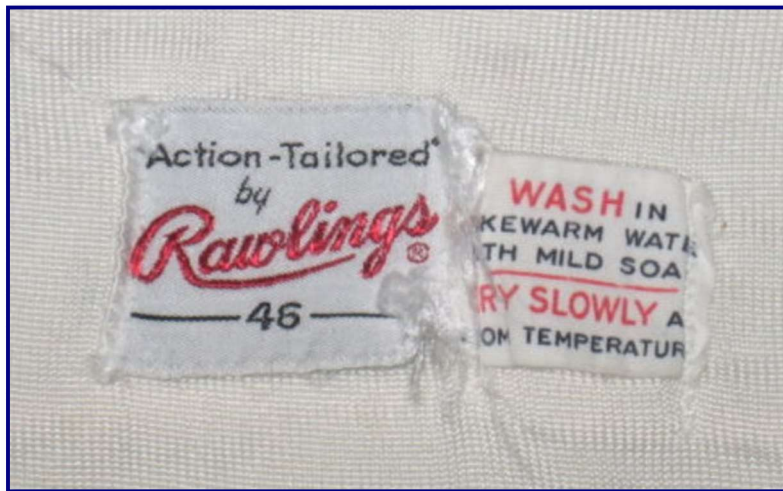
Fig. 62-10. Rawlings' manufacturer tagging detail from circa 1962 road jersey