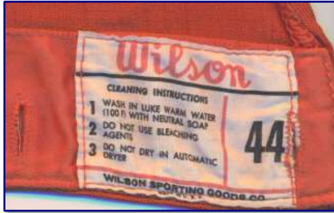
Fig. 62-5. Circa 1963 Wilson Sporting Goods manufacturer's tag detail