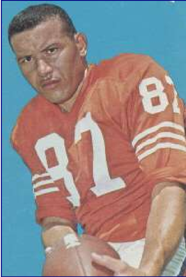
Fig. 62-1. 1962-'64 era home uniform