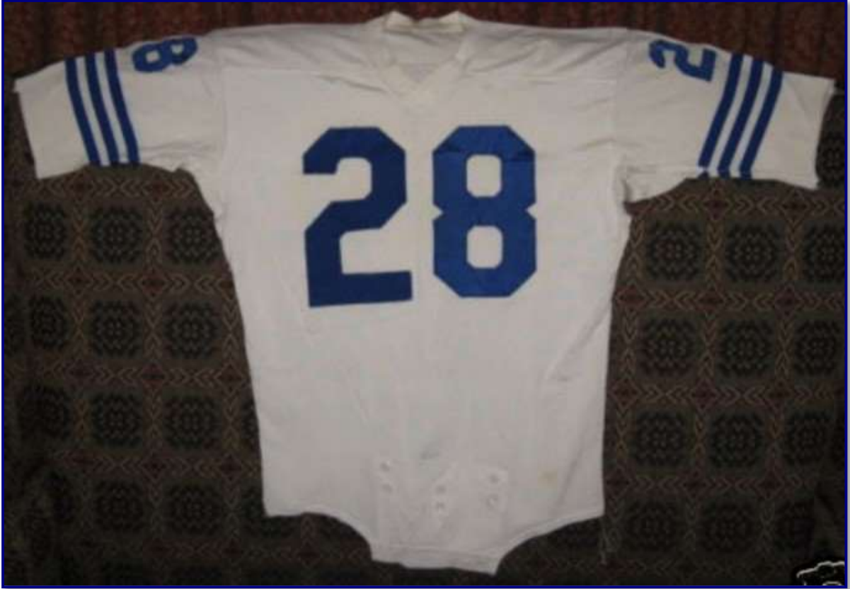
Figs. 62-6 & 62-7. Front (above) and rear (below) views of circa 1962 issued road jersey