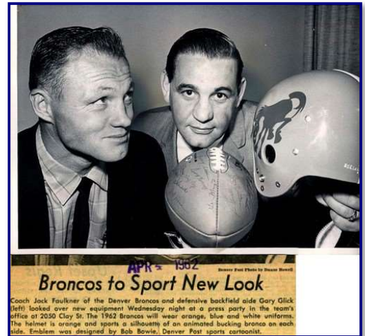
Figs. 62-11 & 62-12. A 1962 season ticket sales brochure promoting the “New colors and uniforms” (left); a press wire photo and associated article from an April 4 th press conference where the new uniforms were first unveiled (right)