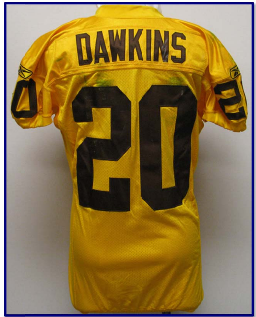
Figs. 09-13 & 09-14. Front and rear view of 2009 home “Legacy” “A”- cut jersey, worn Oct 11th