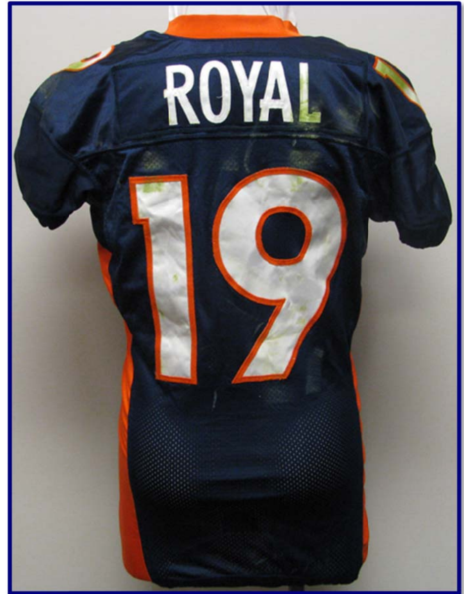
Figs. 09-4 & 09-5. Front and rear view of 2009 home "D"-cut jersey, worn Sep 20th