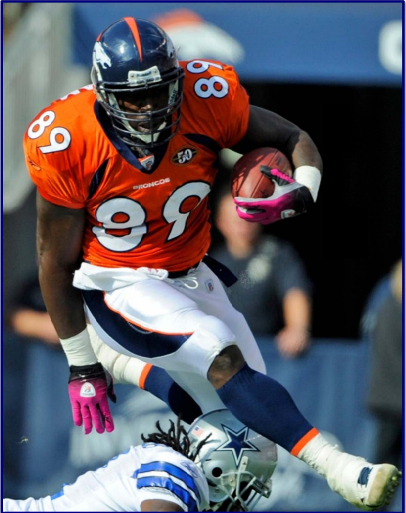
Fig. 09-8. 2009 home alternate uniform (Oct 4).