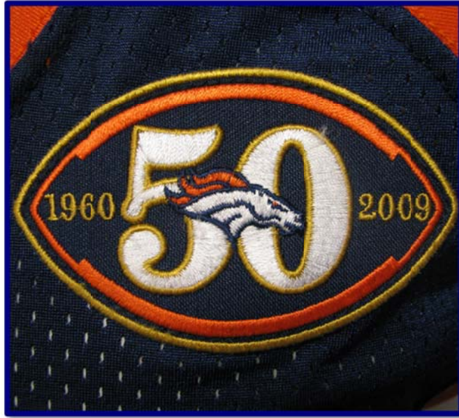
Fig. 09-6. Broncos 50 th Anniversary patch detail from 2009 home jersey