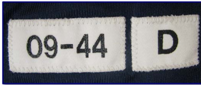
Fig. 09-7. Collar tagging detail from 2009 home jersey.