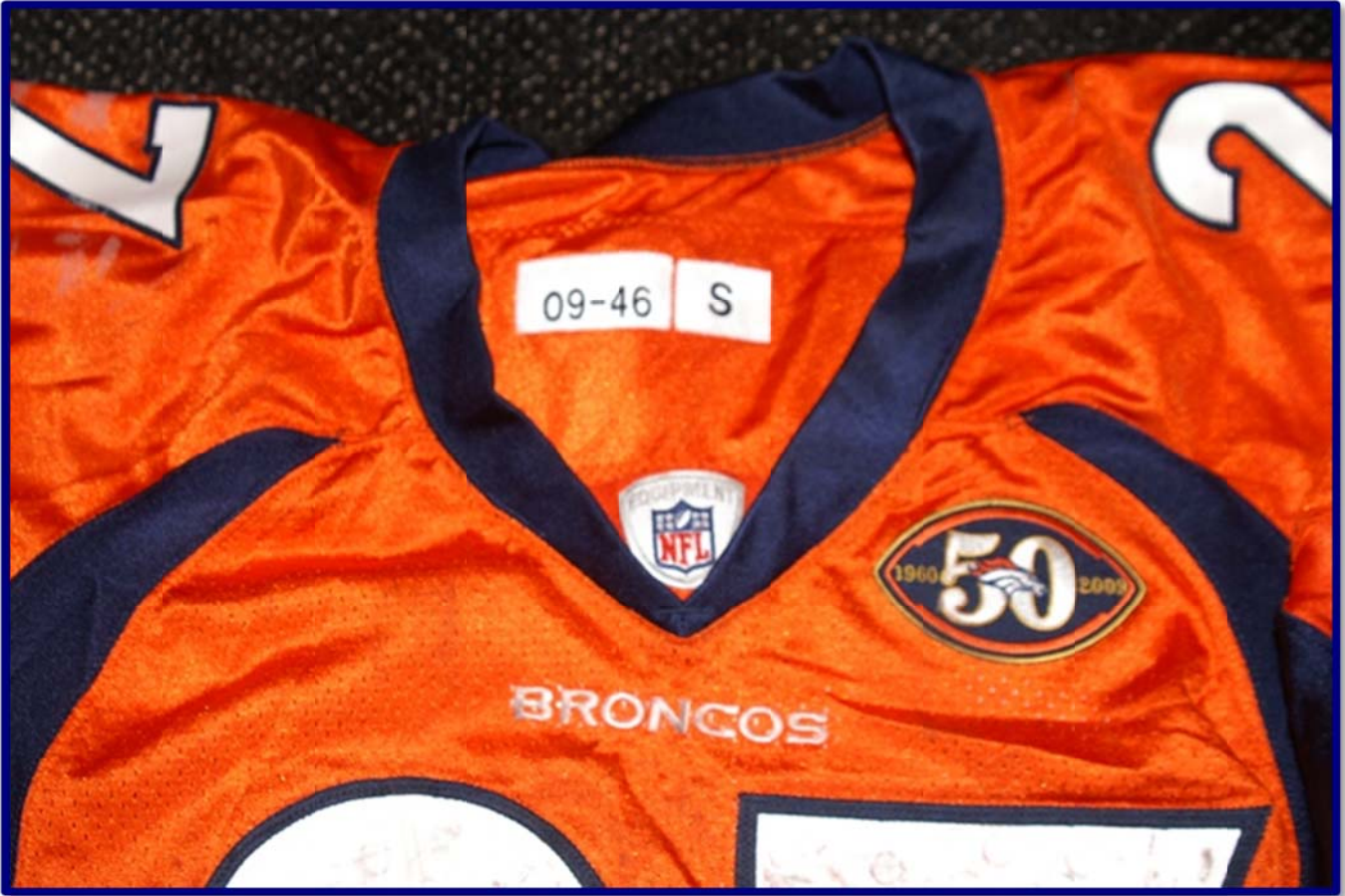
Fig. 09-11. Collar detail from 2009 home alternate jersey, worn Oct 4th. Note Broncos 50th Anniveresary commemorate patch