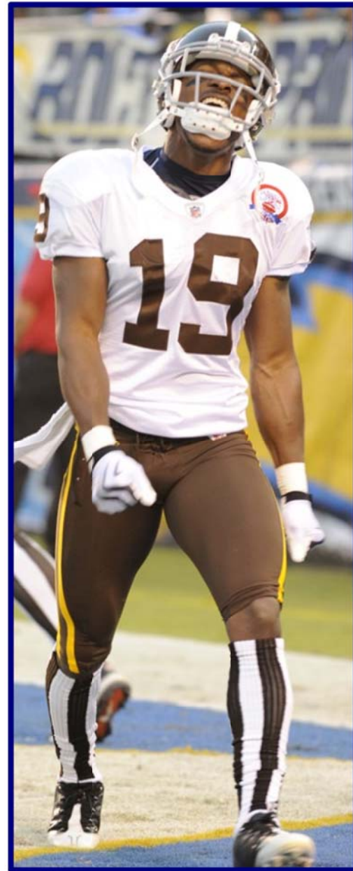
Figs. 09-11 & 09-12. 2009 “Legacy” home (Oct 11) and road (Oct 19) uniforms