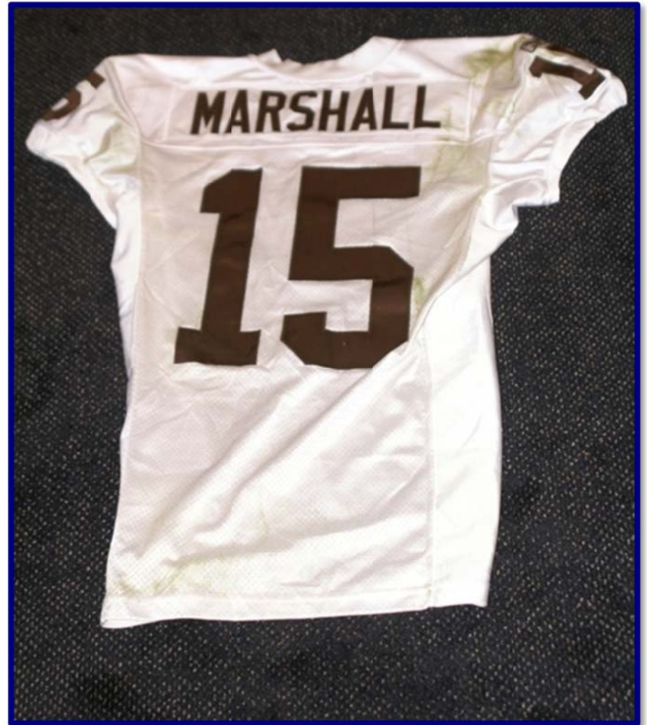
Figs. 09-16 & 09-17. Front and rear view of 2009 road “Legacy” “A”- cut jersey, worn Oct 19th