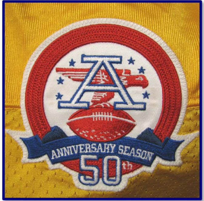
Figs. 09-15 & 09-16. Collar tagging (left) and AFL 50 th Anniversary patch detail from 2009 home “Legacy” jersey (B. Dwkins, worn Oct 11 th )