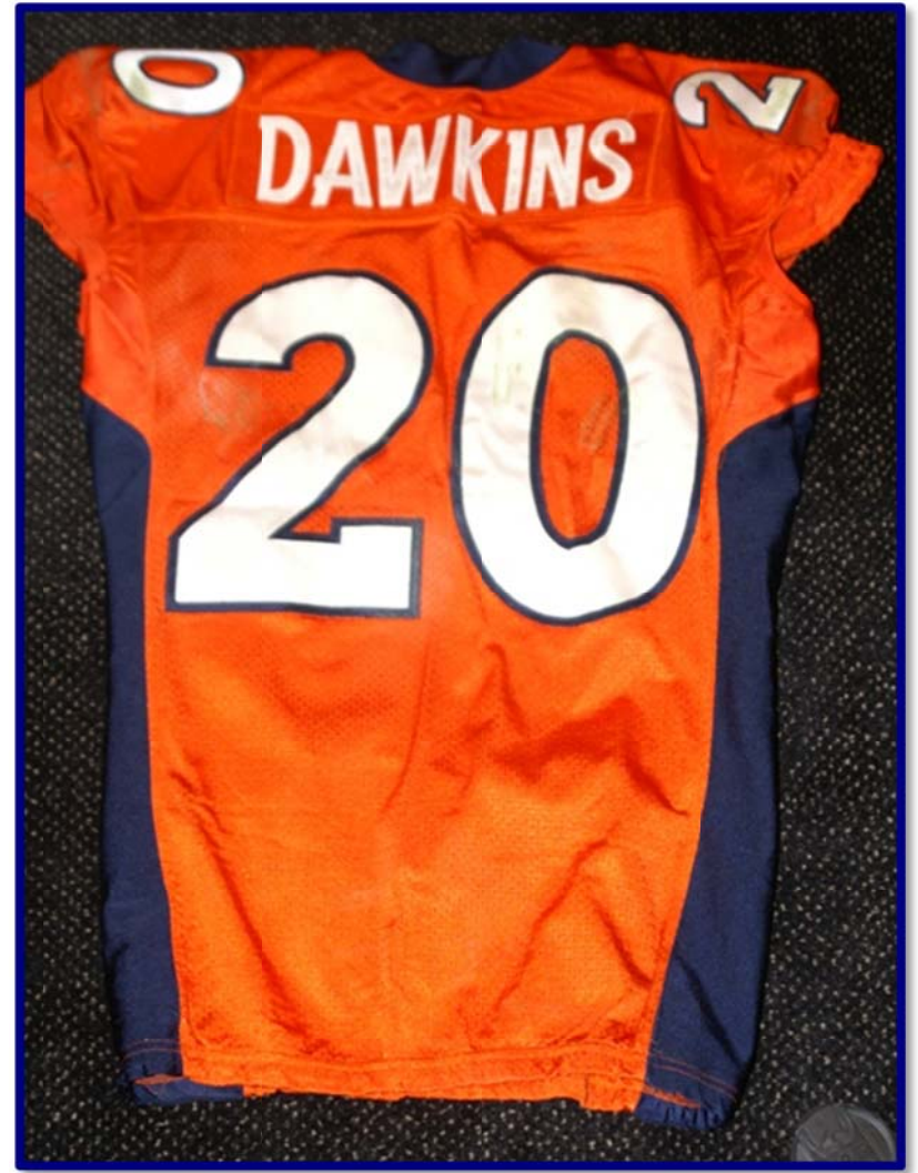
Figs. 09-9 & 09-10. Front and rear view of 2009 home alternate "D"- cut jersey, worn Oct 4th