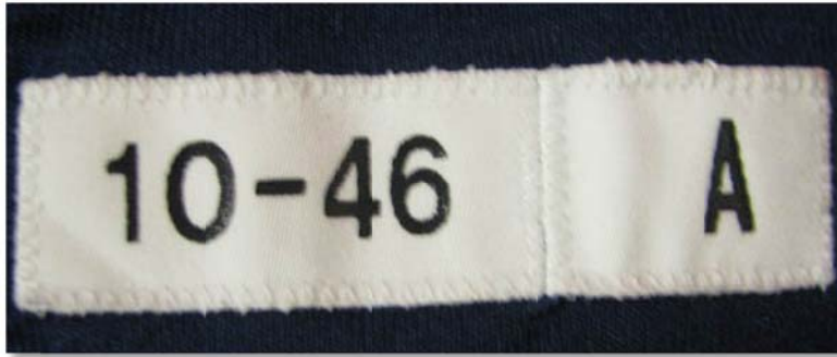
Fig. 10-6. Collar tagging detail from 2010 home jersey.