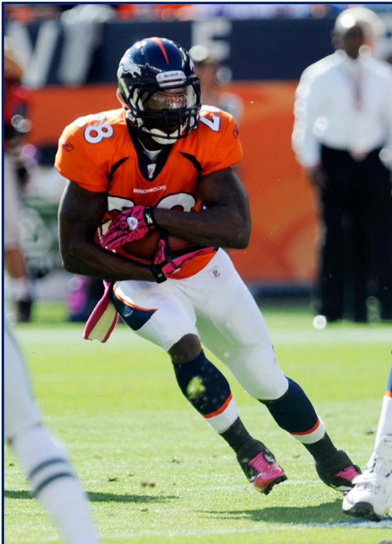
Fig. 10-10. 2010 home alternate uniform (Oct 17).