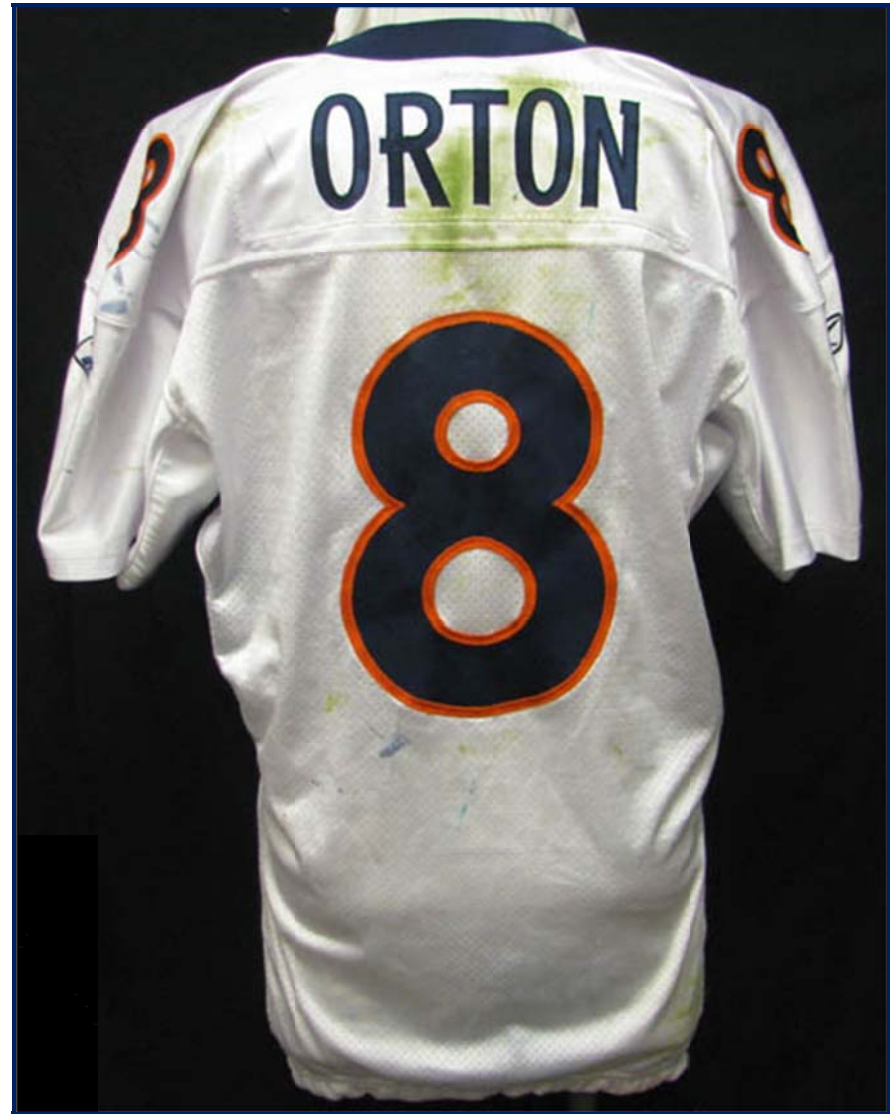
Figs. 10-8 & 10-9. Front and rear view of 2009 home "A"-cut jersey, worn Oct 3rd