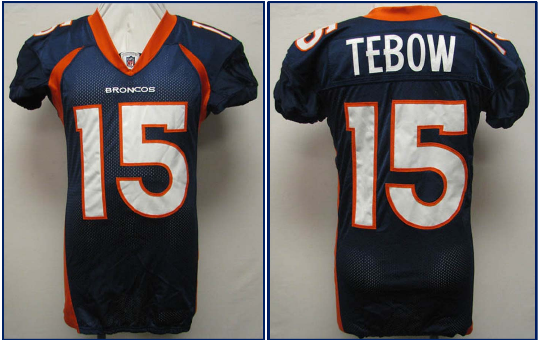
Figs. 10-4 & 10-5. Front and rear view of 2010 home "A"-cut jersey, worn Sep 26th