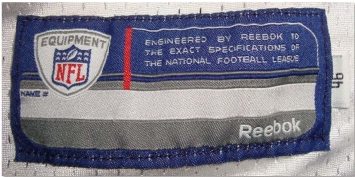
Fig. 10-7. Tail tagging detail from 2010 road jersey.