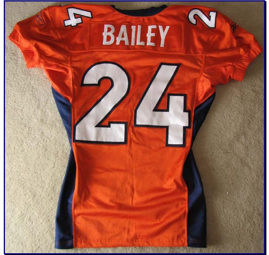
Figs. 08-7 & 08-8. Front and rear view of 2008 home alternate skill "S"- cut jersey, worn Sep 21st