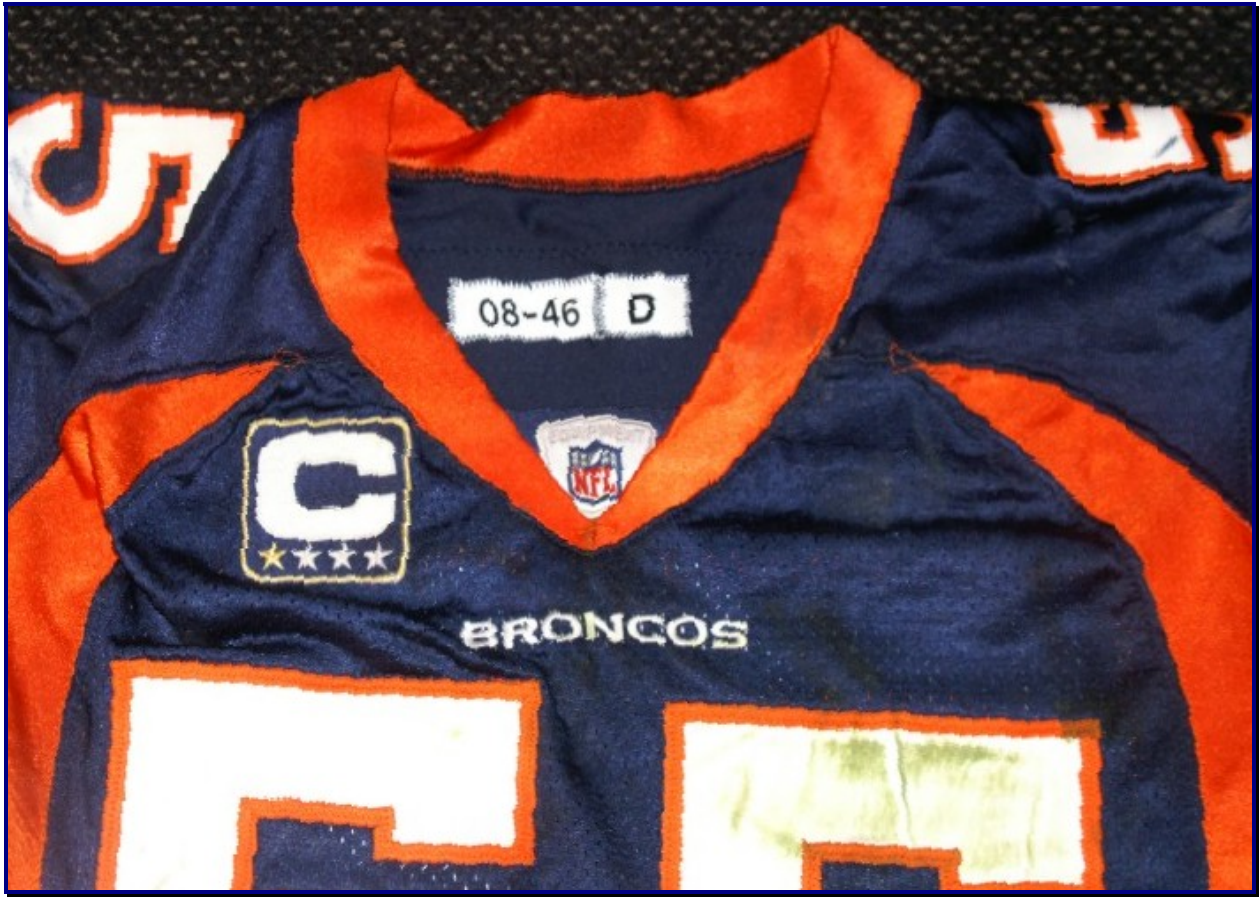
Fig. 08-5. Collar detail from 2006 home jersey