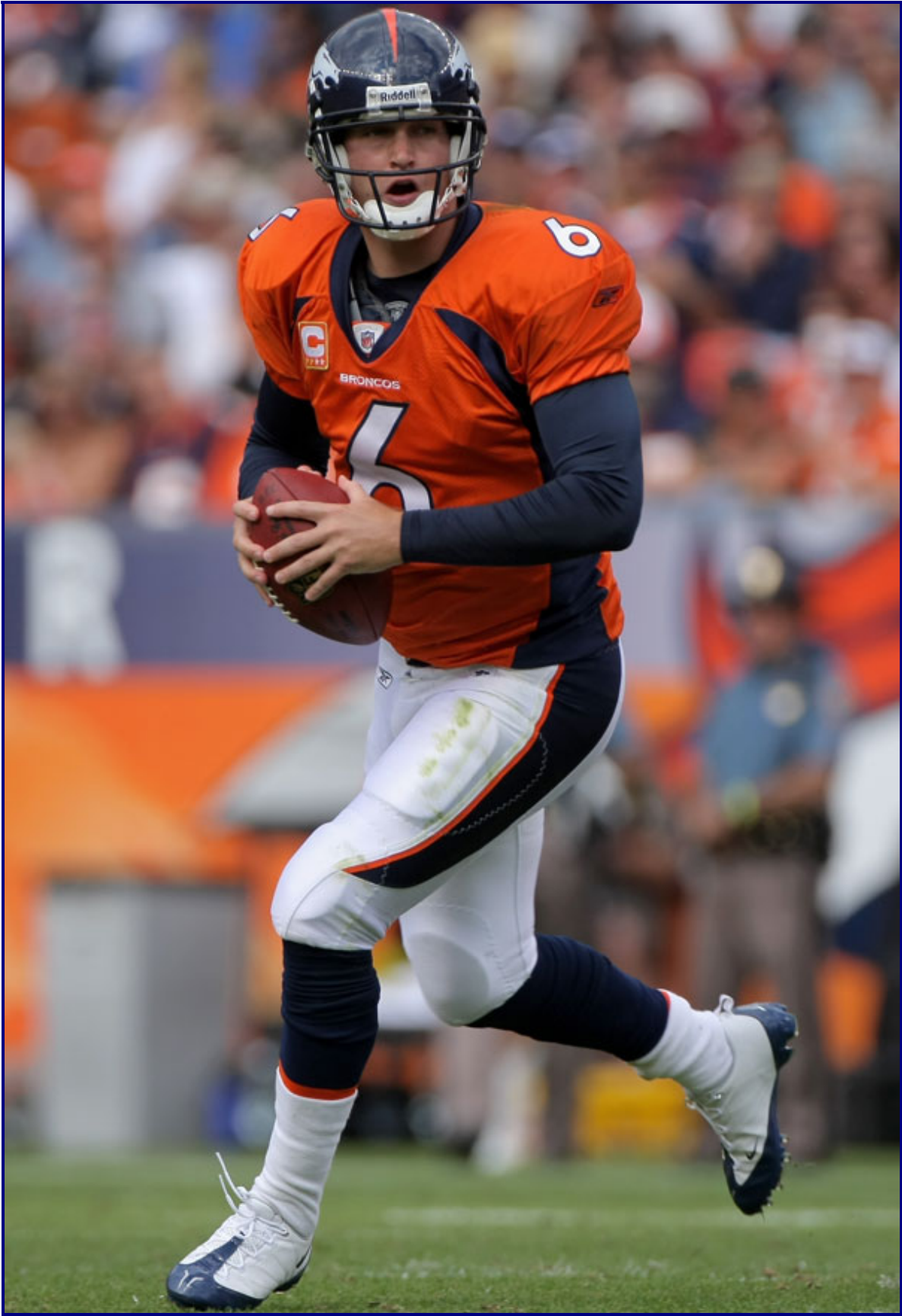
Fig. 08-6. 2008 home alternate uniform (Sep 21).