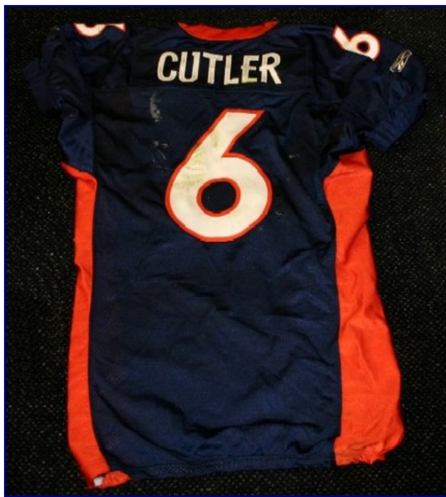
Figs. 07-4 & 07-5. Front and rear views of 2006 home jersey