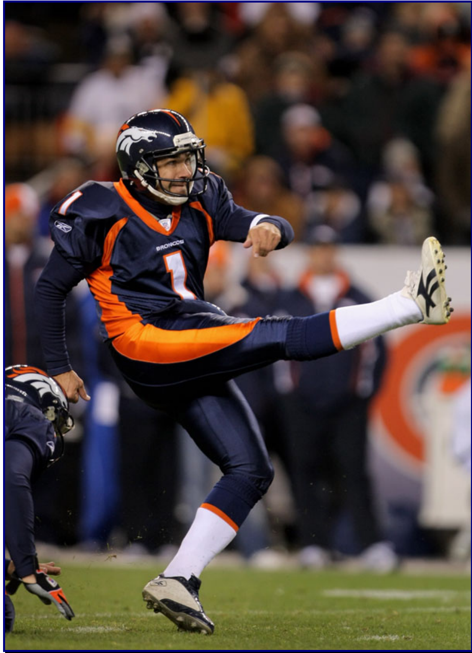
Fig. 07-3. Alternate home uniform (Oct 21)