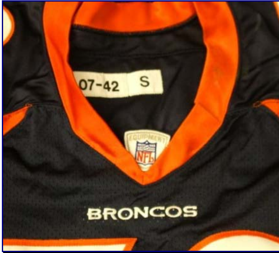
Figs. 07-6. Collar detail from 2007 home jersey