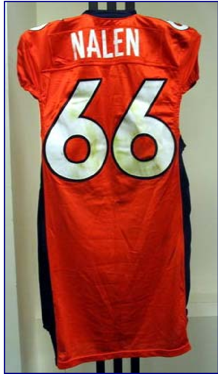
Figs. 04-8 & 04-9. Front and rear views of 2004 home alternate "offensive lineman" jersey