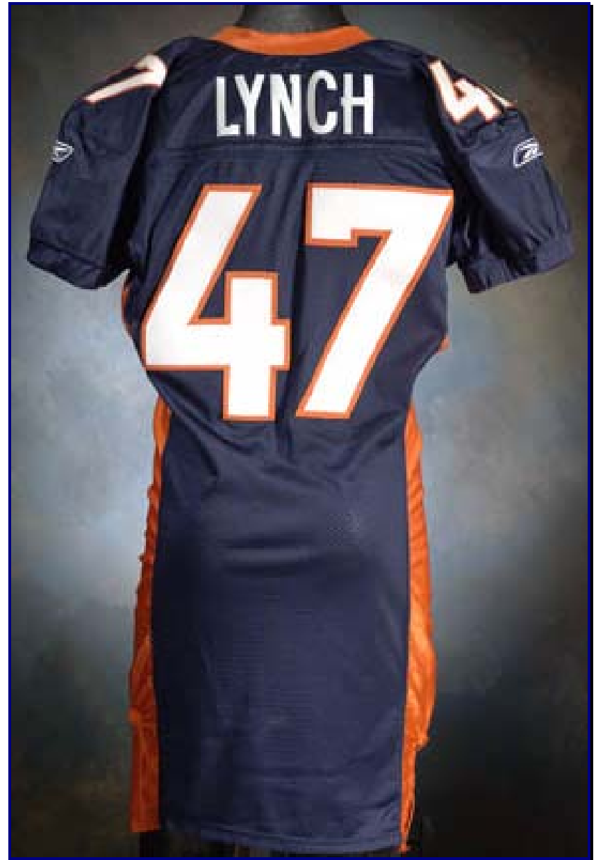
Figs. 04-3 & 04-4. Front and rear view of 2004 home "skill" jersey