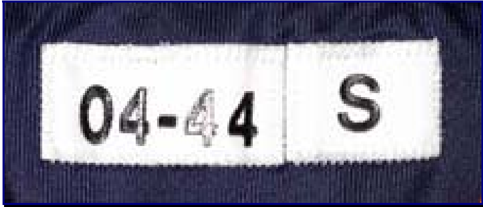
Fig. 04-5. Collar tagging detail from 2004 home jersey