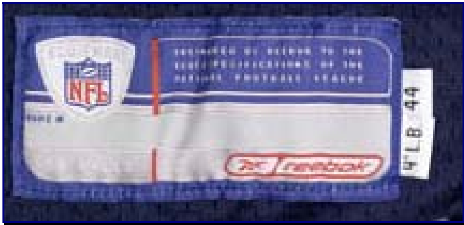
Fig. 04-6. Manufacturer's tail tagging detail from 2004 home jersey