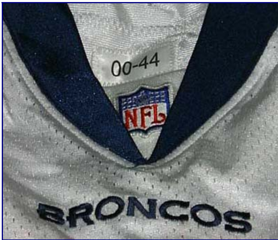
Fig. 00-7. Collar detail from 2000 road jersey