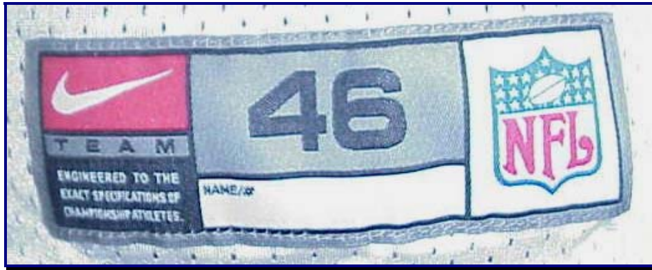
Fig. 00-6. Manufacturer's tail tagging detail from 2000 road jersey