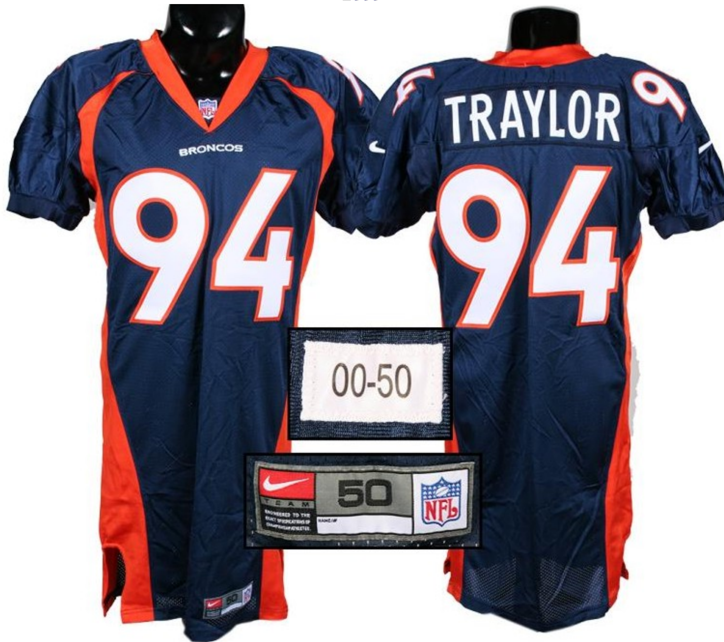
Fig. 00-3. Front, rear and tagging detail (inset) views of 2000 home jersey