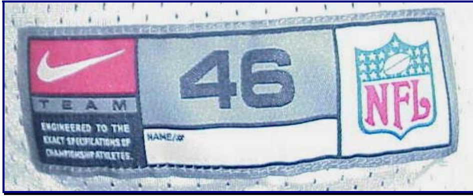
Fig. 00-6. Manufacturer's tail tagging detail from 2000 road jersey