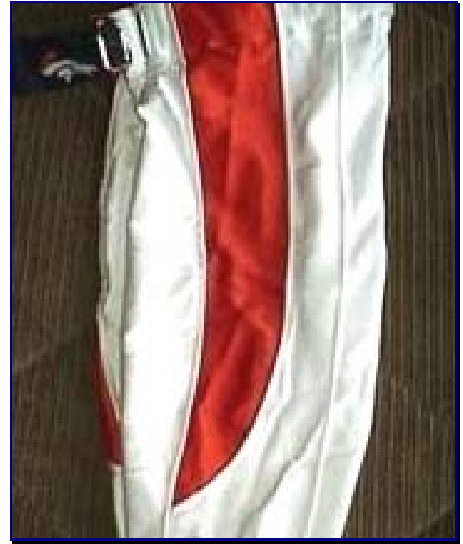
Figs. 00-8 & 00-9. Front and side views of 2000 Nike home pants