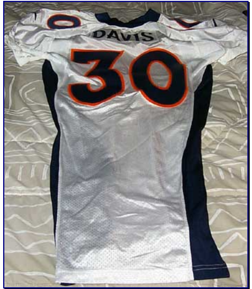
Figs. 00-4 & 00-5. Front and rear views of 2000 road jersey