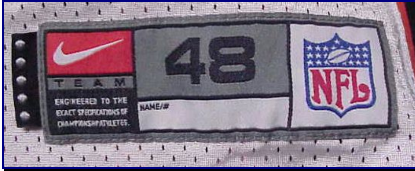
Fig 99-8. 1999 Nike manufacturer's tail tag.