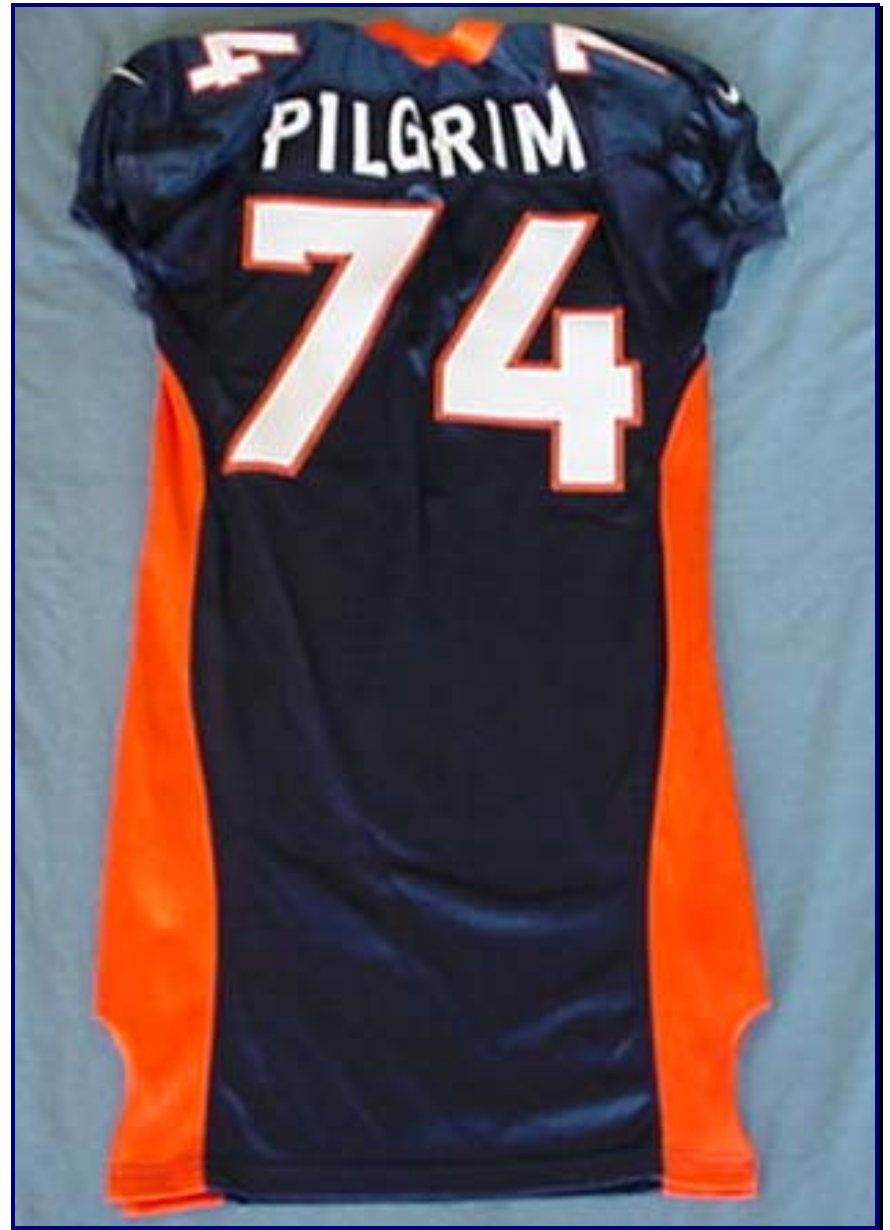
Figs. 99-3 & 99-4. Front and rear view of 1999 home jersey