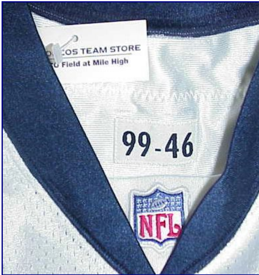
Fig. 99-9. Collar detail from 1999 road jersey