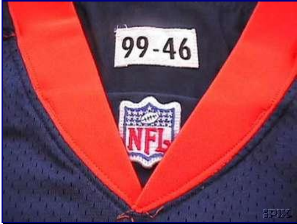
Fig 99-5. Collar detail from 1999 home jersey