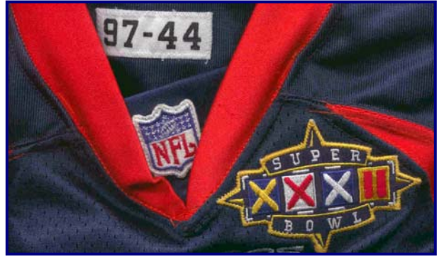
Fig. 97-6. Collar & tagging detail from 1997 home jersey (Note shoulder patch worn for Super Bowl XXXII on 1/25/98)