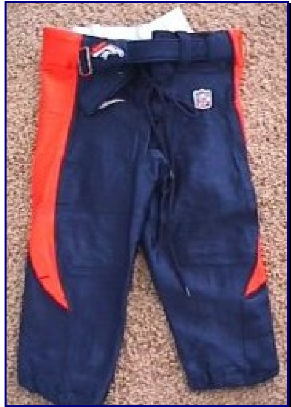
Fig. 97-9. Navy pants for alternate home uniform (worn Jul 26 and Aug 23, during '97 pre-season only)