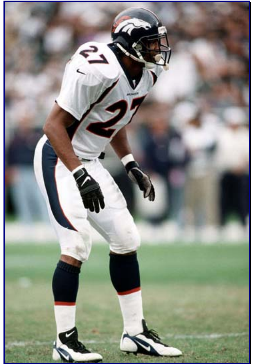
Figs. 97-1 & 97-2. 1997 home and road uniforms