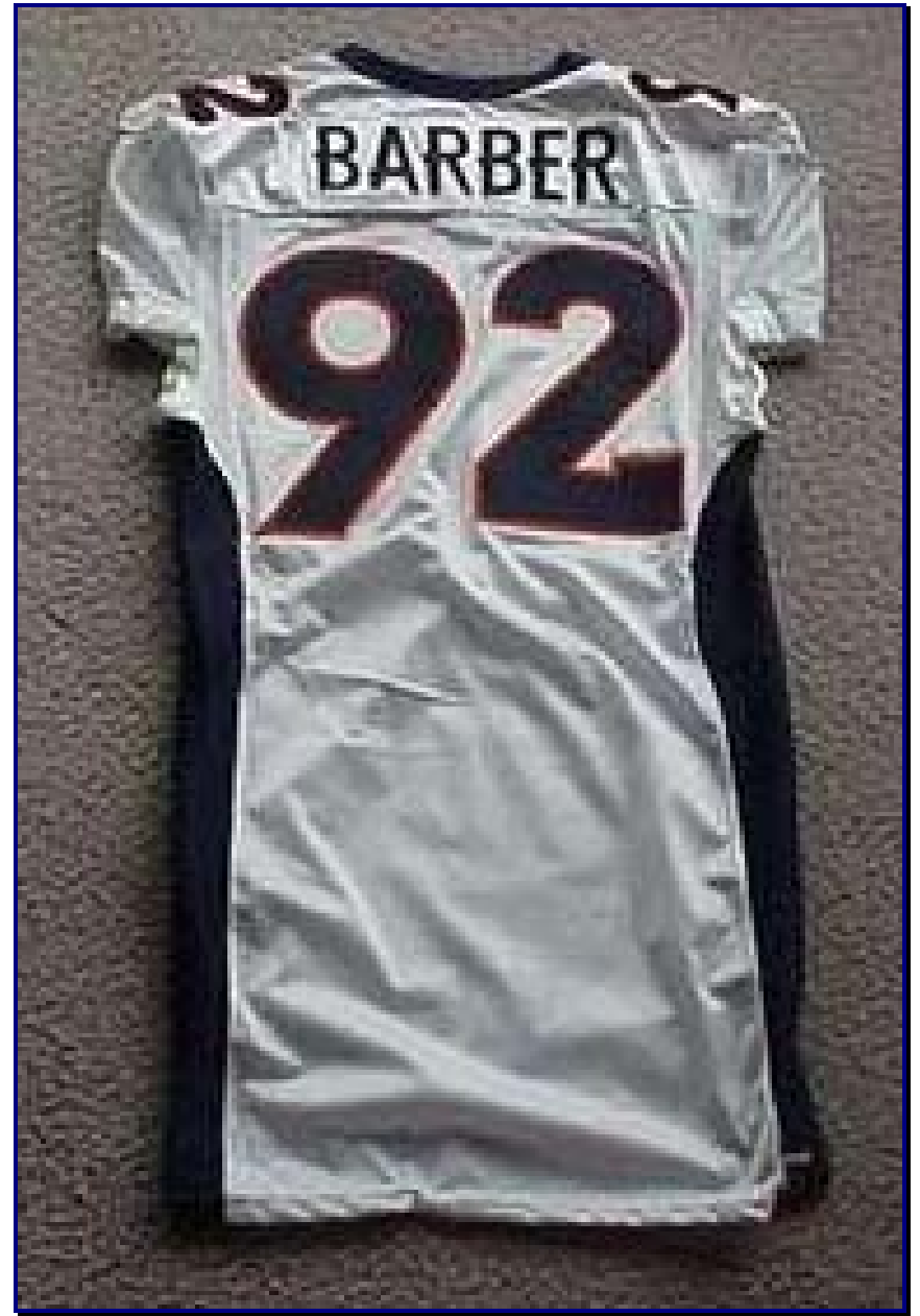
Figs. 97-10 & 97-11. Front and rear views of team-issued 1997 road jersey