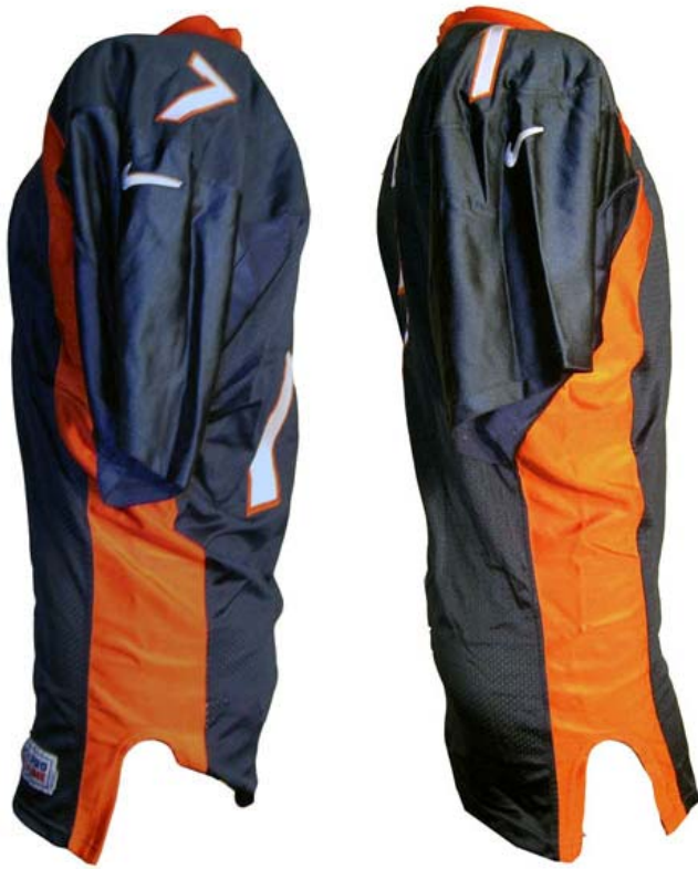
Figs. 97-7 & 97-8. Left and right side views of 1997 home jersey