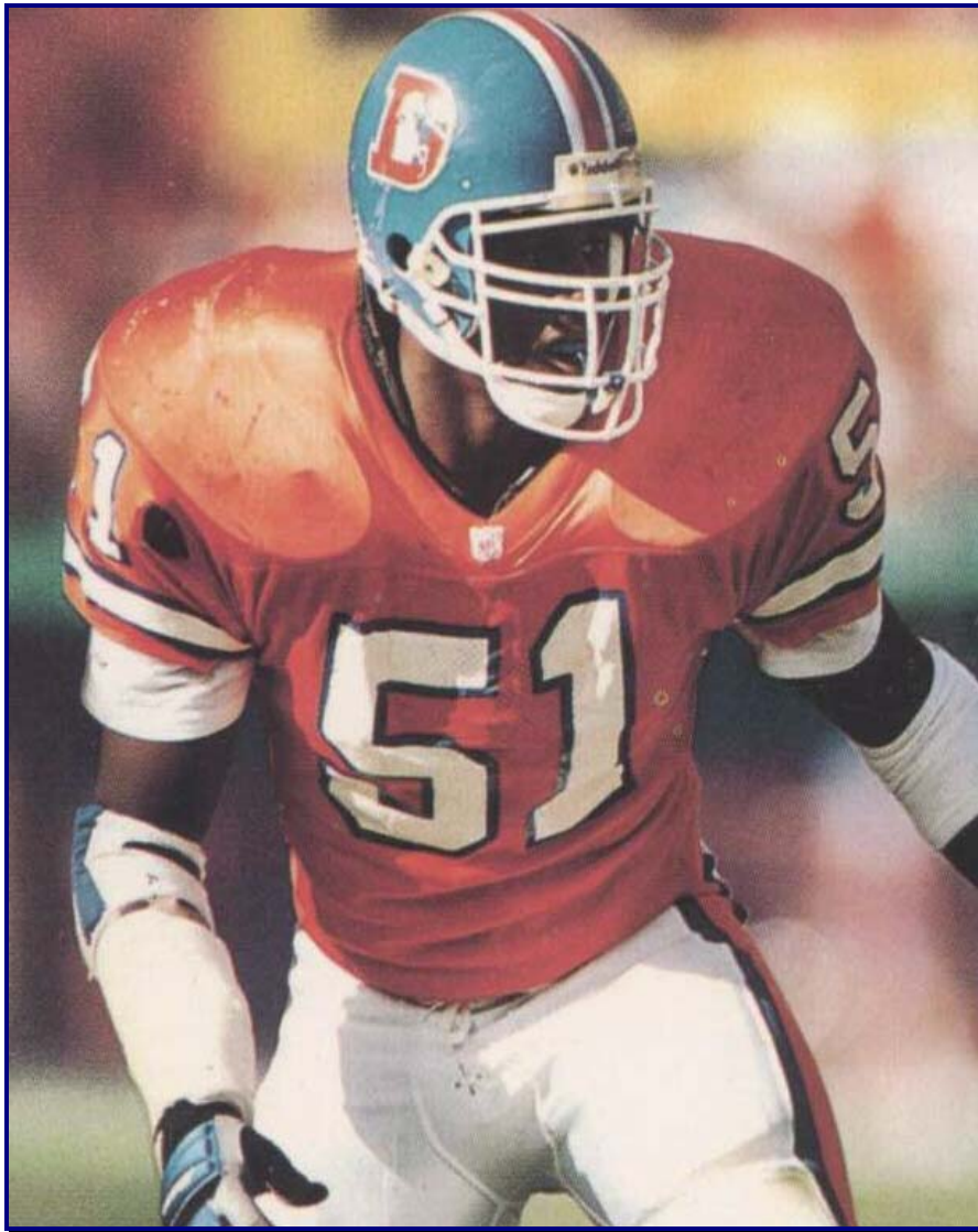
Fig 92-1. 1992 home uniform