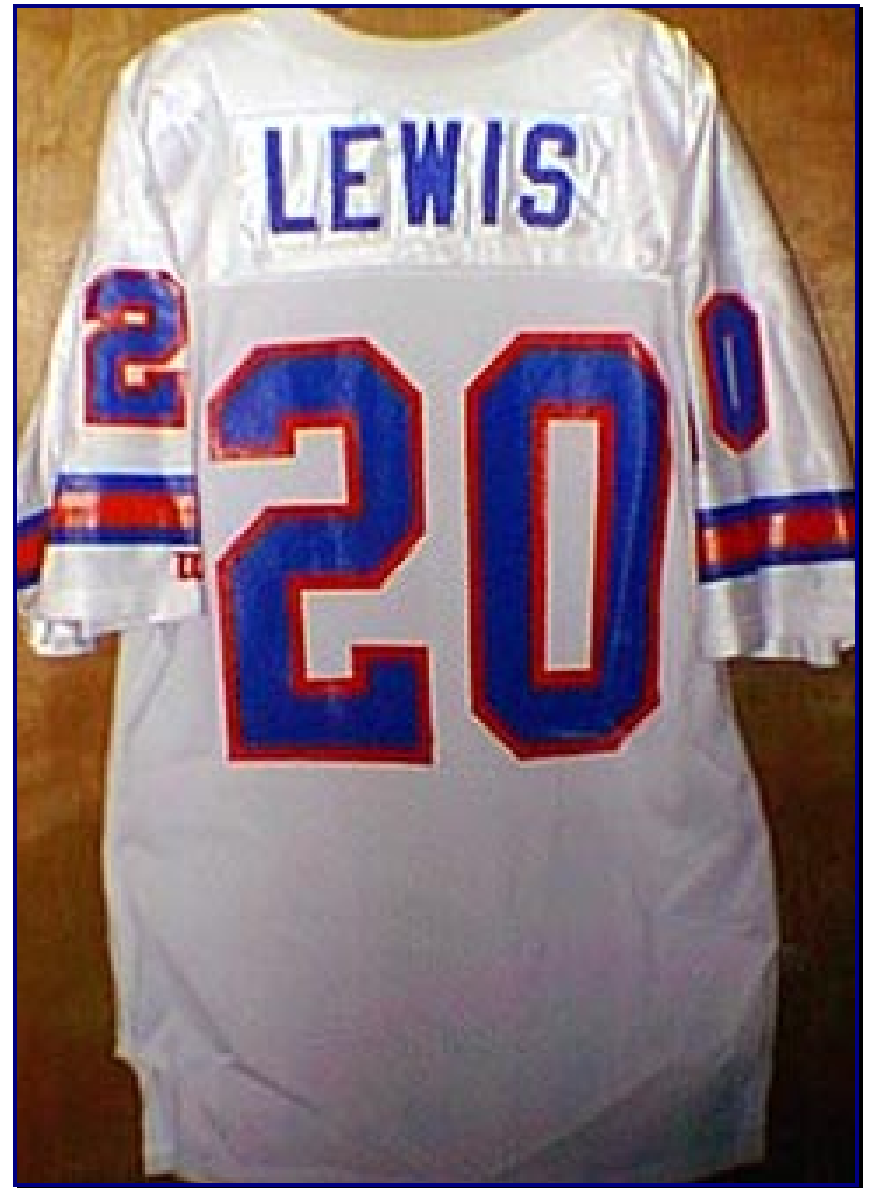
Figs. 92-9 & 92-10. Front and rear views of 1992 road jersey (G. Lewis)