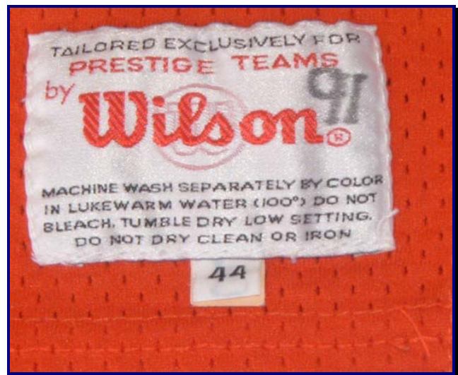
Figs. 92-7 & 92-8. Sleeve and tagging detail of 1992 home jersey