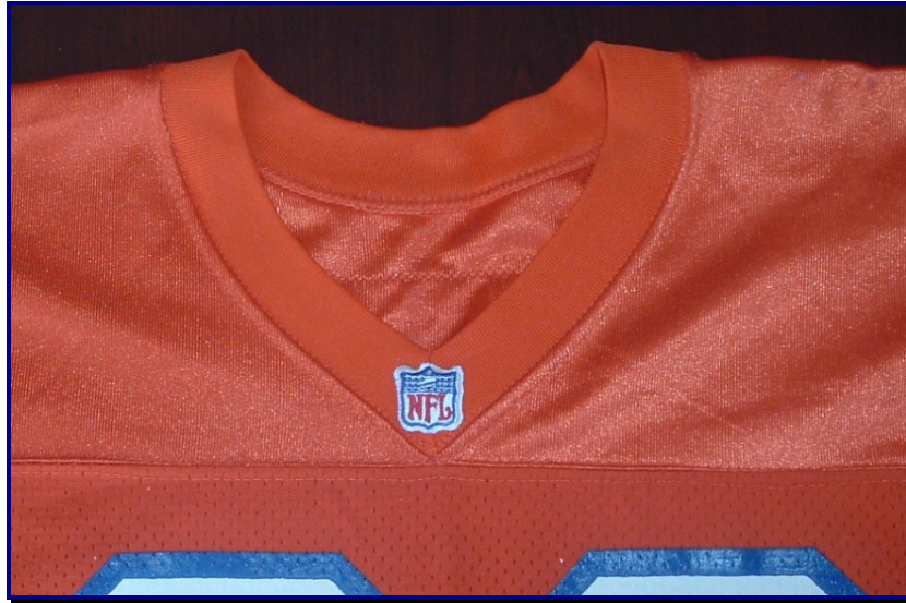
Figs. 92-5 & 92-6. Collar (above) and nameplate (below) detail of 1992 home jersey. Note NFL shield patch affixed on collar (see above)