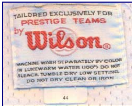
Figs. 92-13. Manufacturer's tag from 1992 and road jersey