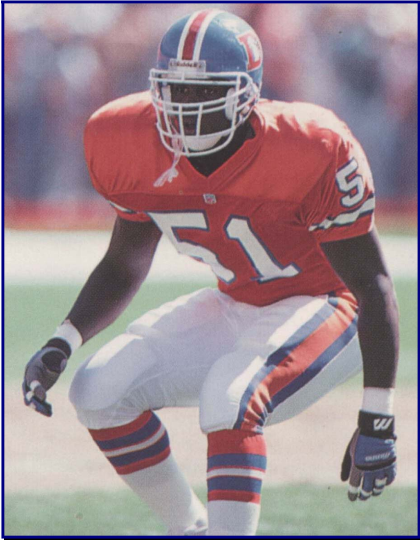
Fig 91-1. 1991 home uniform