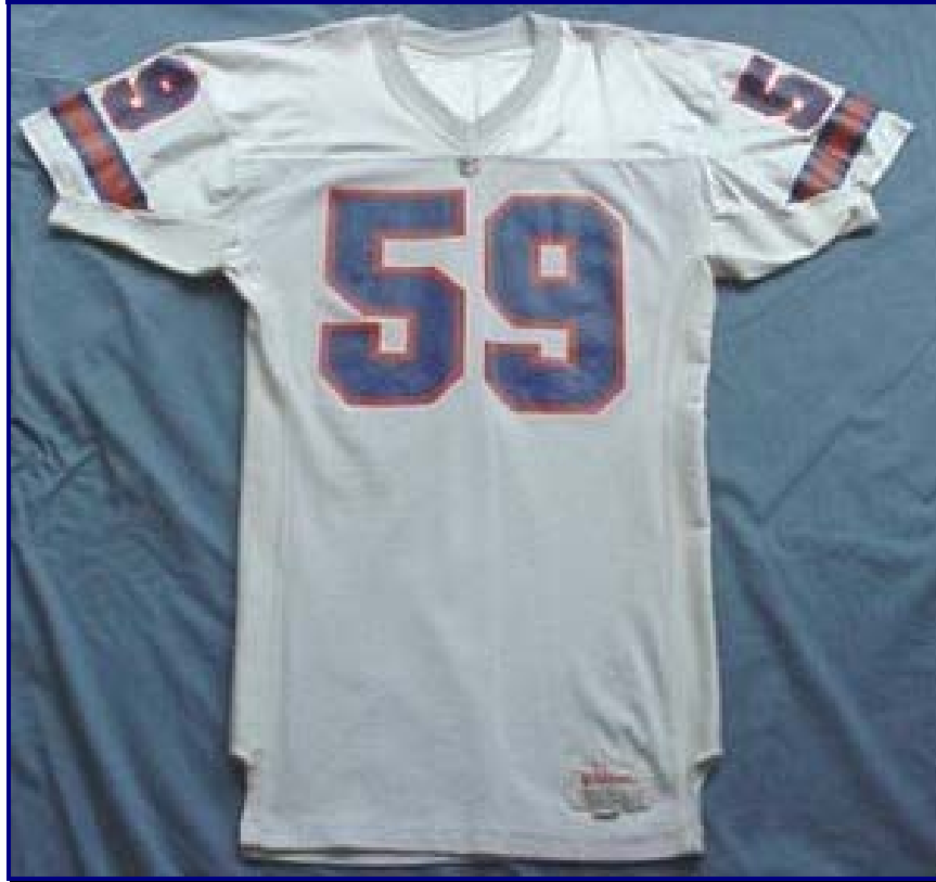
Figs. 91-6 & 91-7. Front and rear views of 1991 Denver Broncos road jersey (T. Lucas)