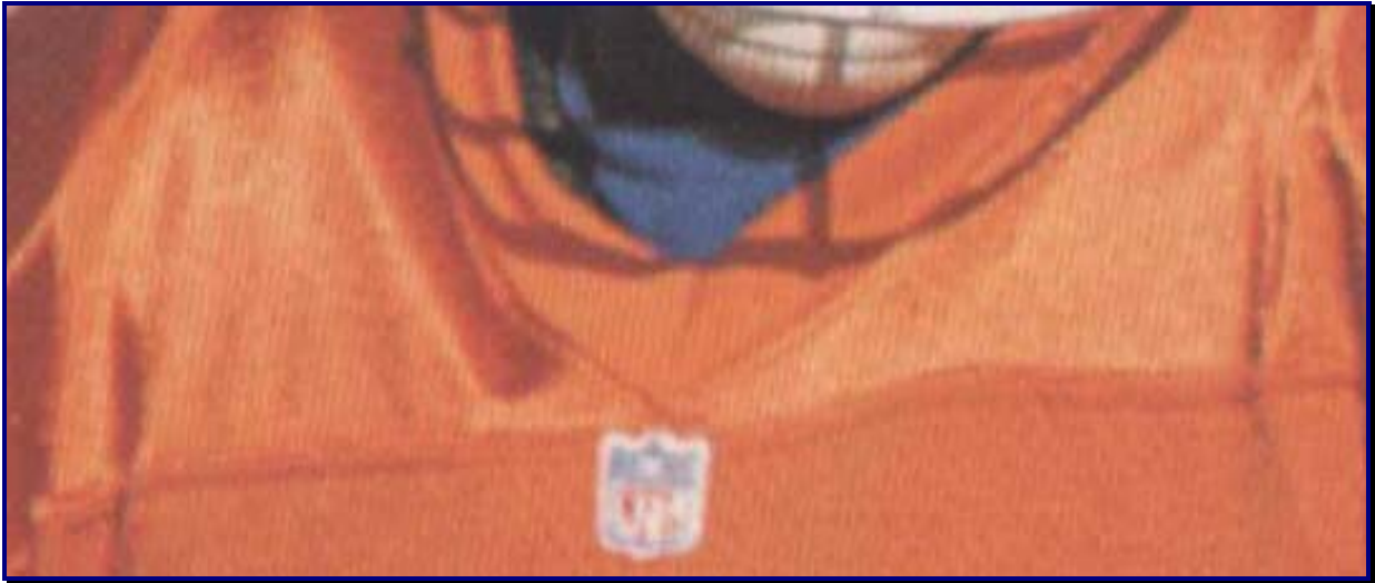
Fig. 91-5. Collar detail of 1991 home jersey. Note NFL shield patch affixed below neckband