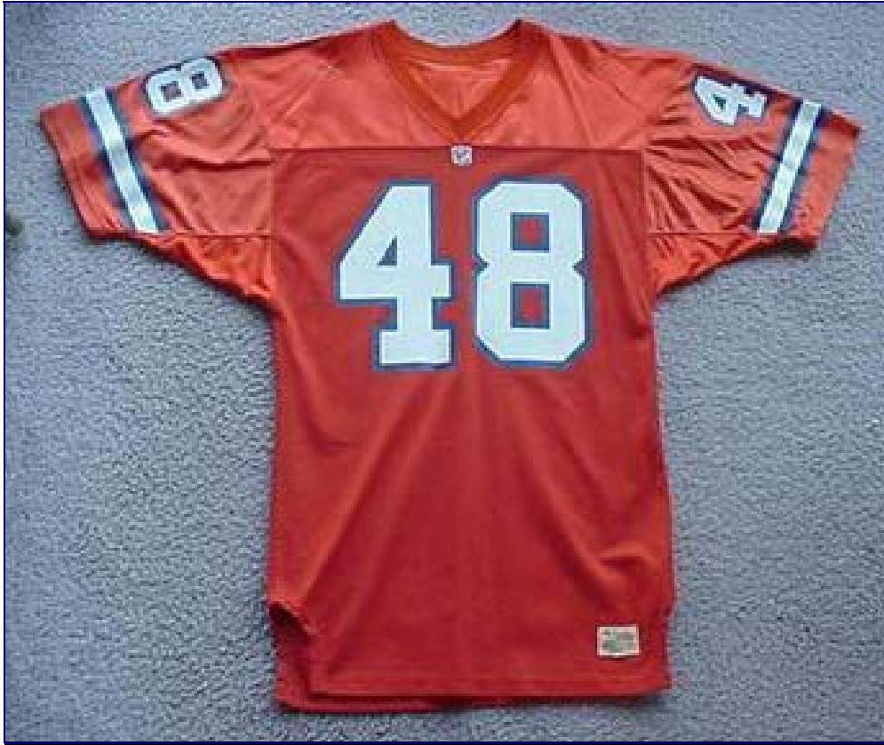
Figs. 91-3 & 91-4. Front and rear views of 1991 Denver Broncos home jersey (R. Robbins)