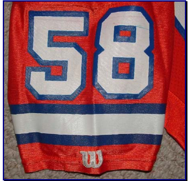
Figs. 89-7 & 89-8. Manufacturer' tagging (left) and sleeve (right) detail from circa 1989 home jersey