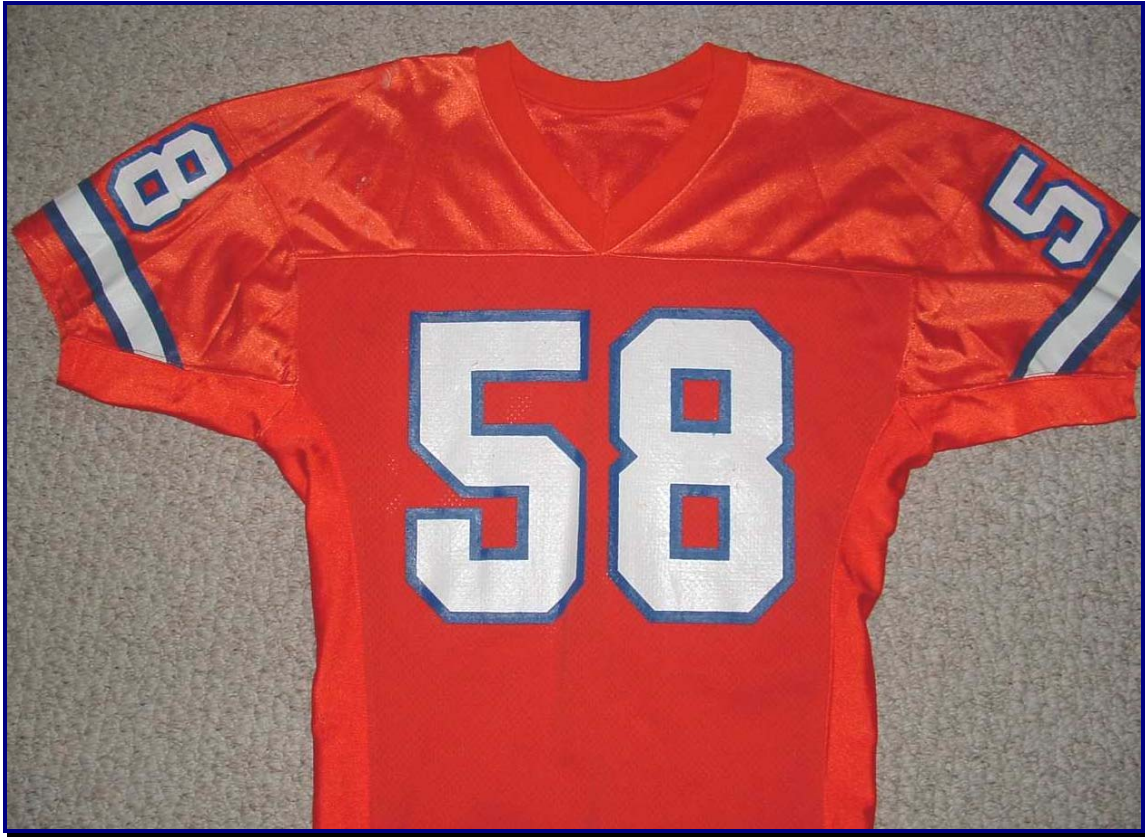
Figs 89-3 & 89-4. Front (above) and rear(below) views of circa 1989 home jersey (S. Curtis)