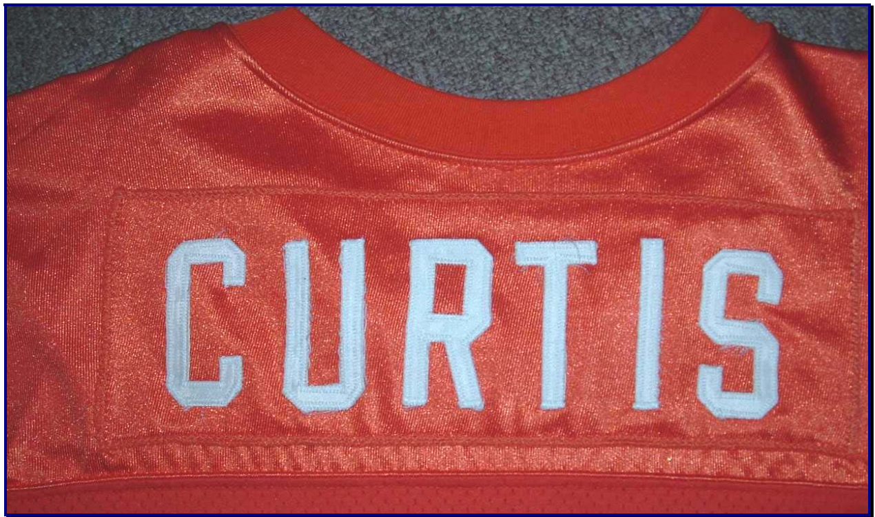
Figs. 89-98. Nameplate detail from circa 1989 home jersey