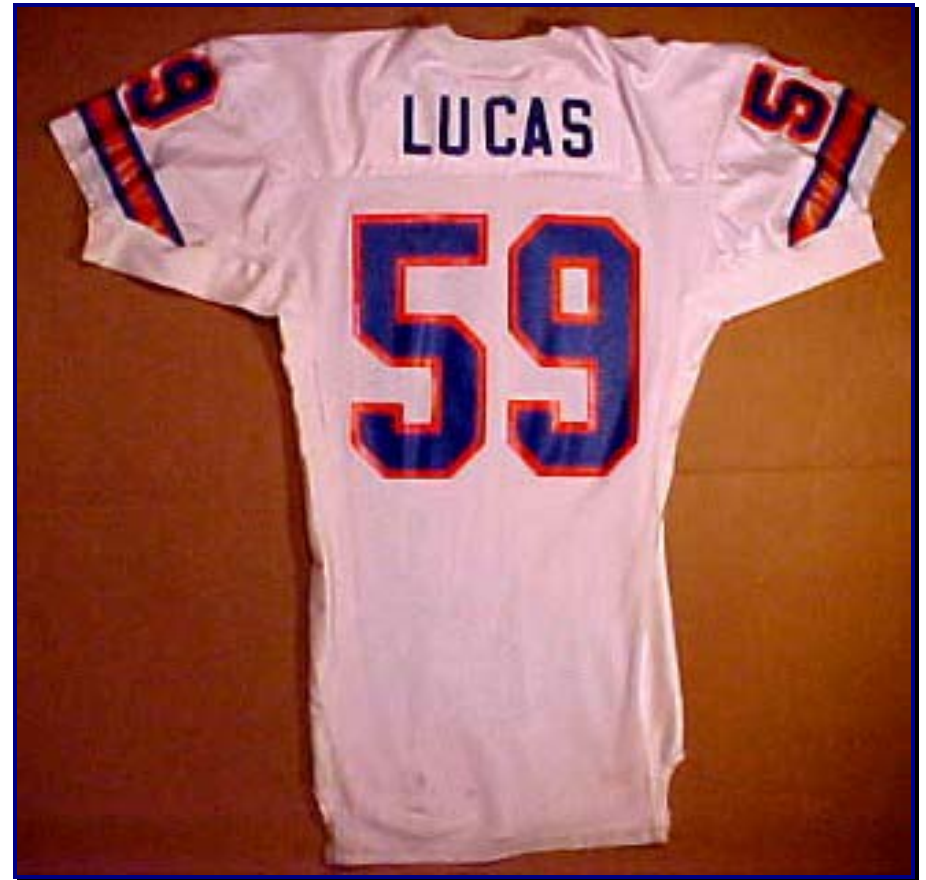
Figs 89-5 & 89-6. Front and rear view of circa 1989 road jersey (T. Lucas)